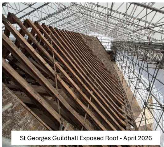
St Georges Guildhall Exposed Roof - April 2026