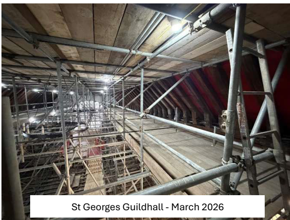
St Georges Guildhall - March 2026