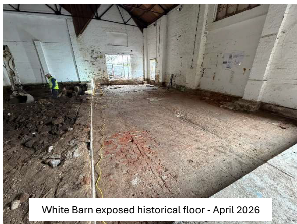
White Barn exposed historical floor - April 2026