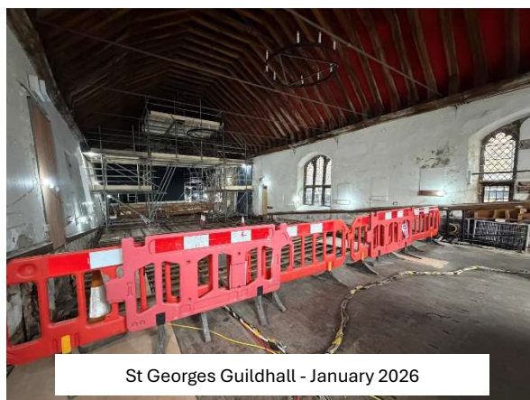
St Georges Guildhall - January 2026