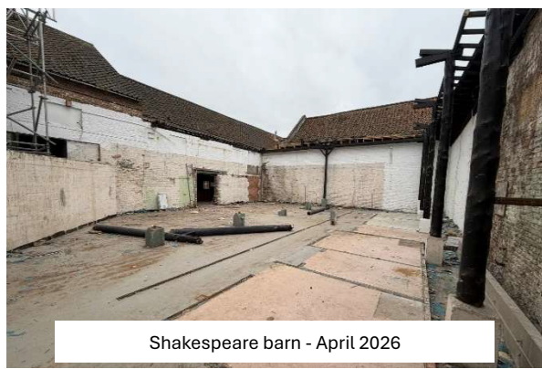
Shakespeare barn - April 2026