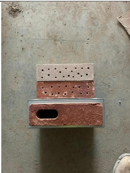
Bird box pre-installation

In addition, the scheme will include the planting of approximately 50 established trees across the development, further enhancing the landscape and ecological value of the site.