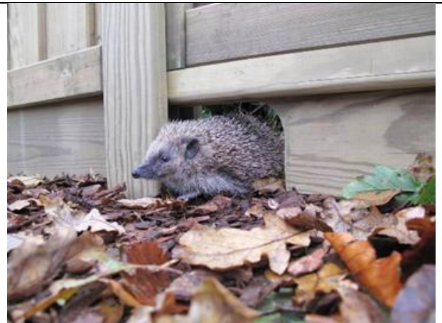
Example of hedgehog highway