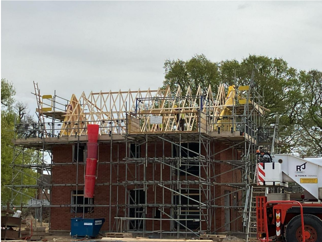
Show home in progress

Welcome to the third instalment of the newsletter for our Florence Fields project, delivered in partnership with the Borough Council of King's Lynn and West Norfolk.