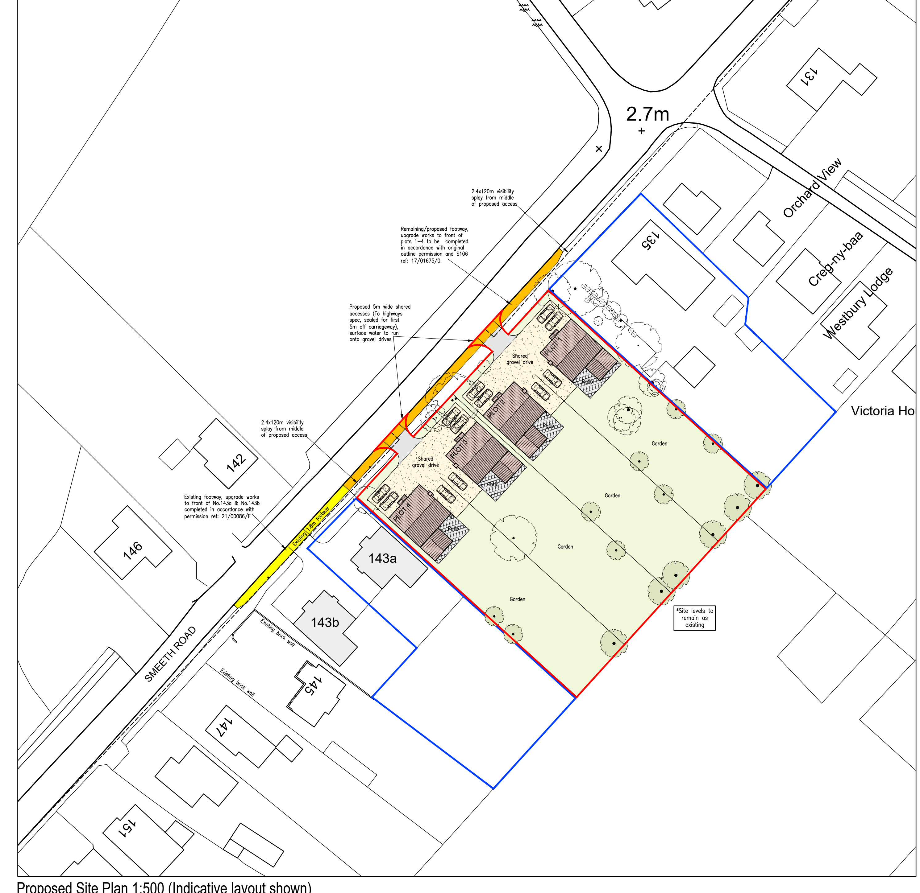
Proposed Site Plan 1:500 (Indicative layout shown)

CLIENT MRS R RIJK JOB NO. PAPER SIZE 6935/01D PROPOSED RESIDENTIAL DEVELOPMENT JAN 2024