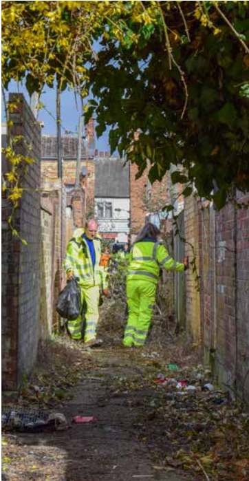
Clean-Up Team at Loke Road