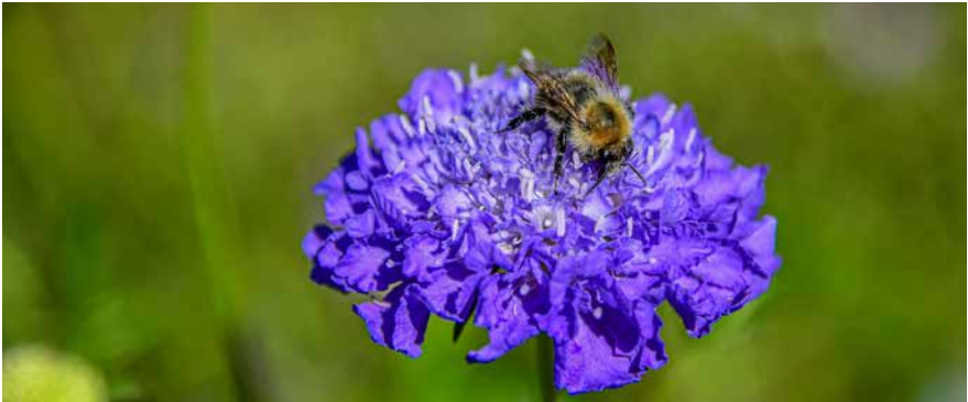
Wildflower and Pollinator Opportunities