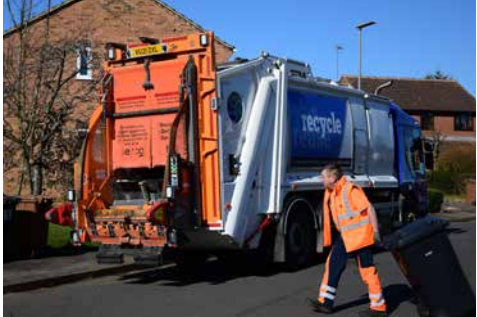
Refuse Bin Collection