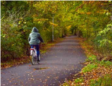
Cycleway, King's Lynn