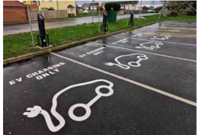
EV Chargers, Lynnsport