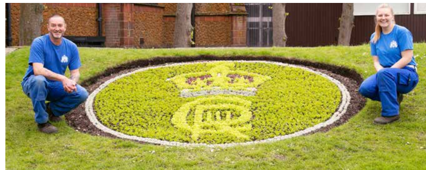
Coronation Badge Flowerbed, Tower Gardens