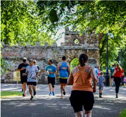
Park Run, The Walks