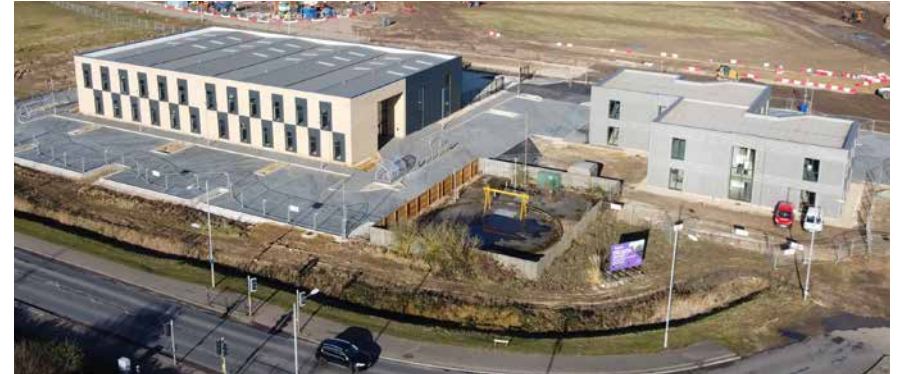
Enterprise Zone, King's Lynn