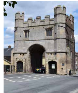
The South Gate, King's Lynn