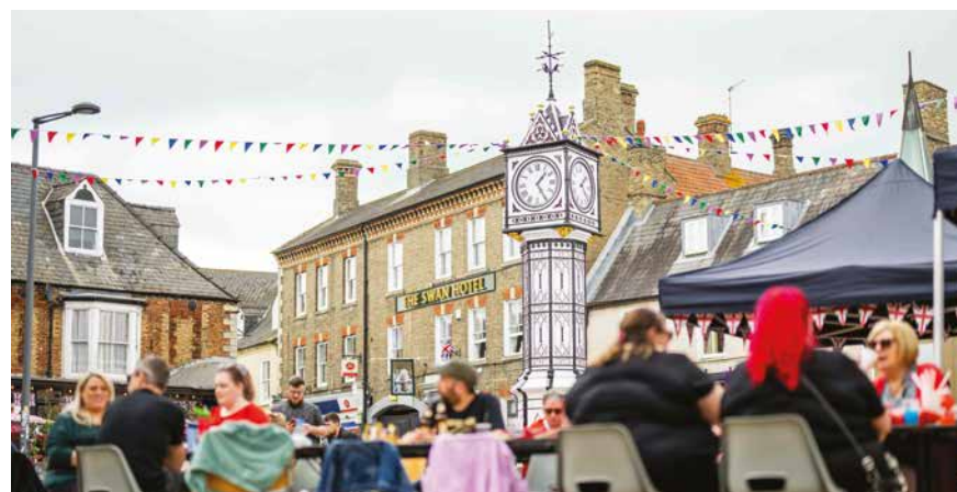
Community Event, Downham Market