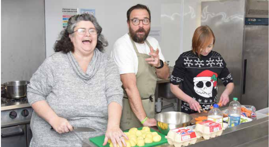
Food for Thought