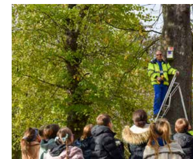
Installing Bird Boxes, The Walks