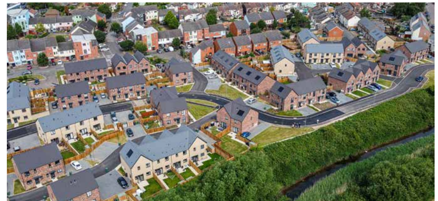
Nar Ouse Development, King's Lynn