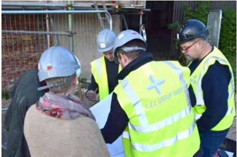
Sommerfeld & Thomas Building