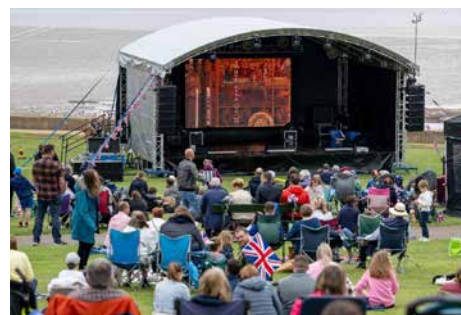
Community Event, Hunstanton