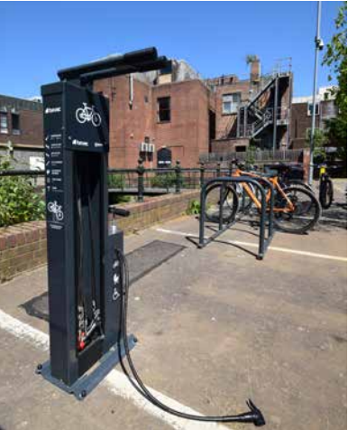
Baker Lane Active Travel Hub