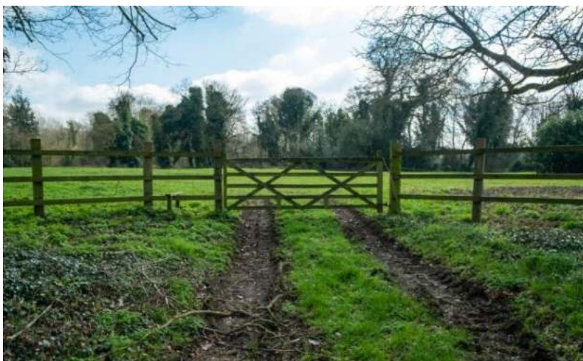
Figure 106: G-C Gap

Additional notes on photograph: To the far right of this view is the former village cricket pitch, which is now used for grazing.