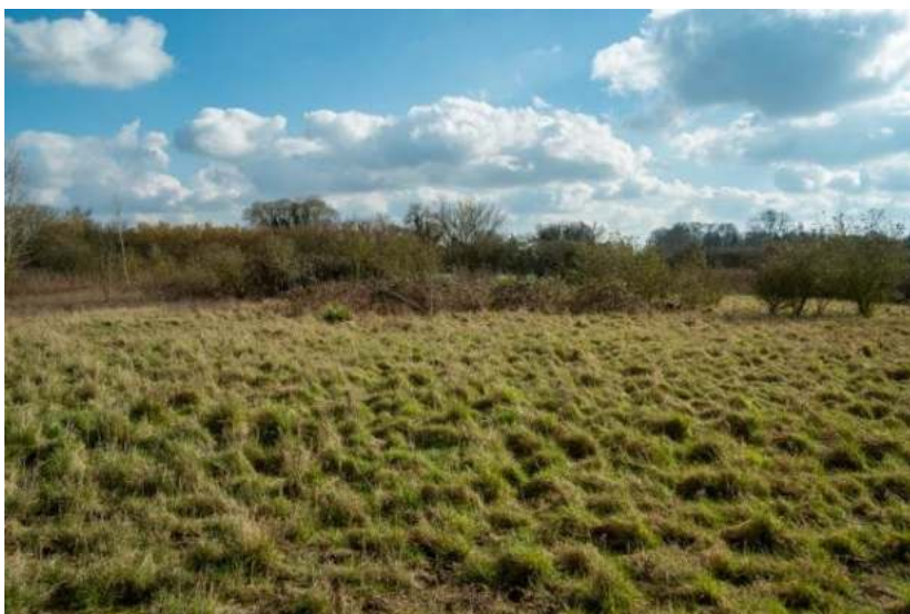
Figure 111: G-25 View

Location: Lynn Road, B1145 exiting Gayton village, facing southeast