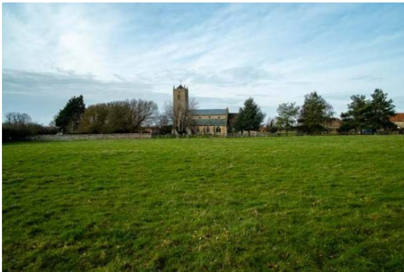
Figure 97: Highly Valued View G-N Gap and G-22 View

Location: Back Street, view towards Grade I listed St Nicholas' Church.