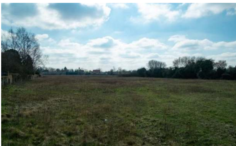
Figure 91: G-R Gap and G-14 View

Location: Restricted By-Way (RB8), Meadow along Vicarage Lane