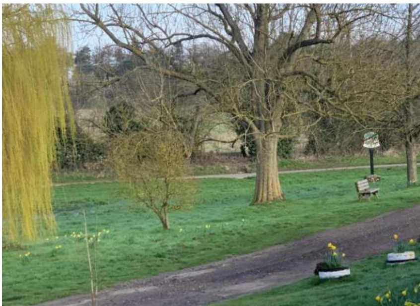
Figure 129: Highly Valued View GT-61 within Area 11-C through series of significant gaps (GT-U and GT-V) on northern side of Common Lane

Location: View from Grade I listed St Mary's Church entranceway, facing northwest.