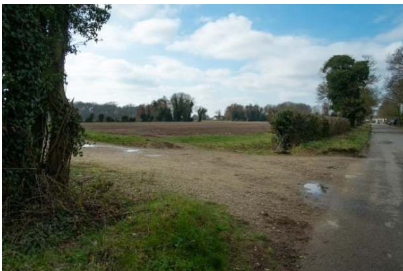
Figure 101: G-H Gap and G-5 View

Location: Back Street, View towards Winch Road