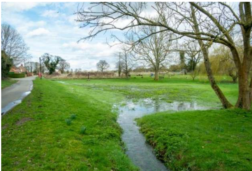
Figure 125: GT-56 View of village green within Area 11-B

Location: Western corner of village green facing east.