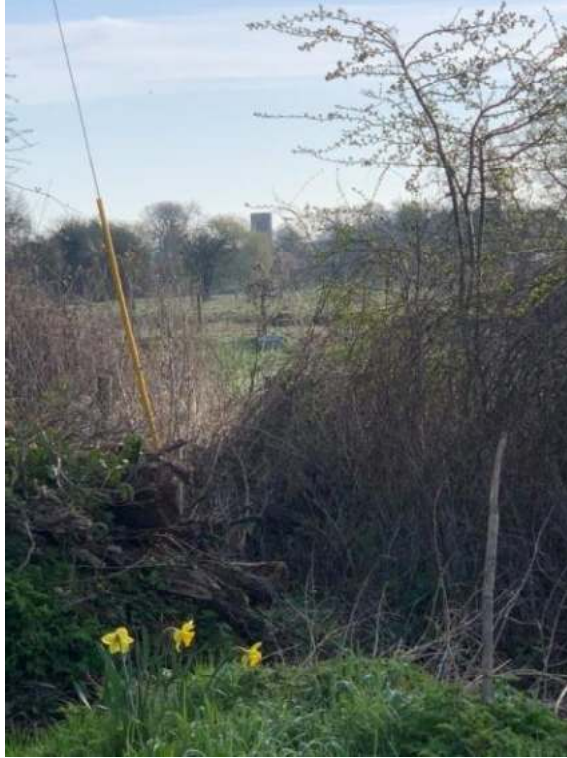
Figure 118: Highly Valued View GT-52 within Area 11-A. View from Common Lane south east facing

Location: Common Lane southern side, with open view facing east across grazing land