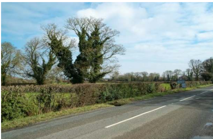
Figure 84: G-1 View

Location: B1145, western gateway into the village, facing east.