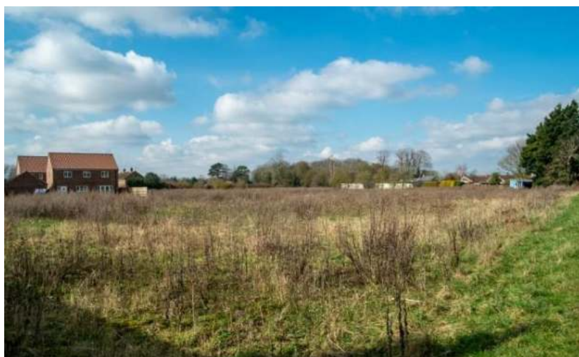
Figure 96: G-21 View

Location: Southern section of public footpath FP9 looking north-west across eastern part of the central green area.