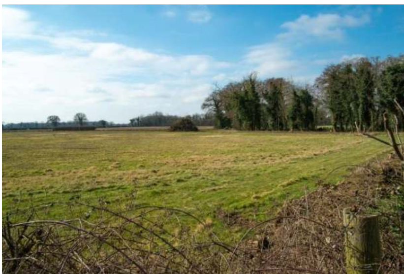
Figure 85: G-2 View

Location: B1145, western village gateway, looking south and west.