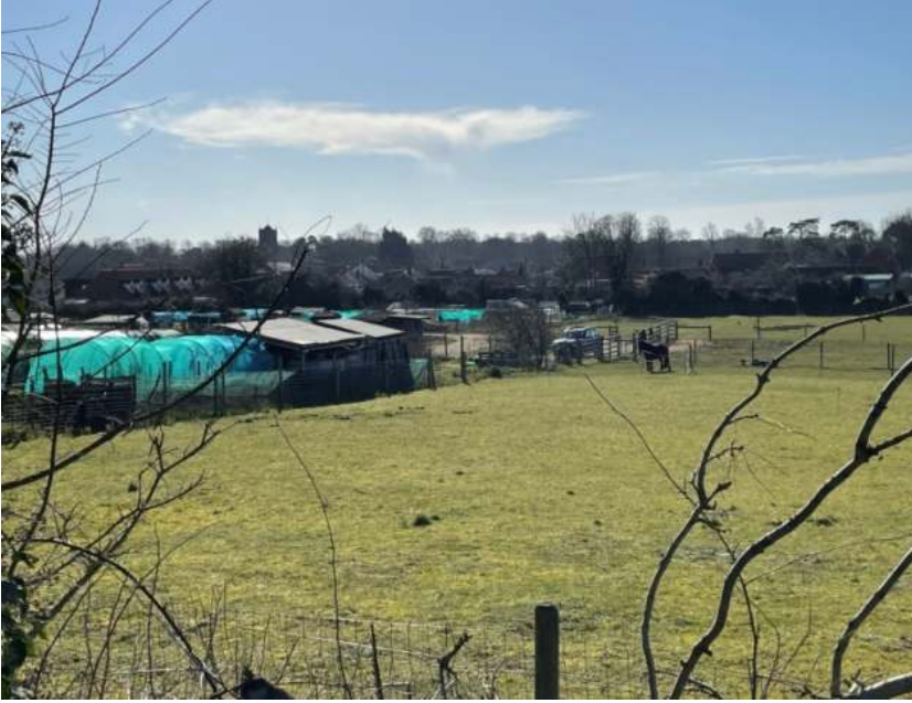
Figure 79: G-30 View