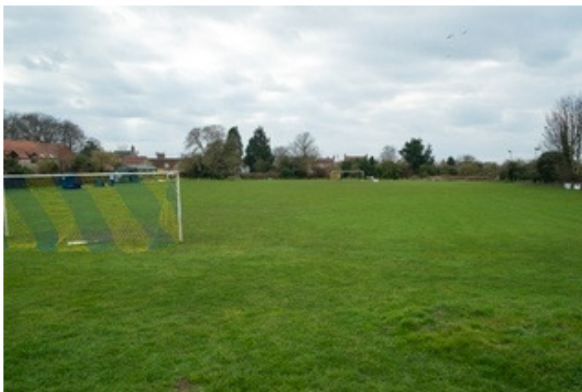
Figure 78: G-29 View

Location: Football Field, Lime Kiln Road