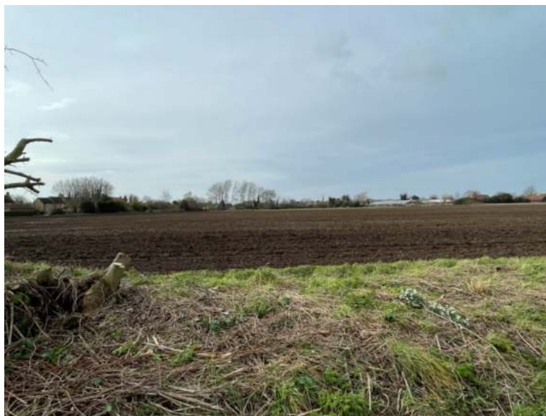
Figure 87: G-10 View

Location: Public Footpath FP9, St Nicholas Close