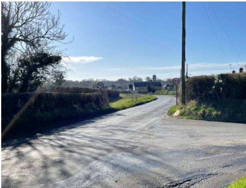
Figure 115: G-39 View

Location: Junction of Grimston Rd and Lime Kiln Road