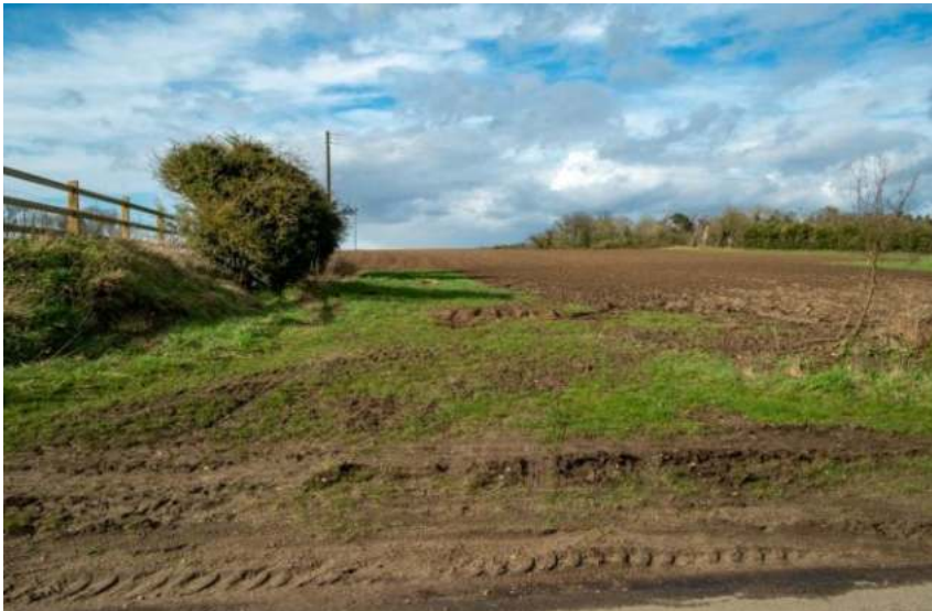
Figure 121: GT-R Gap within Area 11-A and directly off Common Lane

Location: Common Lane north-side, view facing north.