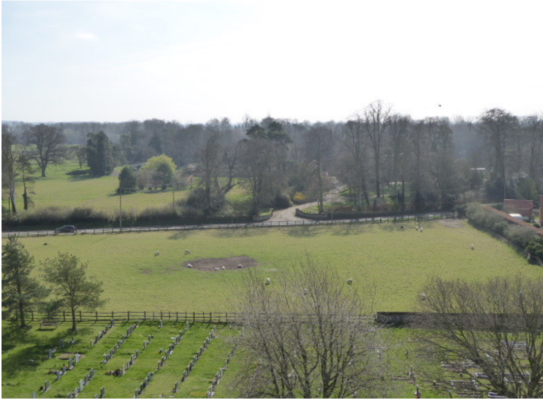
Figure 73: View looking south over Character Areas 6 and 3