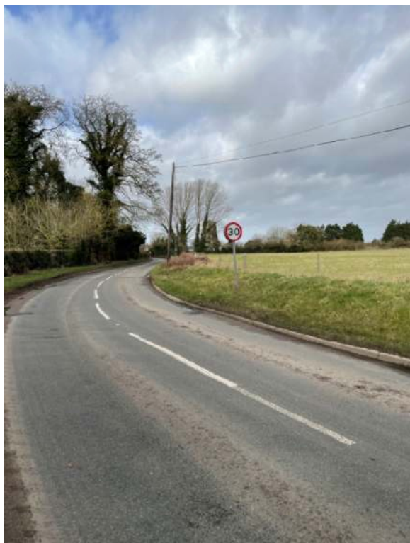
Figure 108: Highly Valued View G-S Gap photograph 2 facing north

Location: B1153 East Walton Road at the southern village gateway.