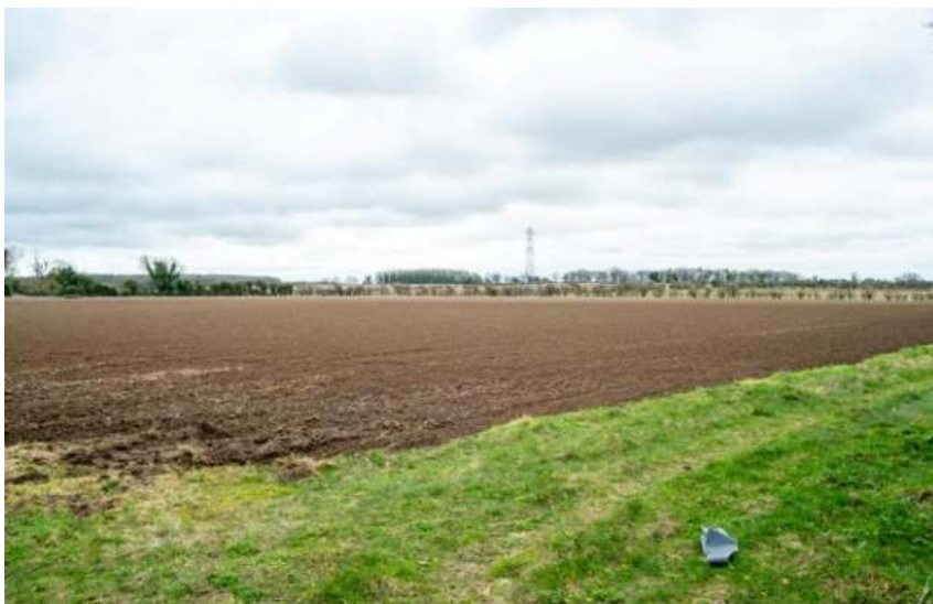
Figure 134: GT-45 View south of Area 11-C

Location: Track leading south to East Walton, eastern side, facing south east.