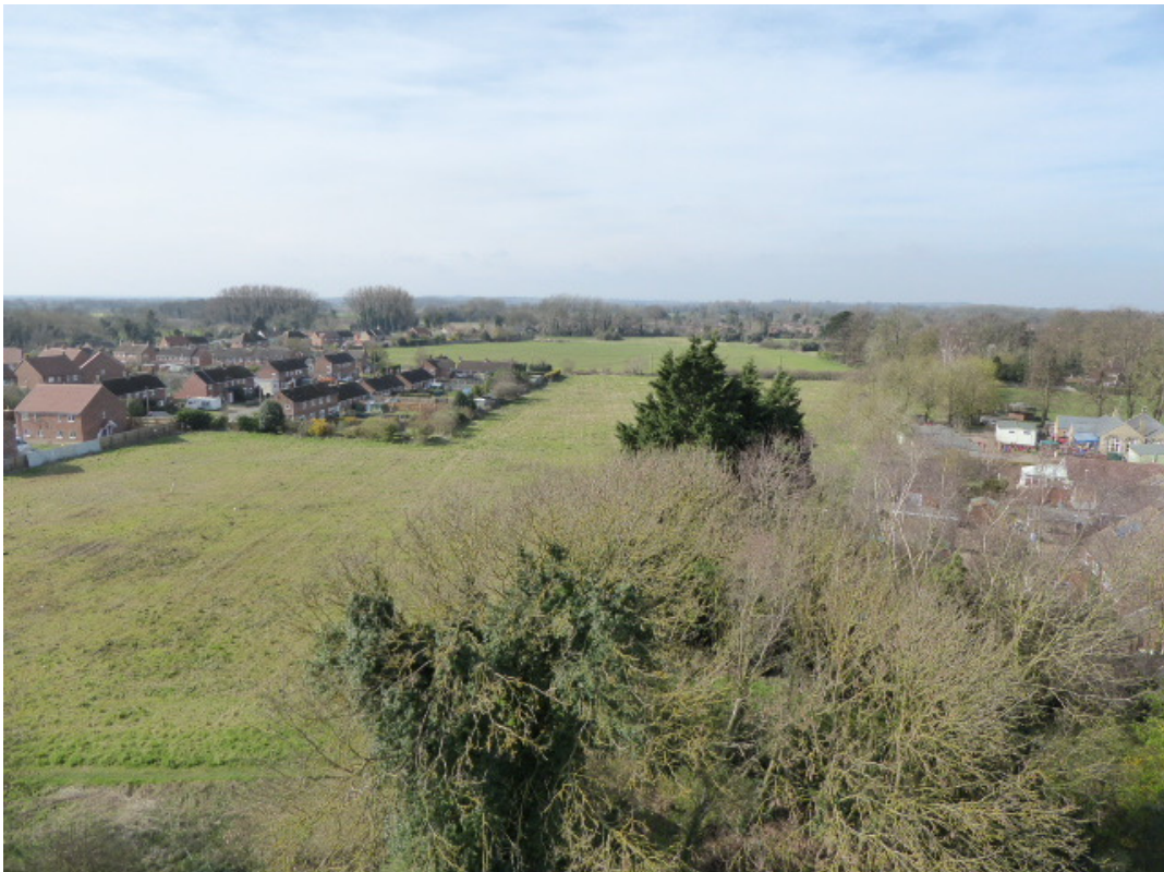
Figure 74: View looking west over Character Area 6