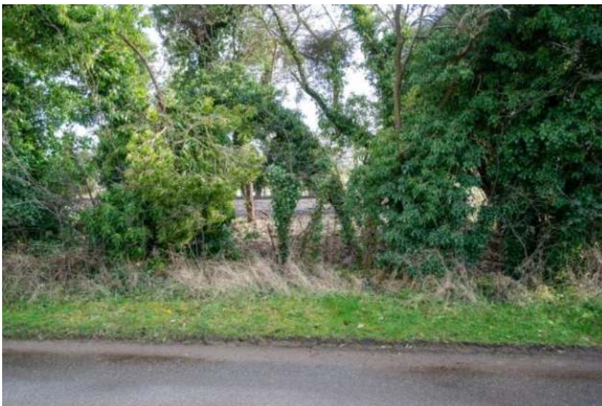
Figure 122: GT-J Gap within Area 11-A

Location: Common Lane southern side, view facing south.