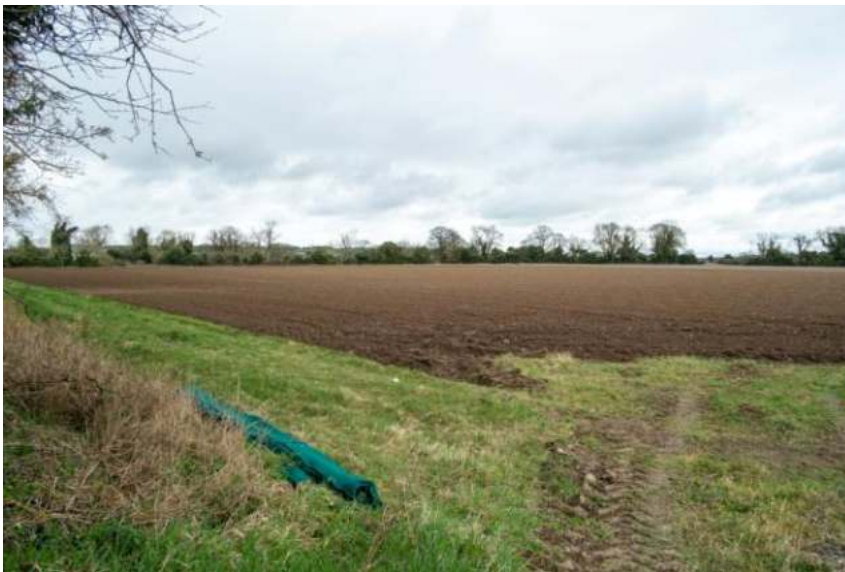
Figure 133: G-44 View south of Area 11-C.

Location: Track and right of way leading south to East Walton, eastern side facing north east.