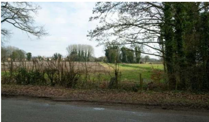
Figure 100: G-E Gap and G-4 View

Location: Right-hand view on entering the village from the southern gateway, Winch Road