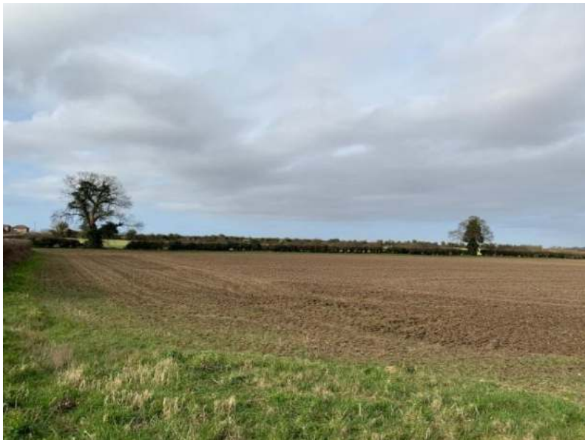
Figure 112: G-V Gap and G-27 View

Location: View facing north east from the eastern side of Grimston Road, just north of the Vicarage