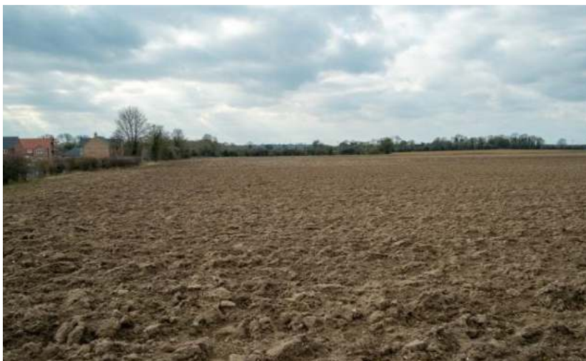
Figure 83: G-35 View

Additional notes on photograph: Photographed from same standing point as G-35 View