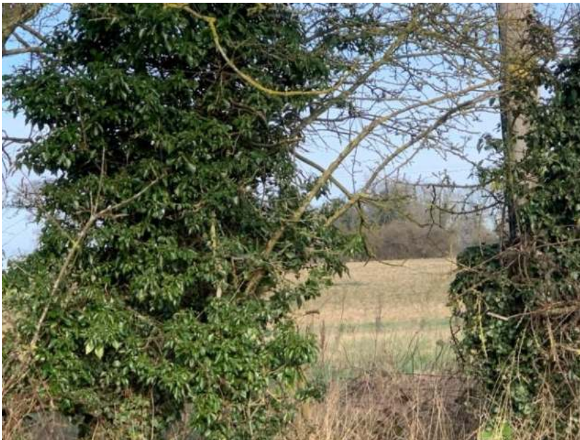
Figure 127: GT-V Gap within Area 11-B

Additional notes on photo: Area includes a culvert allowing water to pass under road into seasonal flood pond.