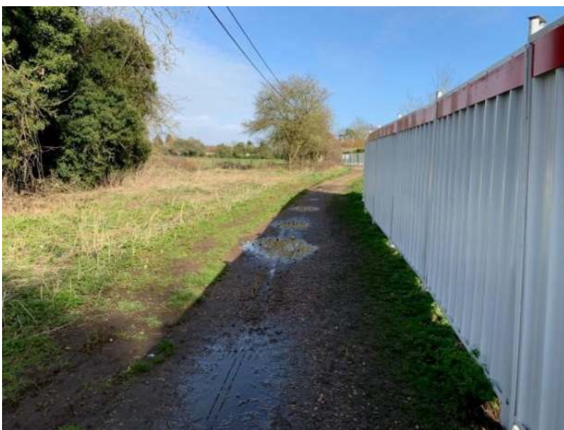
Figure 89: G-G Gap

Location: Restricted By-Way (RB8) at Springvale entry to and from Vicarage Lane