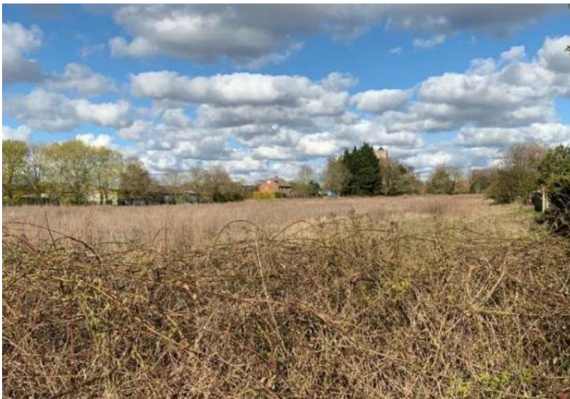
Figure 88: Highly Valued View G-11 View

Location: Public Footpath FP9, looking towards St. Nicholas's Church