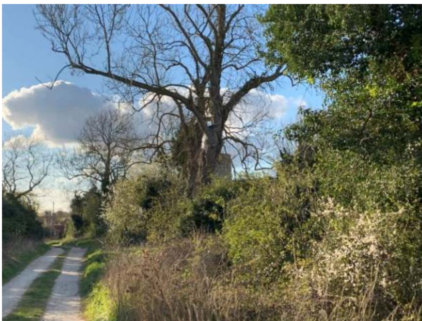
Figure 135: GT-62 view towards Area 11-C

Location: View from the public footpath alongside of and south of Grade I listed St Mary's Church, facing north west.