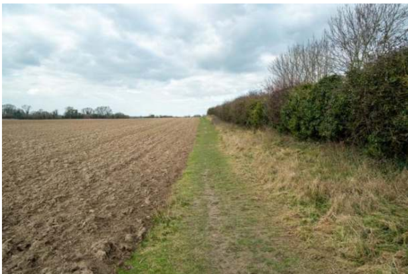
Figure 82: G-34 View

Location: Well Hall Footpath FP2 and FP4 looking north.