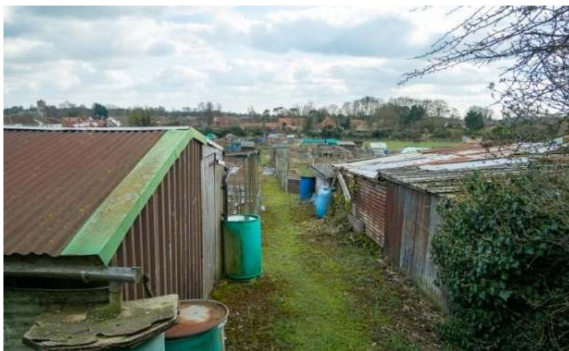
Figure 81: G-U Gap and G-32 View

Location: Allotments, Lime Kiln Road looking south