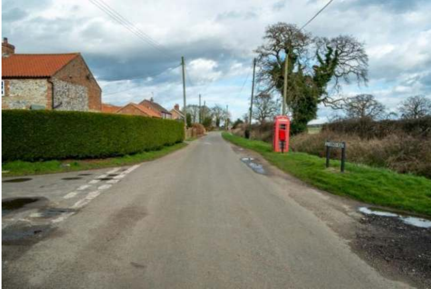
Figure 131: GT-57 View along Old Norwich Road within Area 11-C

Location: Junction of Brick Yard Lane, Old Norwich Road, Common Lane and the path leading to the Grade I listed St Mary's Church, facing east.