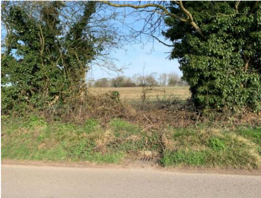
Figure 126: GT-U Gap and GT-60 View

Location: Common Lane northern side, facing north.