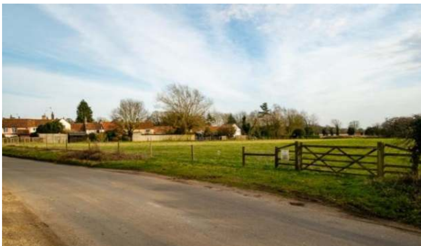
Figure 102: G-J Gap

Location: Back Street, looking south east, opposite Manor Farm.