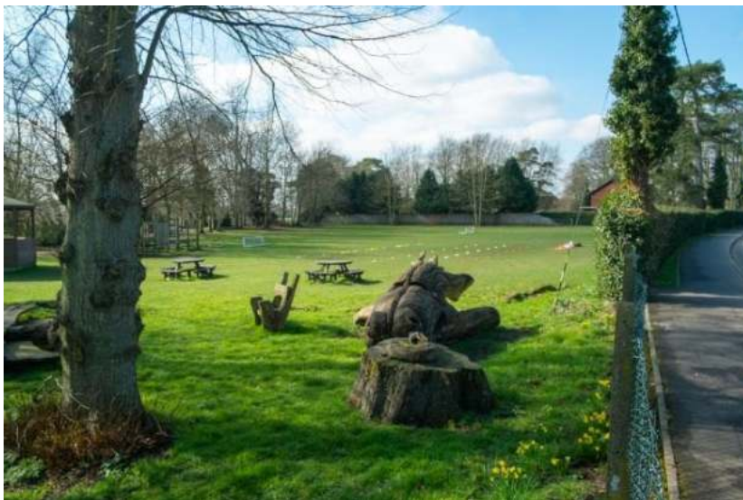
Figure 94: G-18 View

Location: B1145 adjacent to Gayton Primary School, Lynn Road