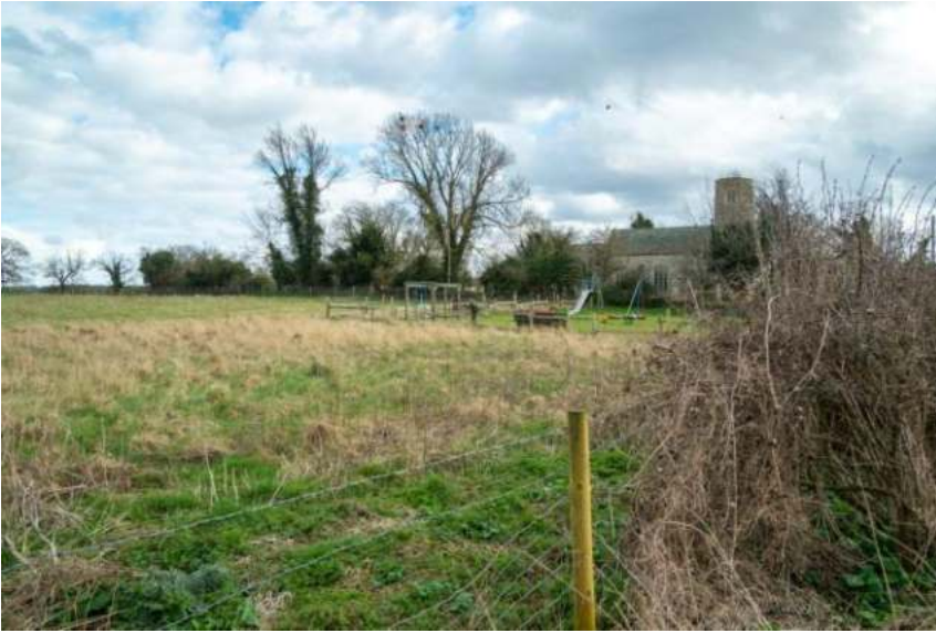
Figure 136: Highly Valued View GT-48 of church on approaching the village green. East of Area 11-C

Location: View just east from the junction of Common Lane and the north east corner of the green, facing south