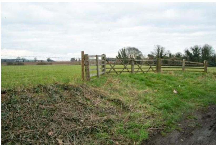
Figure 107: G-S Gap photograph 1 facing south east