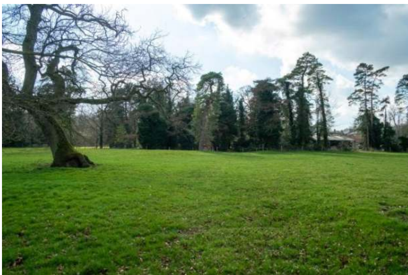
Figure 105: G-38 View

Location: B1153 East Walton Road facing west on boundary of Gayton Estate.