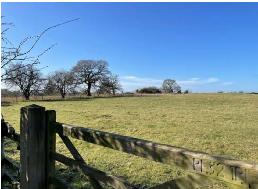
Figure 145: GT-D Gap approaching northern village gateway.

Location: Brick Yard Lane western side, approaching northern gateway to the hamlet.