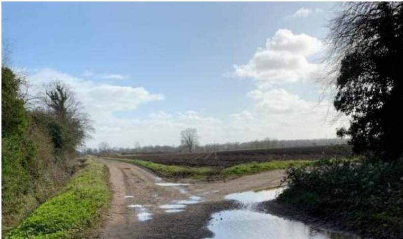
Figure 99: G-D Gap

Location: Public footpath FP10 south of Back Street