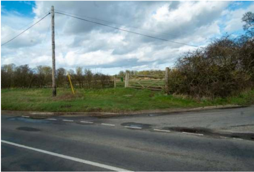
Figure 116: GT-A Gap looking northeast within area 11-A

Location: Junction of B1153 (Gayton to East Walton) and Common Lane which forms the main lane of Gayton Thorpe.