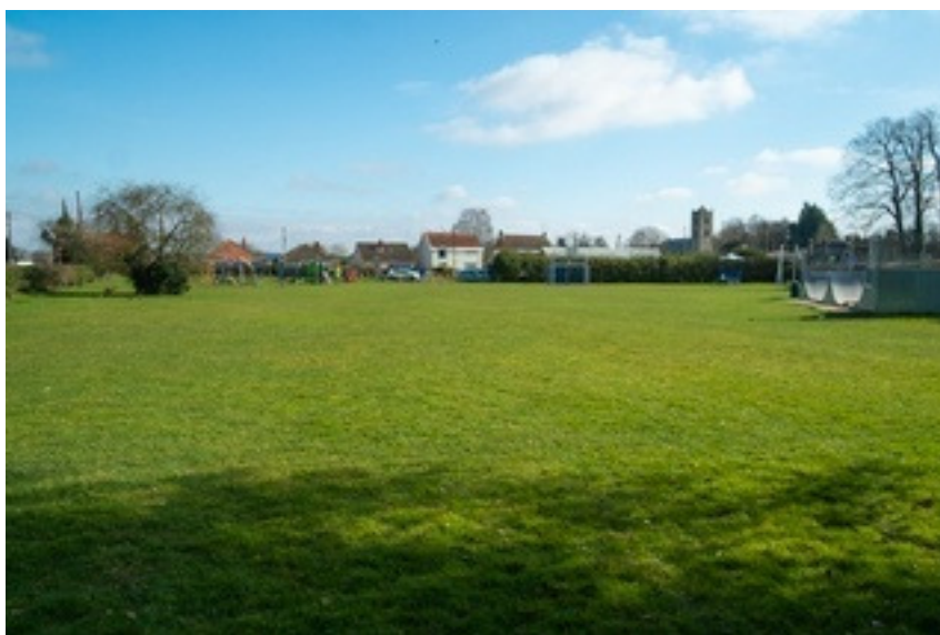
Figure 77: G-W Gap and G-17 View

Location: Gayton village recreation green