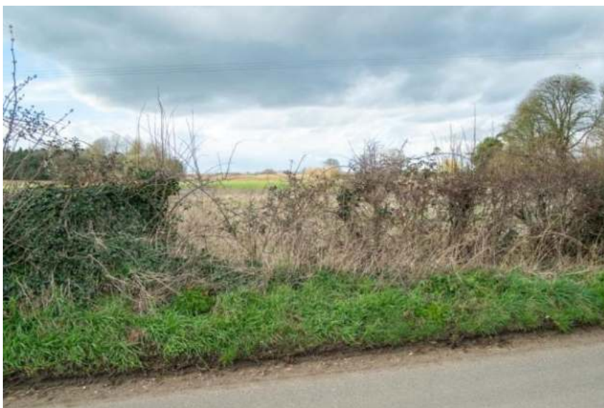
Figure 138: GT-P Gap within Area 11-D running parallel to GT-N Gap but faces north easterly direction

Location: Gap along northern side of Old Norwich Road