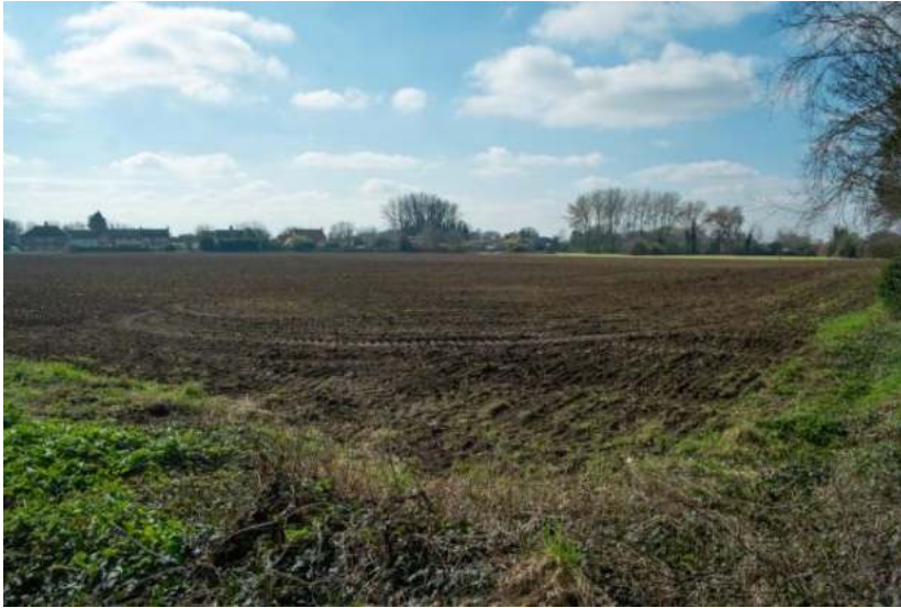
Figure 92: G-15 View

Location: Public Footpath (FP9) looking south west.