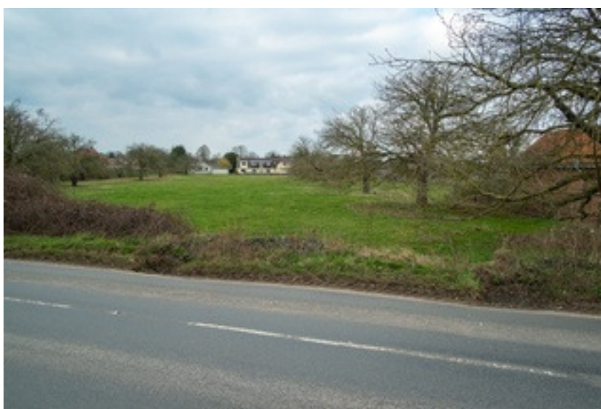
Figure 75: Highly Valued View G-P Gap and G-23 View