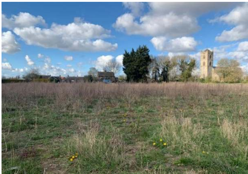
Figure 95: Highly Valued View G-M Gap and G-19 View

Location: Unmade road access off Hall Farm and Church View