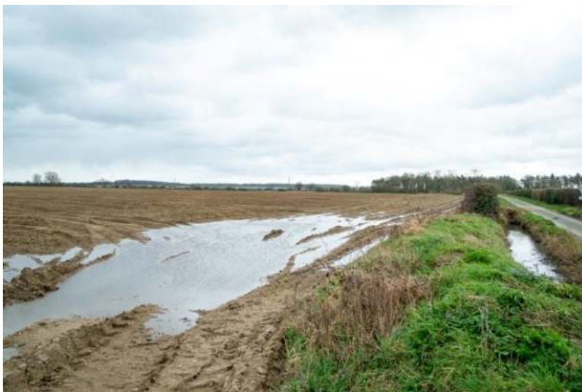
Figure 149: GT-59 View.

Location: Junction of B1145 and Brick Yard Lane, facing south west.