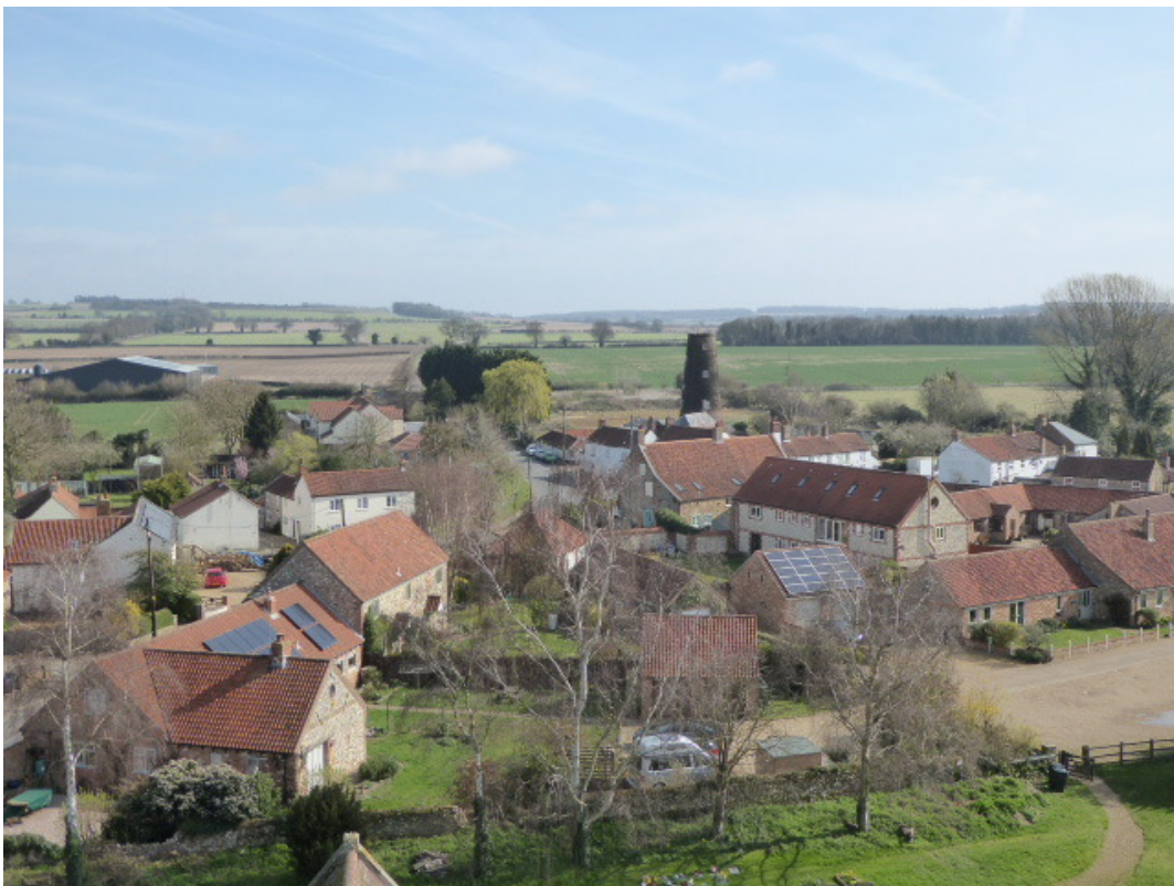
Figure 72: View looking east over Character Areas 6/9 and 10