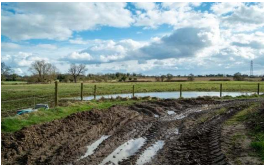
Figure 120: GT-H Gap and GT-40 View within Area 11-A, directly off Common Lane

Additional notes on photograph: During the dry seasons this watercourse is not apparent.