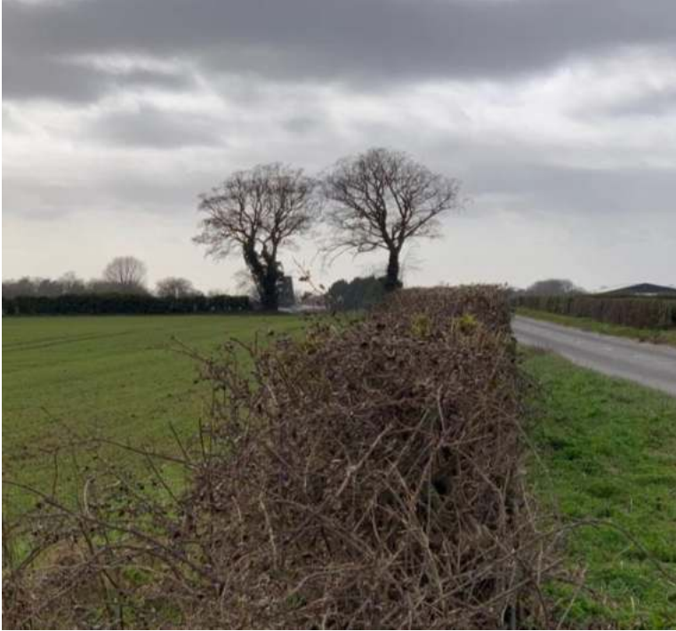
Figure 109: Highly Valued View G-24 View

Additional notes on photograph 1: Photographed from the left side of the B1153 going toward East Walton. This long gap is seen after the exit from Gayton.