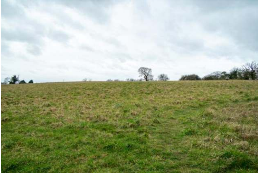
Figure 144: GT-50 View

Location: Brick Yard Lane western side direction north west, taken from gap GT-G.