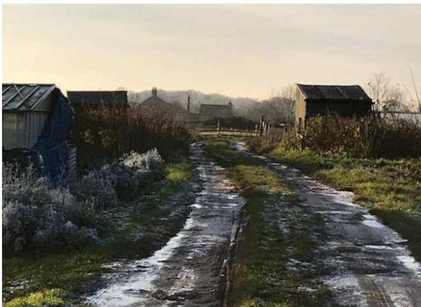
Figure 80: G-31 View

Location: Allotments, Lime Kiln Road looking west