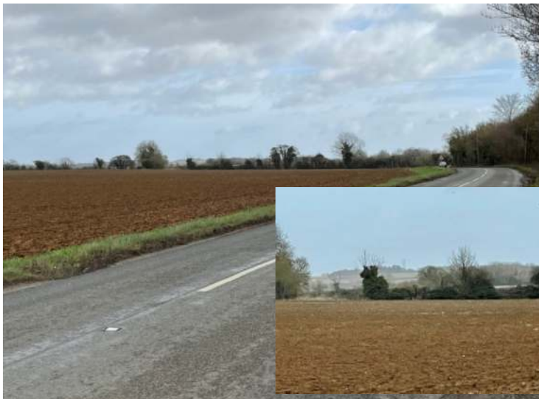
Figure 113: G-28 View and inset closeup of Gayton Clump

Location: View facing east taken from western edge of Parish, on the B1145 and before the chicane leading into the 30mph speed limit in Gayton.