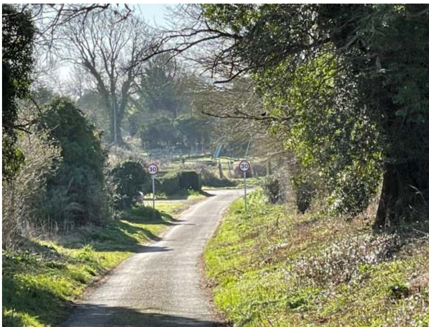
Figure 148: Highly Valued View GT-59 View of church and playground from northern village gateway.