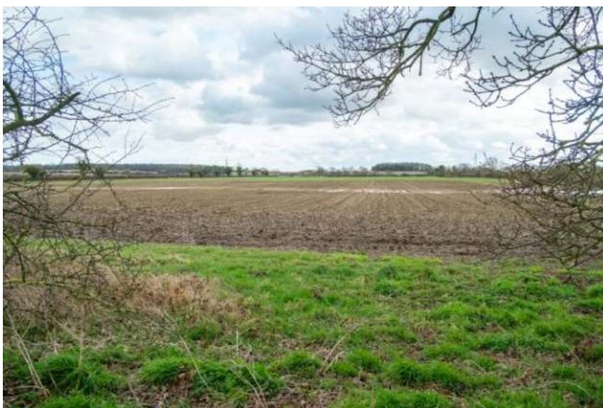
Figure 140: GT-53 view south of Area 11-E

Location: Southern side of Old Norwich Road opposite Great Barn Farm.