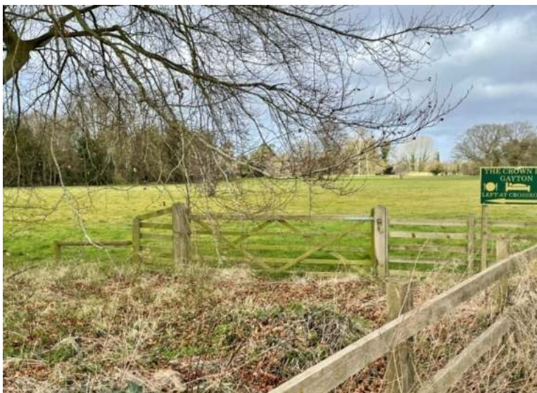
Figure 104: Highly Valued View G-A Gap

Location: Approaching the south eastern gateway to Gayton village on the B1153 East Walton Road, forming boundary with Gayton Estate.