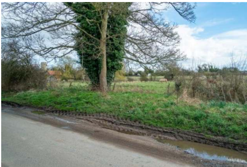
Figure 123: GT-L Gap and Views GT-41, GT-42 and GT-43, all within Area 11-B

Location: Common Lane southern side, with three particular open views facing east and south east across grazing land.