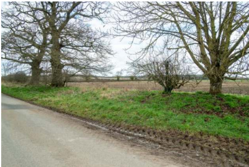
Figure 139: GT-F Gap south of Area 11-E

Location: Gap along southern side of Old Norwich Road opposite Great Barn Farm.