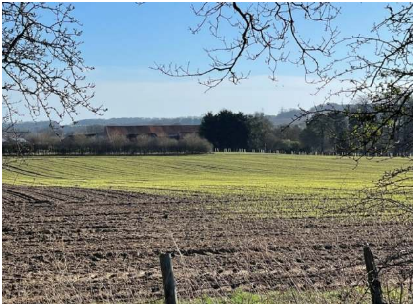
Figure 147: Highly Valued View GT-C Gap approaching northern village gateway glimpsing the Great Barn.

Location: Brick Yard Lane eastern side, opposite gap GT-D.