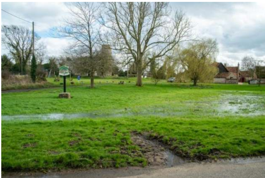
Figure 128: Highly Valued View GT-47 within Area 11C

Location: Eastern corner of village green, facing south.