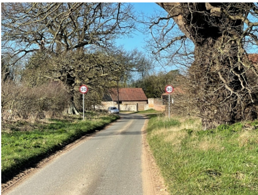
Figure 150: Highly Valued View GT-58 from eastern village gateway.