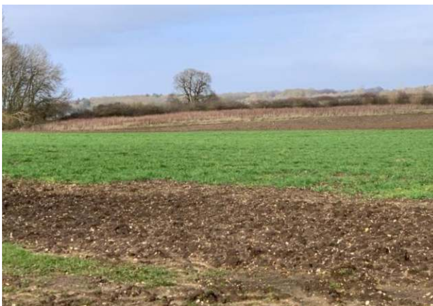
Figure 146: GT-51 View leaving northern village gateway

Location: Brick Yard Lane eastern side, facing north east.