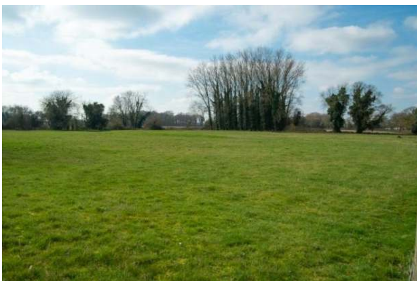
Figure 103: G-B Gap and G-6 View

Location: Back Street, looking southwest, opposite Manor Farm