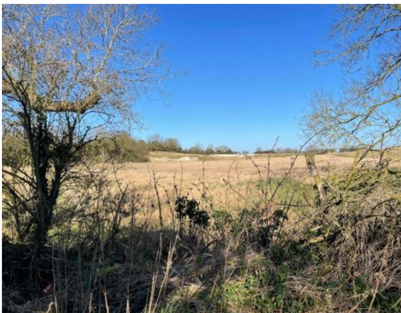
Figure 76: G-33 View

Additional notes on photograph: View photographed from southern side of B1145 looking towards Crown Paddock