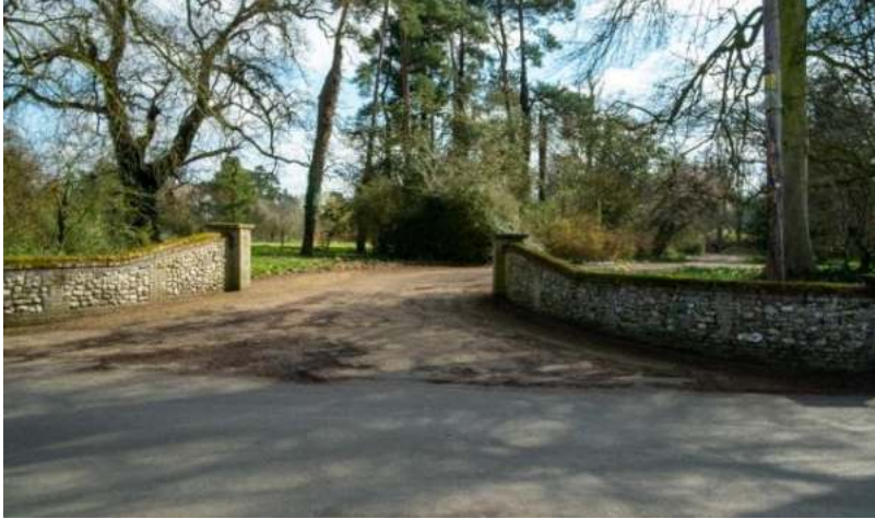
Figure 98: G-X Gap

Location: Entrance to Gayton Hall, Back Street