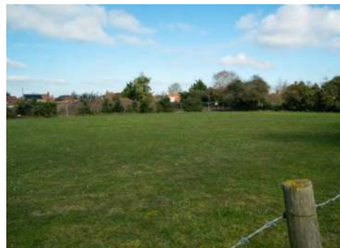
Figure 90: G-Q Gap, G-12 View and G-13 View

Location: Restricted By-Way (RB8), western end of Vicarage Lane