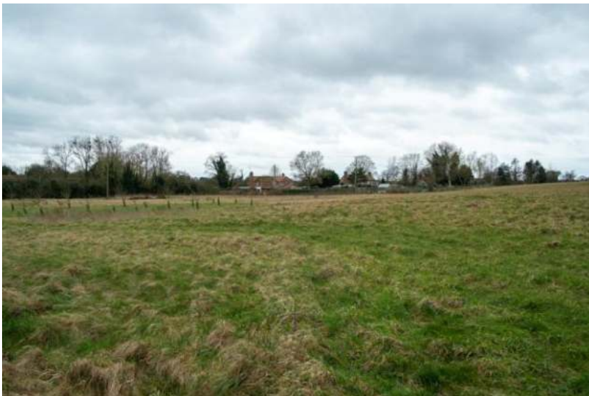
Figure 143: GT-49 View of rear of the main row of houses in the village within Area 11-B

Location: Brick Yard Lane western side facing south west, taken from gap GT-G.