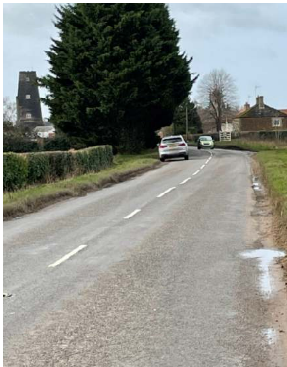
Figure 110: Highly Valued View G-26 View

Location: B1145, Lynn Road from side of road before the eastern gateway into Gayton, just outside the 30mph zone looking west.