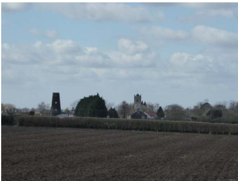
Figure 114: Highly Valued View G-37 View

Location: Wells Wondy Lane off the B1145 and looking south west to Gayton