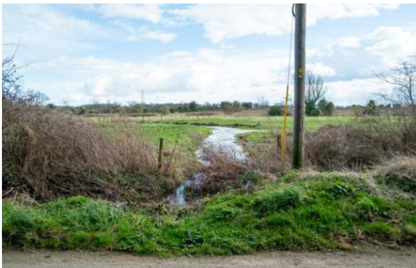
Figure 119: GT-B Gap and View off Common Lane, looking south over fields and watercourse within Area 11-A

Location: Common Lane southern side, view facing south.