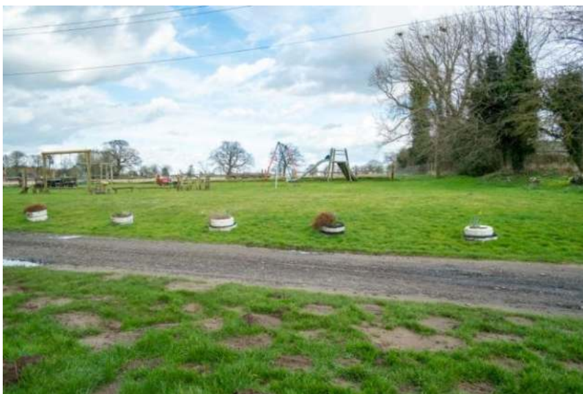
Figure 130: GT-46 View of village playing field within Area 11-C

Location: Southern corner of village green, facing east.