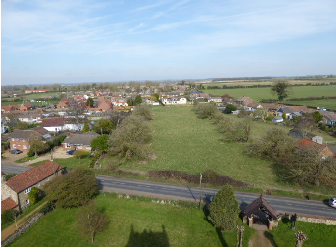
Figure 71: View looking north over Character Area 1