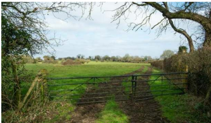
Figure 86: G-T Gap and G-3 View from the left side B1145

Location: B1145, north-western end after the village gateway.