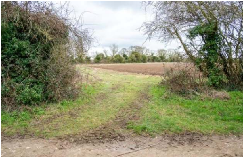
Figure 132: GT-S Gap south of Area 11-C

Location: Track and right of way leading south alongside Gate House Farm.