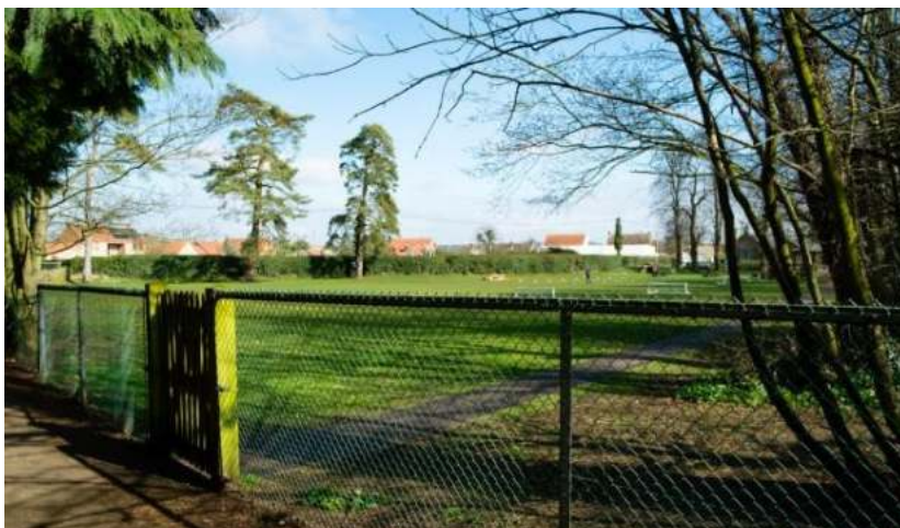
Figure 93: G-K Gap

Location: Pedestrian entrance at St Nicholas' Path (public footpath FP9) to Gayton Primary School (Lynn Road)