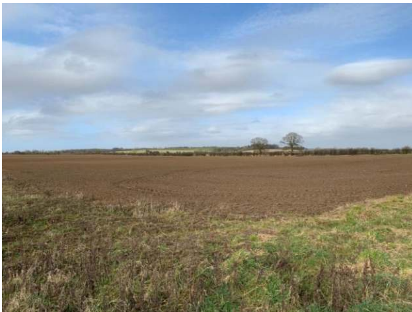
Figure 141: GT-54 view east of Area 11-E

Location: Old Norwich Road on outskirts of hamlet, facing north east.