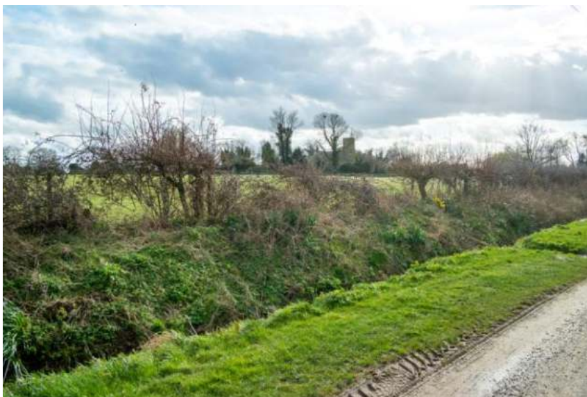
Figure 137: Highly Valued View GT-N Gap runs parallel to and south of the Old Norwich Road, Area 11-D

Location: Gap along southern side of Old Norwich Road.