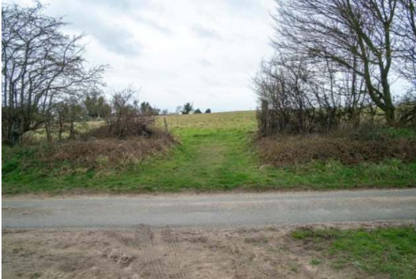
Figure 142: GT-G Gap within Area 11-B (Brick Yard Lane)