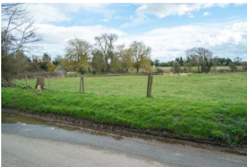
Figure 124: GT-M Gap and GT-55 View, within Area 11-B

Location: Common Lane southern side, with open view facing south east across grazing land