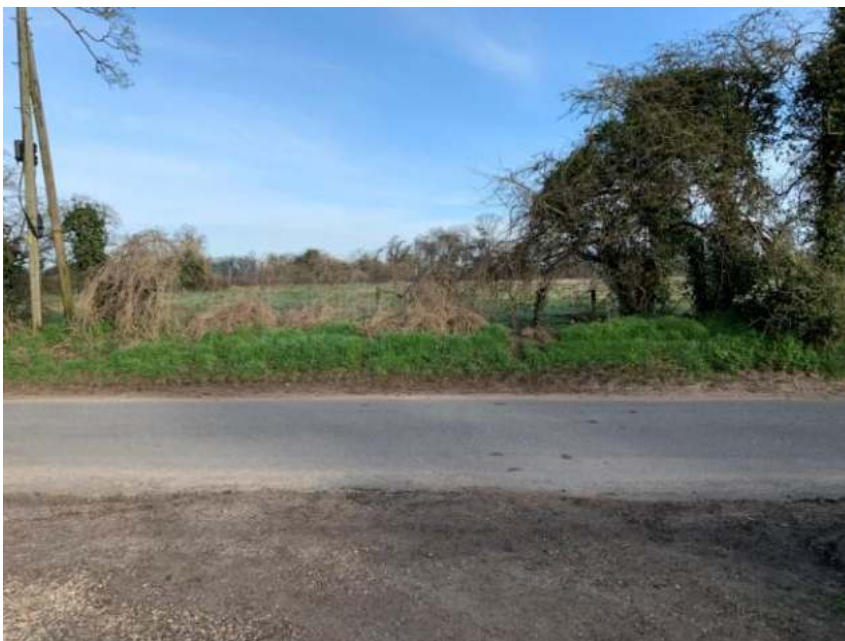
Figure 117: GT-T Gap on Common Lane northern side within area 11-A

Location: Common Lane north-side, with open view across grazing land