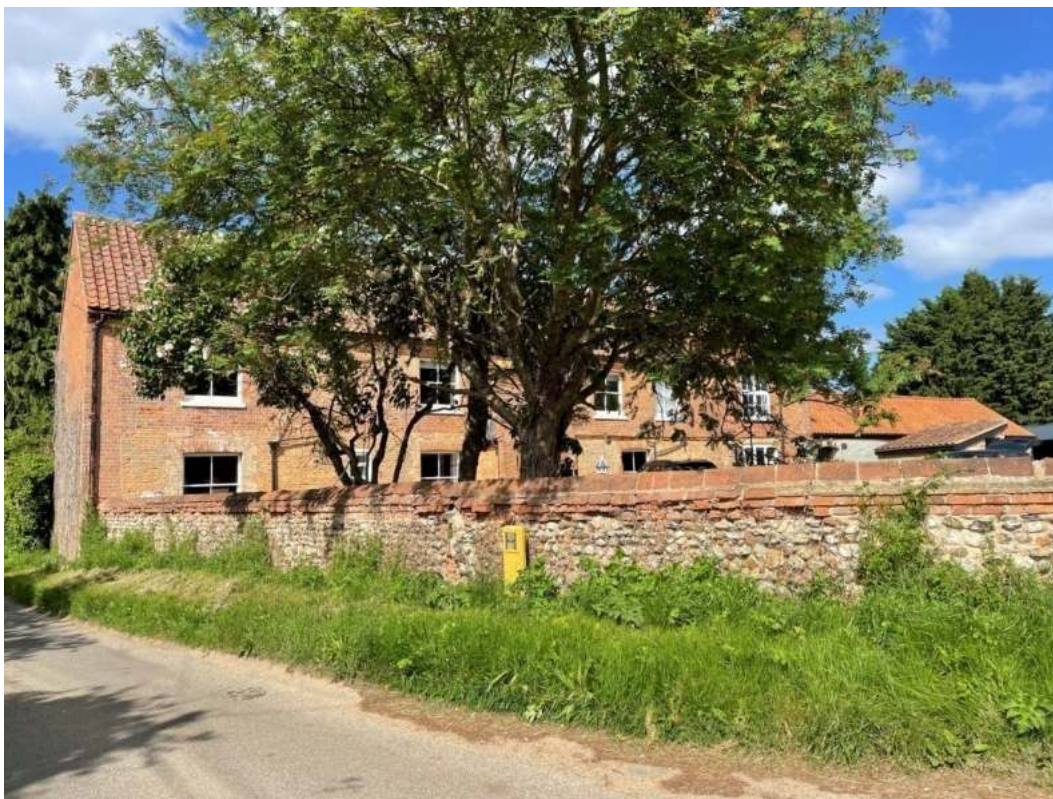
Figure 67: Manor Farm, Common Lane, circa late 1700's

Description: Large double fronted property built of red brick with pantile roof and attached barn also of brick with chalk and pantile roof. Sited at the western end of Common Lane behind a brick, flint and chalk boundary wall with wide and open access frontage to the main house.