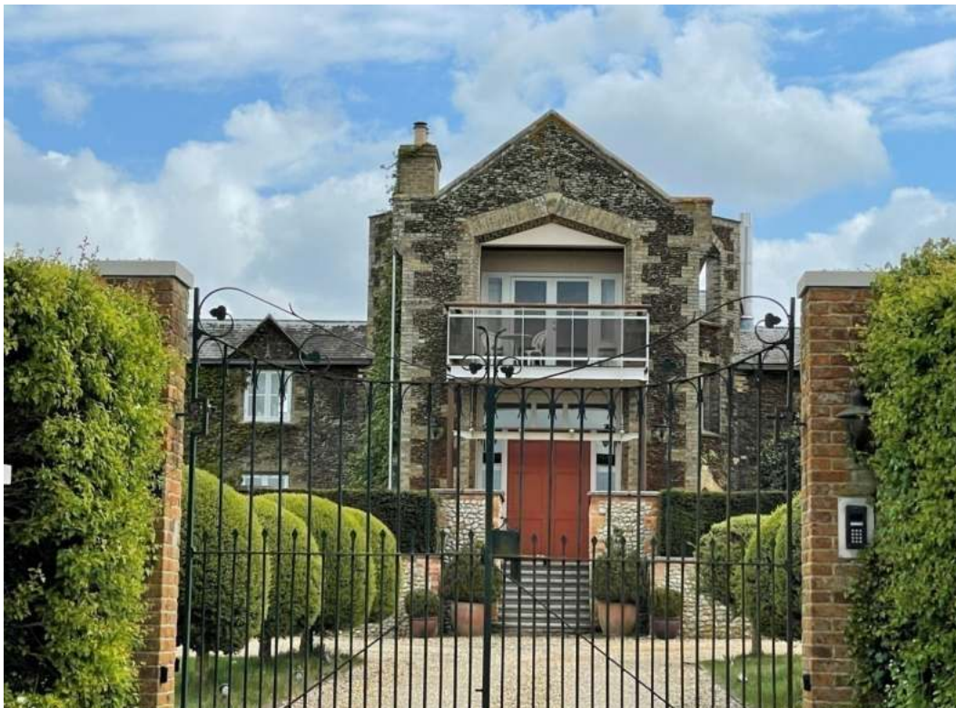
Figure 65: Eastgate House, Front façade.

Description: Substantial structure built of brick, carrstone and stone with slate tile roof, sited on an elevated position some miles from all community. Former Freebridge Lynn Union Workhouse. It later became an Old Peoples' Home 1948 – 1963. (Ref www.heritage.norfolk.gov.uk ). The property is now privately owned and has been sympathetically remodelled and split into several homes.