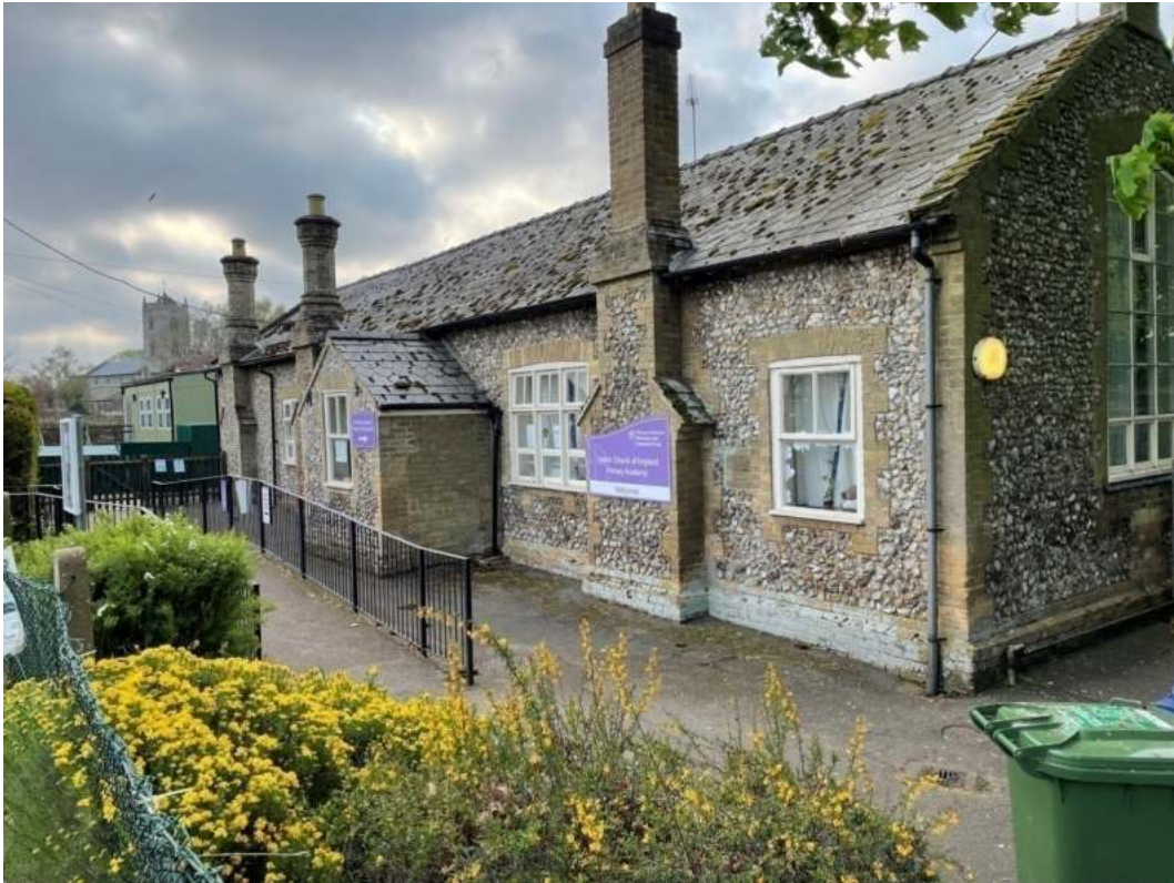
Figure 57: Gayton Church of England Primary Academy, Lynn Road, circa 1800's

Description: Brick and flint built main body of school with slate roof tiles. Distinctive single storey height building, with front porch and three tall chimney stacks. To the side and rear of main school are several nondescript portacabin buildings providing for overspill.