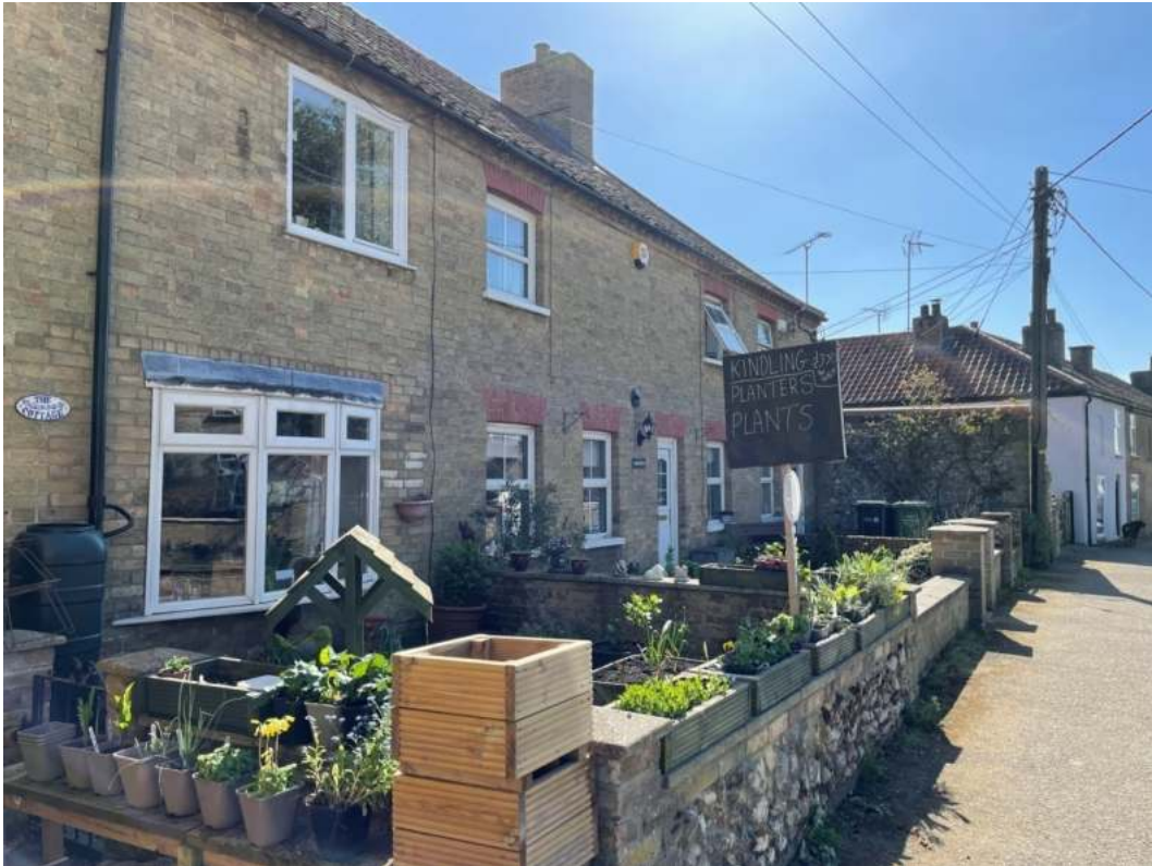
Figure 47: Row of Classic Terraced Cottages, Lynn Road, circa late 1800's. Situated opposite the Old Doctors house dated 1880.

Description: 'The Cottage'/'Mabeldene' etc Yellow brick built construction with red brick decoration and pantile roofs.