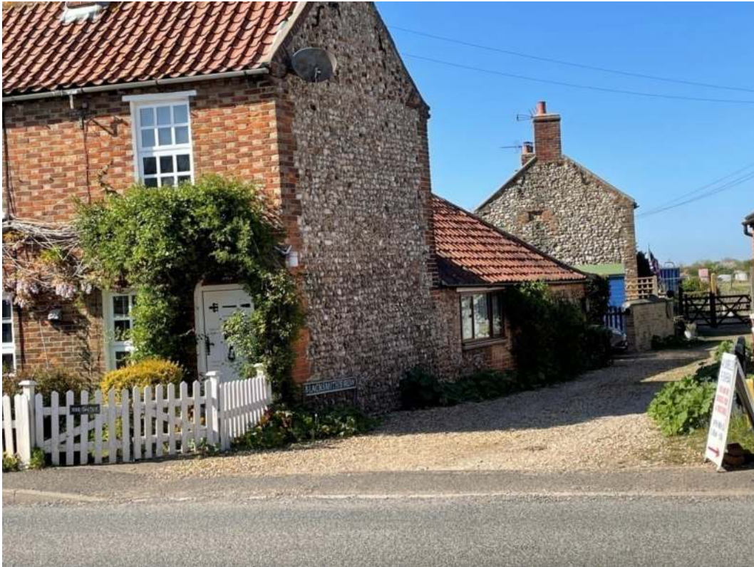
Figure 46: Row of Classic Terraced Cottages at Blacksmiths Row and at rear of The Old Smithy, circa mid 1800's

Description: Red brick and Flint construction with pantile roofs.