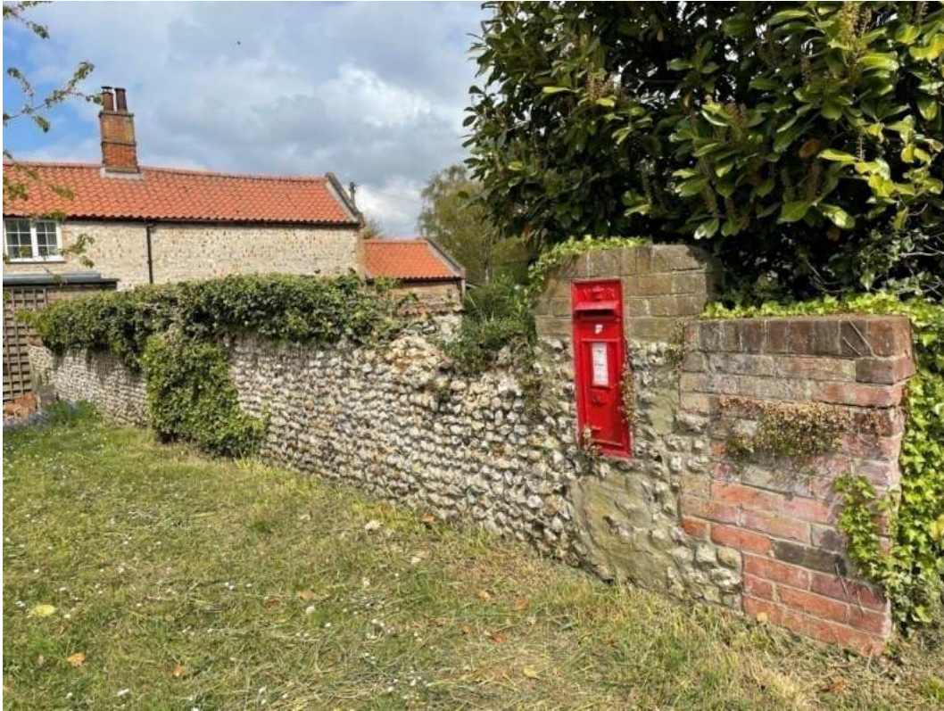
Figure 61: Antique Royal Mail Post Box inset into wall, junction of Lynn Road/B1145 and Grimston Road/B1153. Circa 1850's

Description: In service Royal Mail post box, with letters VR (Victoria Regina), signifying Queen Victoria was Monarch when it was installed.