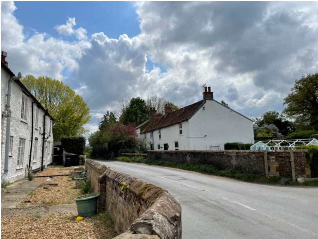
Figure 60: Cluster of Estate Cottages, East Walton Road and Back Street circa mid 1800's (B1153)

Description: White rendered brick and chalk dwellings with pantile roofs. Later addition of brick extension to rear of properties.