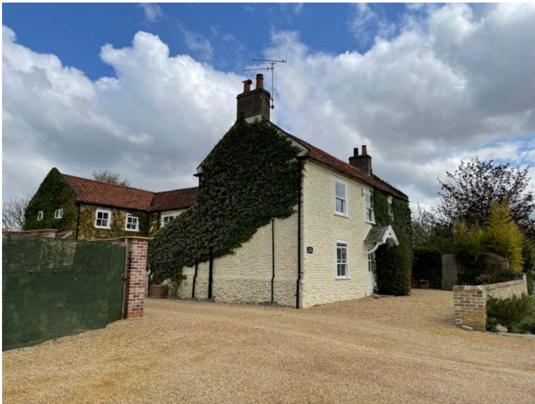
Figure 54: Manor Farmhouse, Back Street late 1700's – 1800

Description: The frontage is mostly chalk lump (clunch in the vernacular) with the single storey northern end being flint outside and chalk inside. The smaller barn to the west is carrstone and brick and is thought to be the oldest building on the site. The whole house and barn were fully renovated in 2000 with UPVC sash windows replaced with timber, original buff pantiles sourced and used and chalk walls in what is now the drawing room, renovated solely with existing materials from the site. A further significant extension was added in 2005.