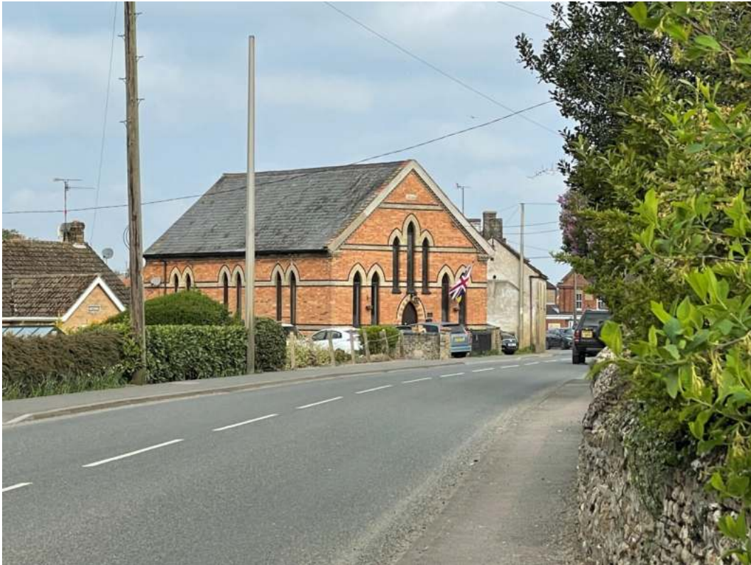
Figure 56: The Old Chapel, Lynn Road circa 1870

Description: Former Primitive Methodist Chapel built from red brick with distinctive yellow brick decoration around the arched windows and slate roof. It was extended in 1883. The Chapel was sold in 2015 and converted to a private dwelling.