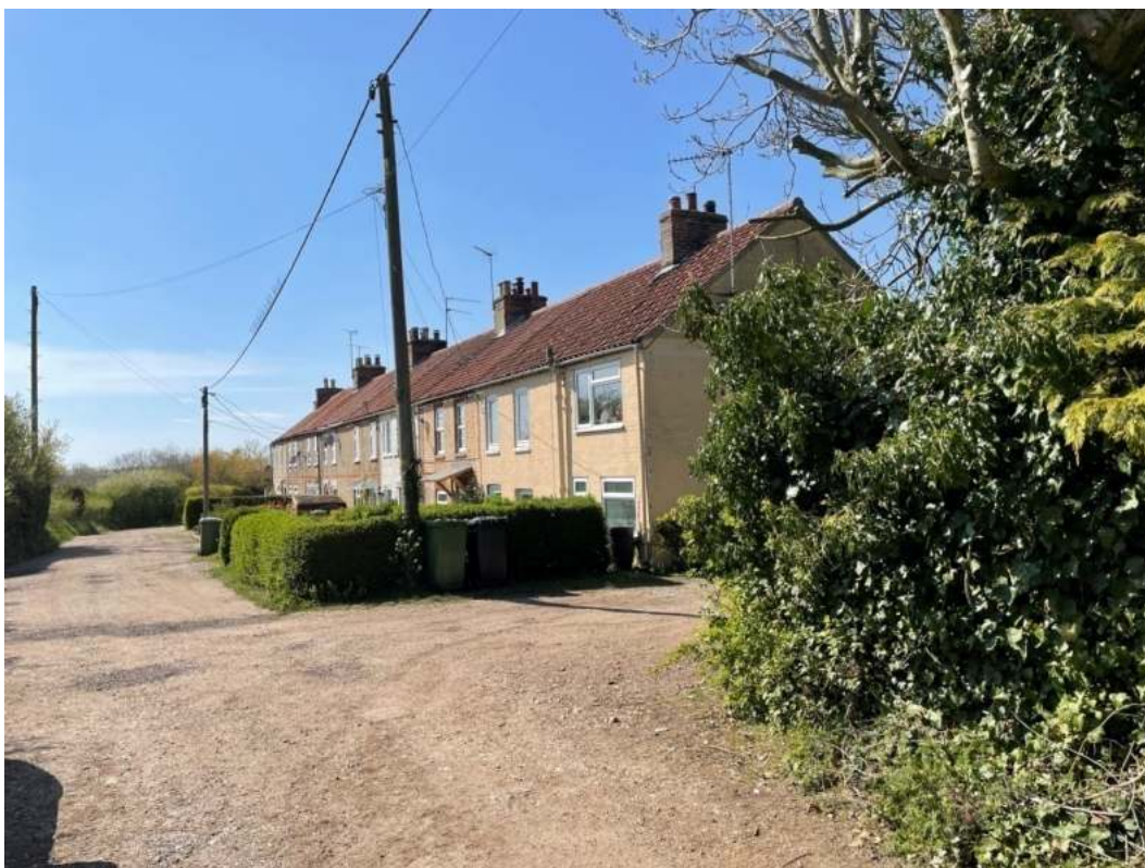
Figure 43: Ebenezer Cottages. Lime Kiln Rd, circa 1840-1914

Description: Row of workers cottages built of brick and flint with Norfolk pantile roofs.