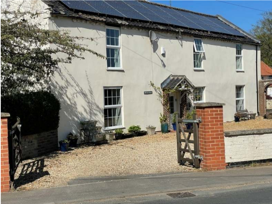
Figure 41: Mill End House, Lynn Rd -B1145/Grimston Rd -B1153

Description: White Norfolk brick, flint and chalk property with pantile roof, circa 1840-1914