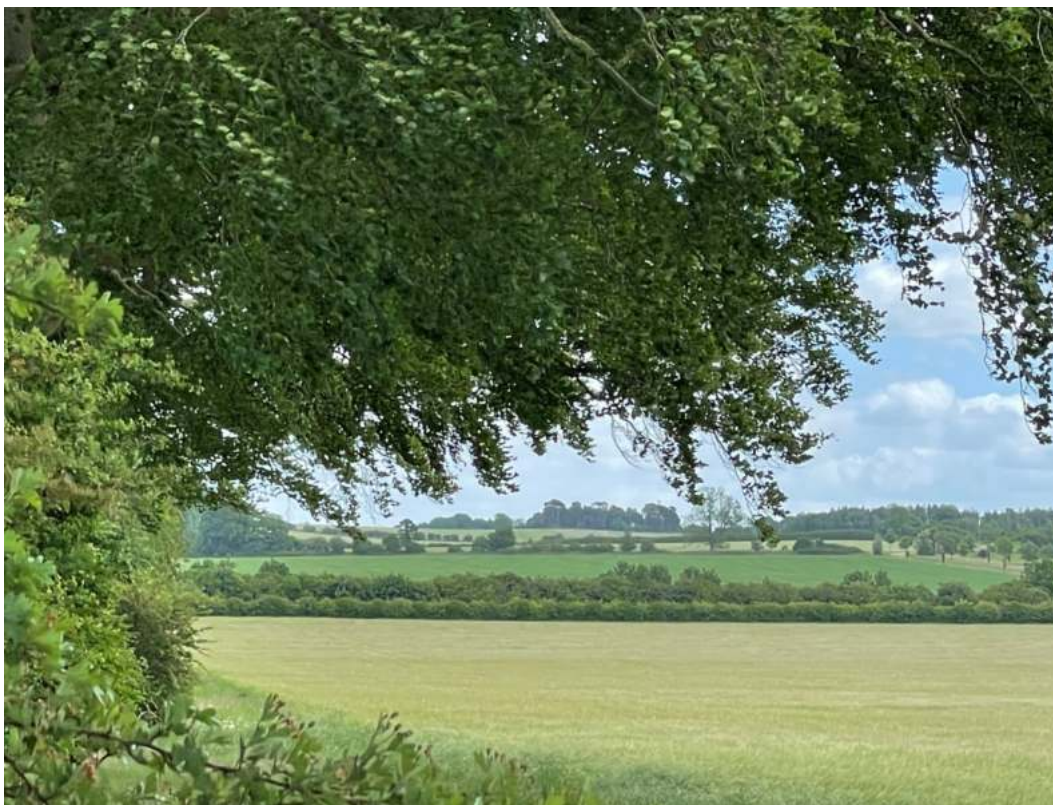
Figure 63: Gayton Clump, off Litcham Road (B1145)

Description: Rising open farm land and chalk-belt leads to the eastern side of Gayton where a copse of Scots Firs, known locally as Gayton Clump can be seen. Historically, the Gayton Clump has been used to set a beacon to celebrate jubilees.