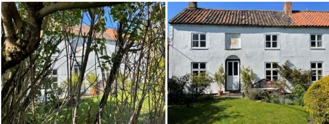
Figure 42: Rose Cottage, Lynn Road/Orchard Rd, circa 1820-1840.

Description: Lime washed brick, flint and chalk property with Norfolk pantile roof and surrounding flint wall.