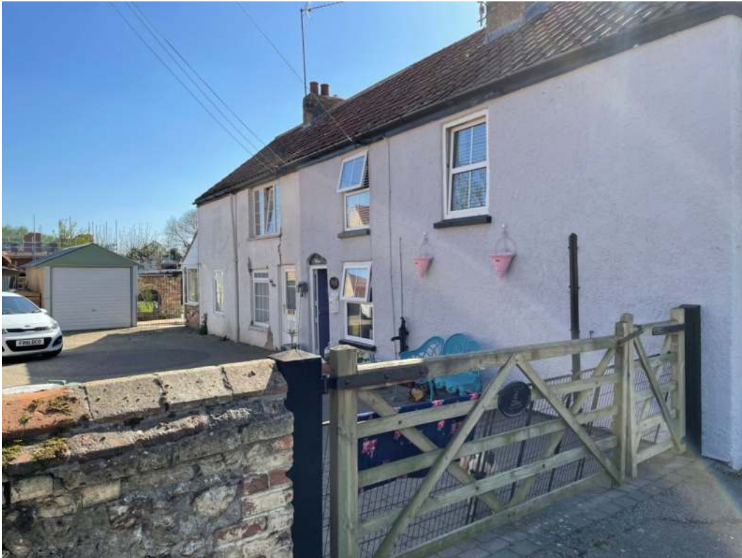
Figure 48: Pump Yard, Lynn Road, circa late 1700's

Description: Modern render covered brick and clunch cottage (appears to be several cottages now forming one residence) with pantile roof. Side facing Lynn Road.