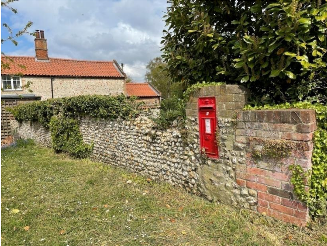
Figure 61: Antique Royal Mail Post Box inset into wall, junction of Lynn Road/B1145 and Grimston Road/B1153. Circa 1850's

Description: In service Royal Mail post box, with letters VR (Victoria Regina), signifying Queen Victoria was Monarch when it was installed.