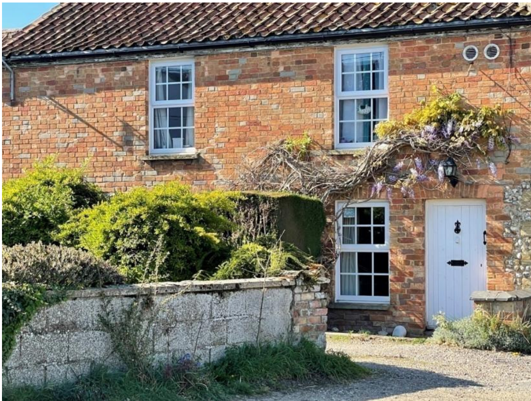
Figure 49: Pelham House, Winch Road, circa 1800's

Description: Red brick dwelling with flint and brick gable ends, pantile roof and rear extension. Side facing onto Winch Road