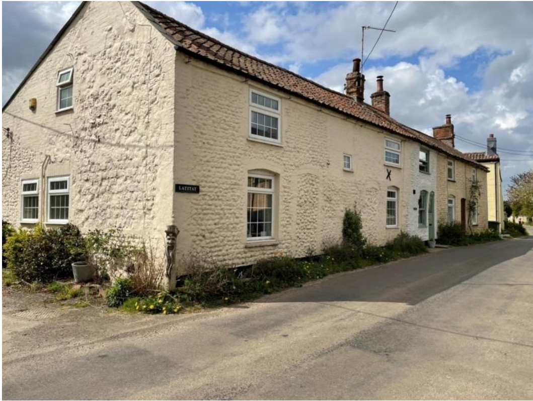
Figure 59: Latitat Cottage to Sunshine Cottage, Back Street circa 1800's

Description: Built of chalk and flint with brick additions and pantile roofs. Row of properties directly abut the road. Possible workers' cottages at one time. Sunshine Cottage circa 1700's is mainly render faced with later brick-built additions with modern windows to rear.