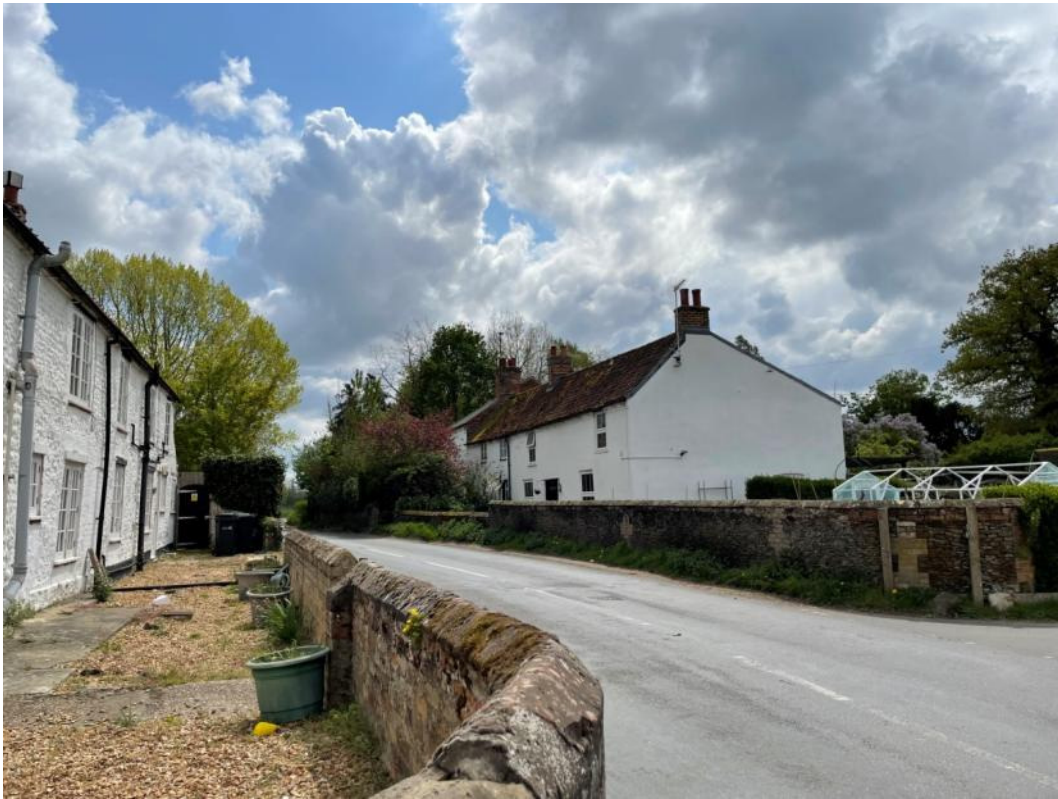
Figure 60: Cluster of Estate Cottages, East Walton Road and Back Street circa mid 1800's (B1153)

Description: White rendered brick and chalk dwellings with pantile roofs. Later addition of brick extension to rear of properties.