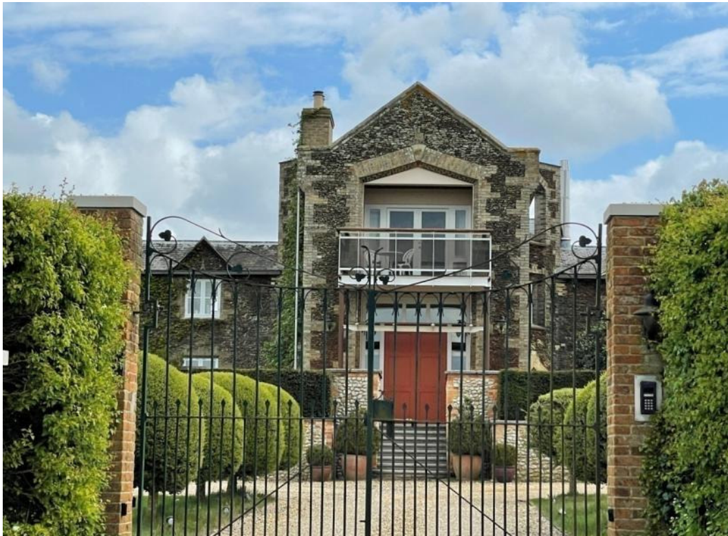
Figure 65: Eastgate House, Front façade.

Description: Substantial structure built of brick, carrstone and stone with slate tile roof, sited on an elevated position some miles from all community. Former Freebridge Lynn Union Workhouse. It later became an Old Peoples' Home 1948 – 1963. (Ref www.heritage.norfolk.gov.uk ). The property is now privately owned and has been sympathetically remodelled and split into several homes.