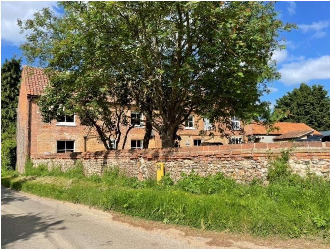
Figure 67: Manor Farm, Common Lane, circa late 1700's

Description: Large double fronted property built of red brick with pantile roof and attached barn also of brick with chalk and pantile roof. Sited at the western end of Common Lane behind a brick, flint and chalk boundary wall with wide and open access frontage to the main house.