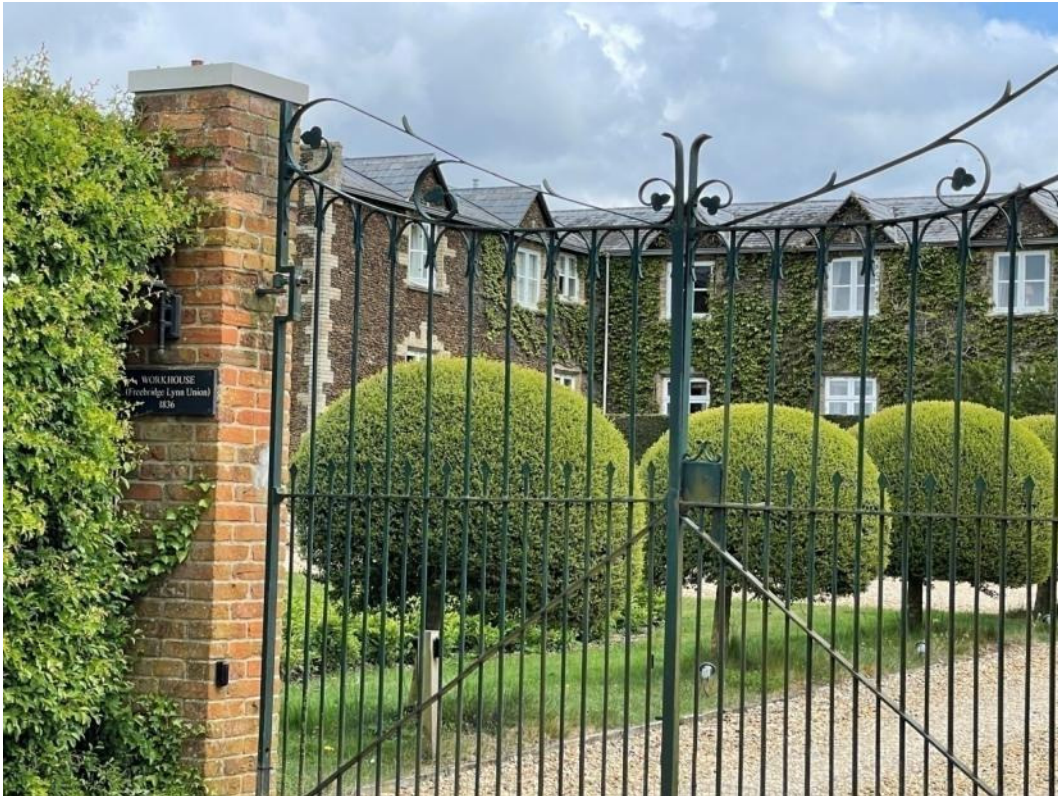
Figure 64: Eastgate House, Eastgate Drive, former Freebridge Lynn Union Workhouse, circa 1836, designed by Donthorne. North Wing.