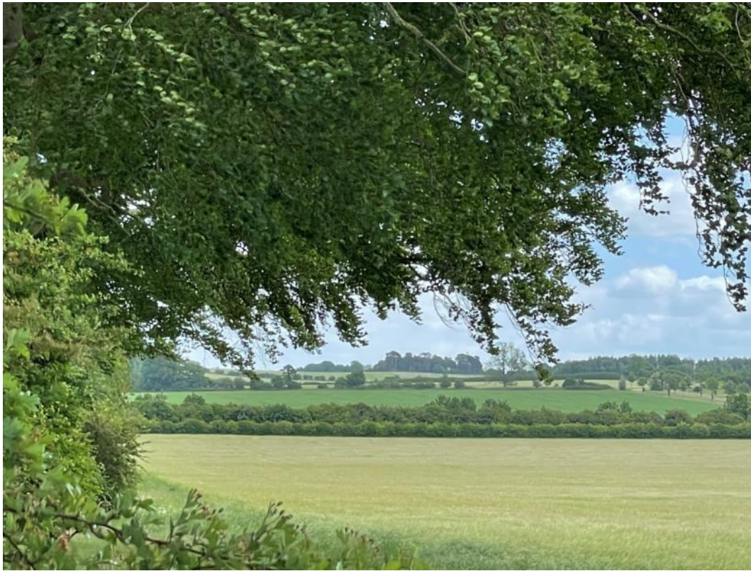
Figure 63: Gayton Clump, off Litcham Road (B1145)

Description: Rising open farm land and chalk-belt leads to the eastern side of Gayton where a copse of Scots Firs, known locally as Gayton Clump can be seen. Historically, the Gayton Clump has been used to set a beacon to celebrate jubilees.