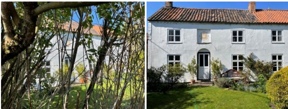
Figure 42: Rose Cottage, Lynn Road/Orchard Rd, circa 1820-1840.

Description: Lime washed brick, flint and chalk property with Norfolk pantile roof and surrounding flint wall.