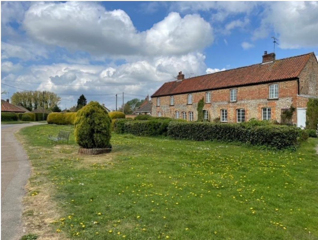
Figure 53: Church Cottages, Back Street circa late 1800's

Description: Red brick and flint built terrace of workers cottages with pantile roof and later additions of small extensions to side and rear.