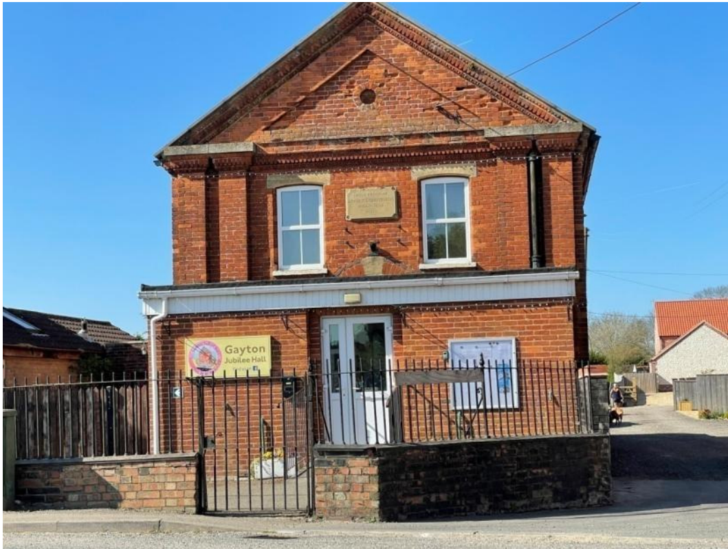
Figure 44: Jubilee Hall, Lynn Rd, circa late 1800's

Description: Gayton Village Hall former 'Friends in Need Lodge,' built late 1800's, (stone inset 1887) red brick with slate roof. Front and rear amenity additions made 1900's. Sited on corner of Lynn Rd/B1145 and Jubilee Lane.