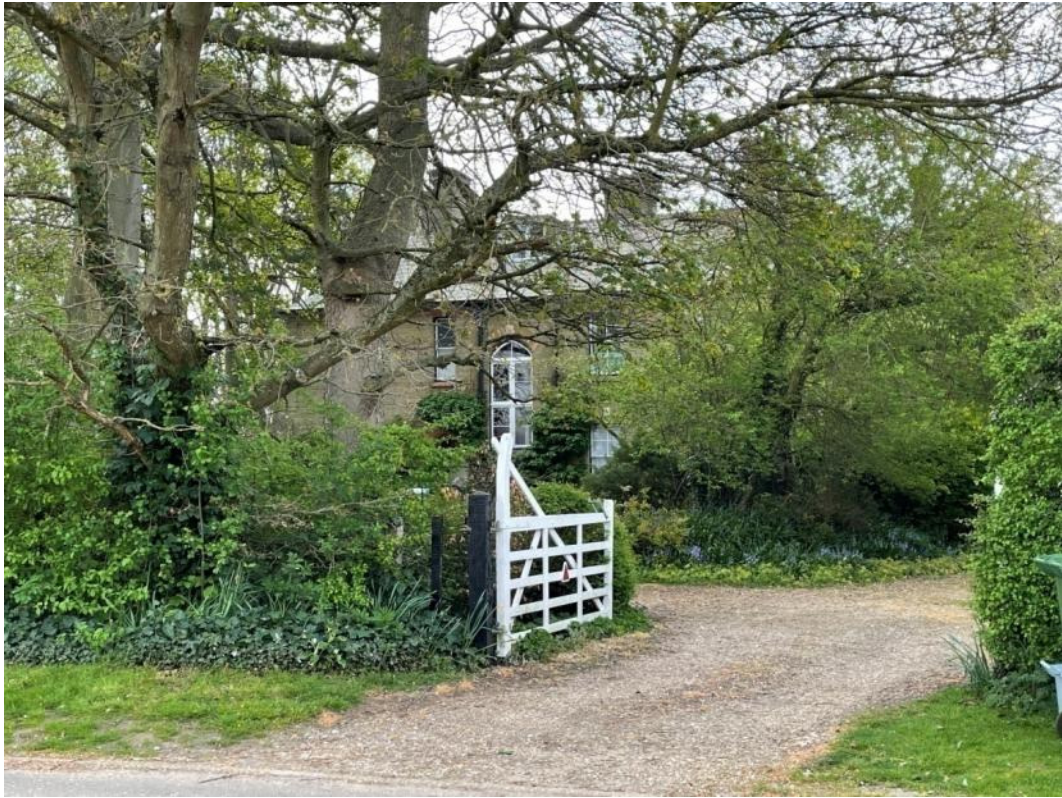
Figure 55: The Old Vicarage, Vicarage Lane, Lynn Road circa 1800's

Description: Former vicarage, built from yellow brick with slate roof and architecturally distinctive double height front facing window. The property is now a private dwelling.