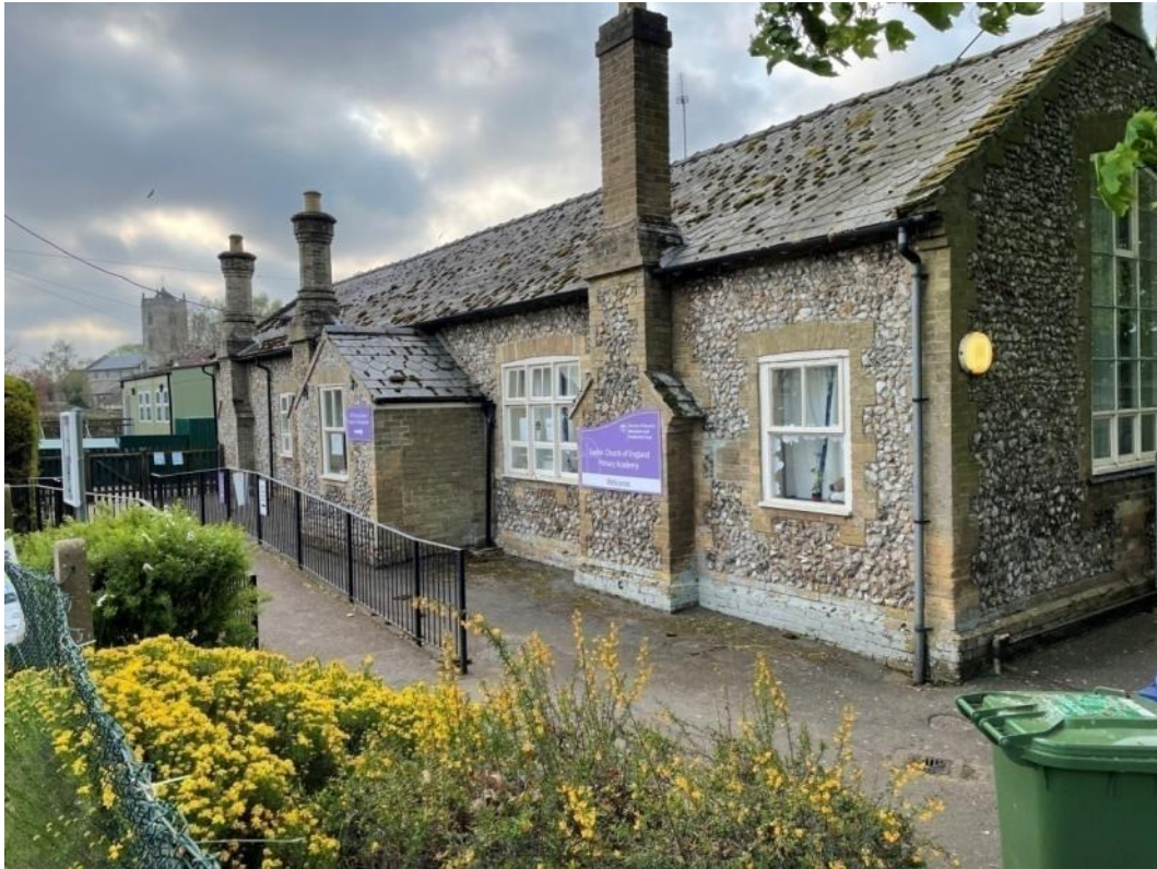
Figure 57: Gayton Church of England Primary Academy, Lynn Road, circa 1800's

Description: Brick and flint built main body of school with slate roof tiles. Distinctive single storey height building, with front porch and three tall chimney stacks. To the side and rear of main school are several nondescript portacabin buildings providing for overspill.