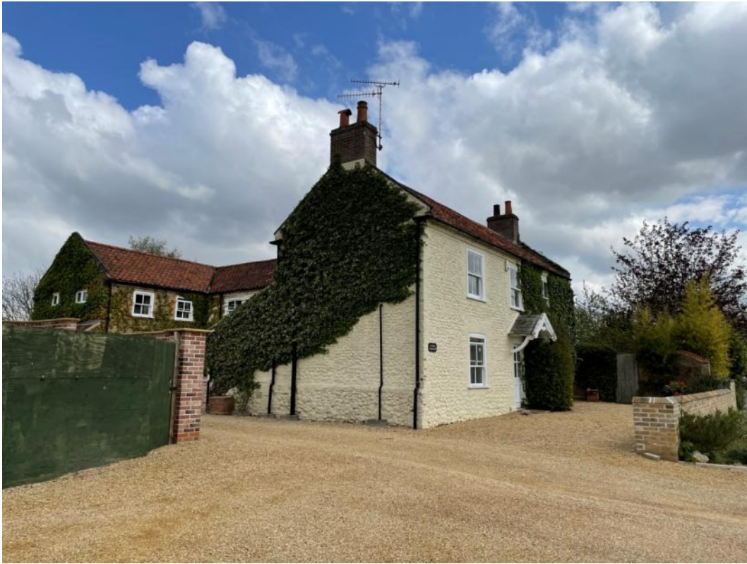
Figure 54: Manor Farmhouse, Back Street late 1700's – 1800

Description: The frontage is mostly chalk lump (clunch in the vernacular) with the single storey northern end being flint outside and chalk inside. The smaller barn to the west is carrstone and brick and is thought to be the oldest building on the site. The whole house and barn were fully renovated in 2000 with UPVC sash windows replaced with timber, original buff pantiles sourced and used and chalk walls in what is now the drawing room, renovated solely with existing materials from the site. A further significant extension was added in 2005.