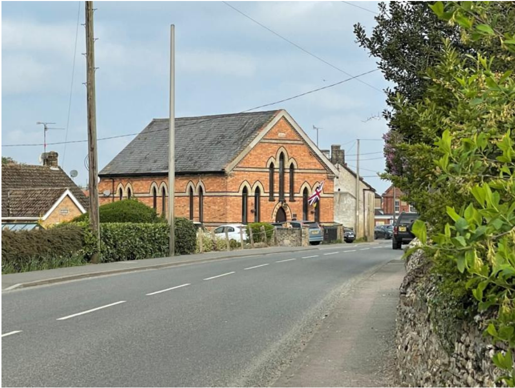
Figure 56: The Old Chapel, Lynn Road circa 1870

Description: Former Primitive Methodist Chapel built from red brick with distinctive yellow brick decoration around the arched windows and slate roof. It was extended in 1883. The Chapel was sold in 2015 and converted to a private dwelling.