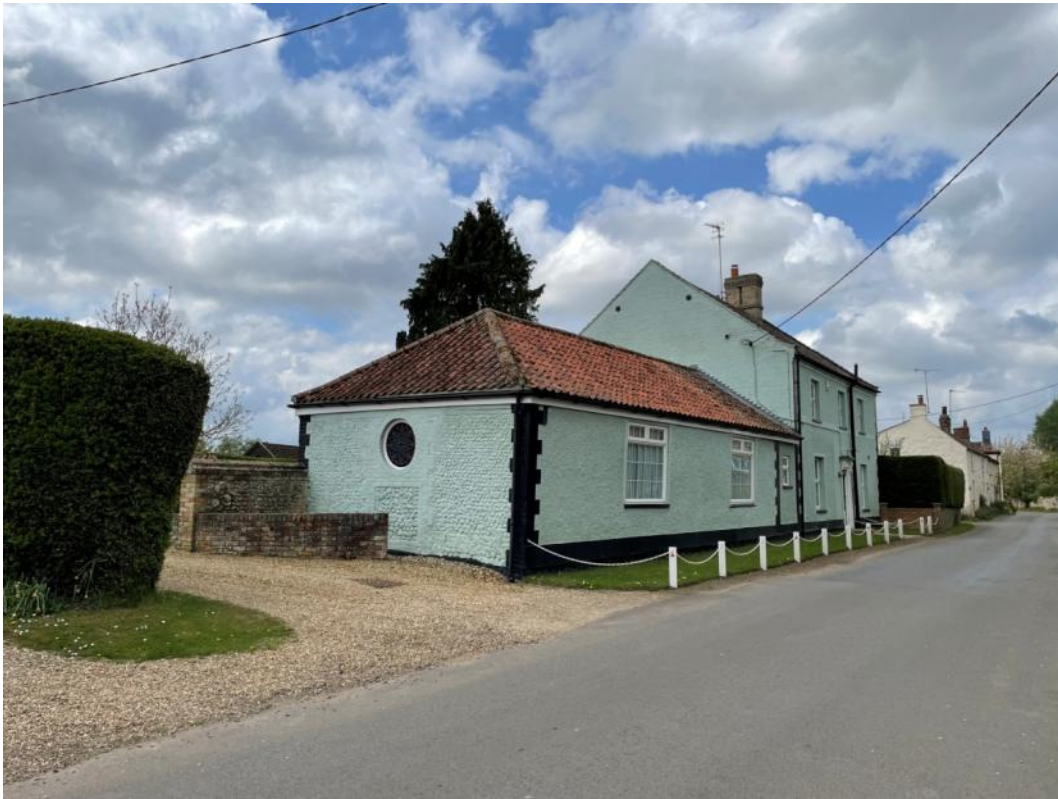
Figure 58: Lattice House, Back Street, circa 1750

Description: Main body is brick built and render, gable ends are flint and render, possible sub level in chalk and flint. The oldest part of the building is single storey, circa 1750 and had been a Chapel. The dwelling is now privately owned but historically was one of several Public Houses along Back Street.