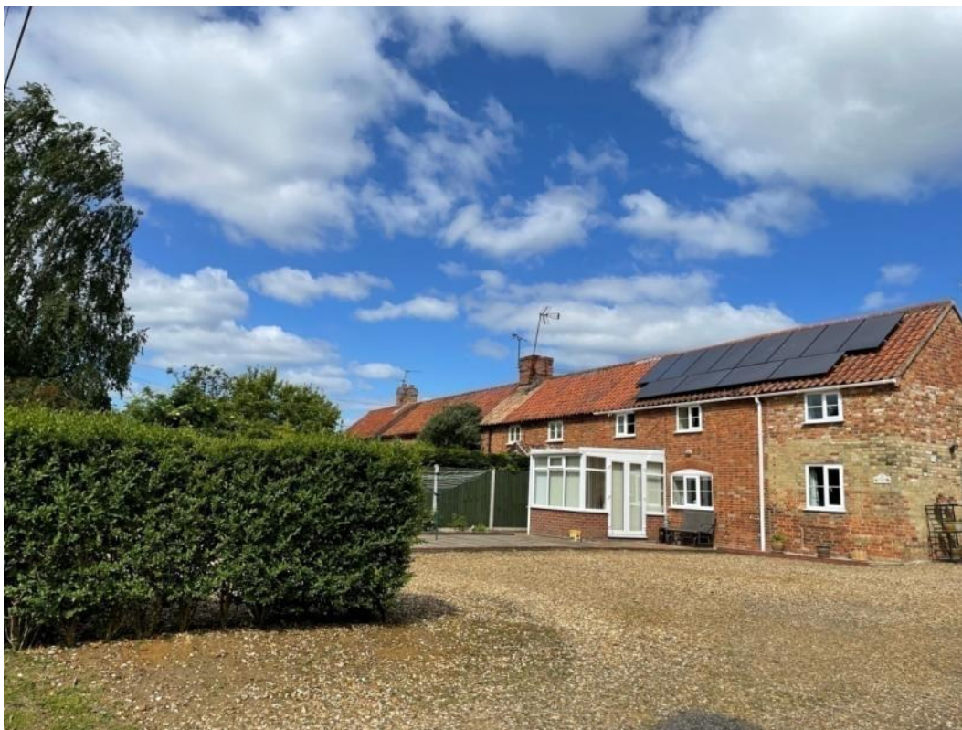
Figure 68: Well Yard Cottages, Common Lane, circa 1800's (Possible late 1700's)

Description: Originally terrace of four Estate cottages built from red brick with pantile roof, all with small casement windows.