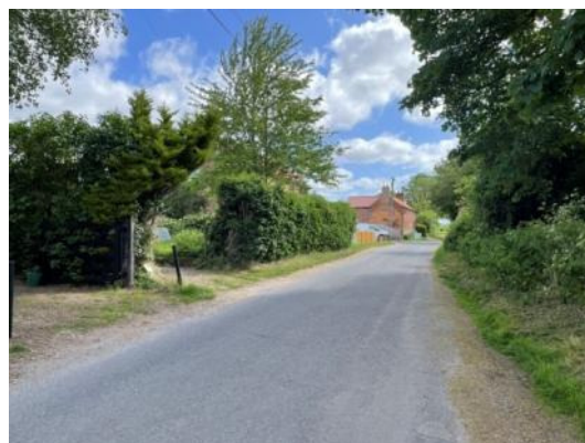
Figure 70: Row of 4 pair semi-detached workers cottages

Description: Originally built as Estate farm cottages from locally sourced red brick, with A-frame roofs forming the upper storey and with flint and chalk gable ends and pantile roofs.