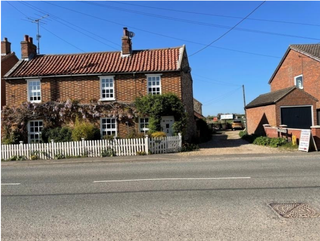
Figure 45: The Old Smithy, Lynn Road and Blacksmiths Row, circa mid 1800's

Description: Red brick triple fronted house with pantile roof and clapboard fencing to front. Side elevations are of flint construction. Property originally three separate one down—one up cottages with a stable and blacksmiths attached to the cottage bordering Blacksmiths Row. Older parts of property are judged to have been built around 1800.