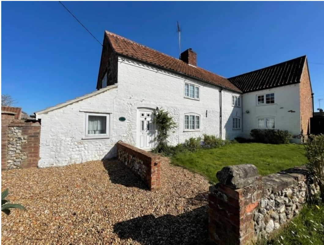
Figure 51: Rosemary Cottage, Rosemary Lane, circa early 1800's

Description: Built of brick, chalk and flint with gable ends mainly of carrstone, with pantile roof and side extensions.