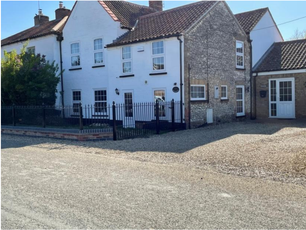
Figure 50: Oakdene, Winch Road, circa mid to late 1800's

Description: Brick, chalk and flint dwelling, with pantile roof and several extensions, recently renovated.