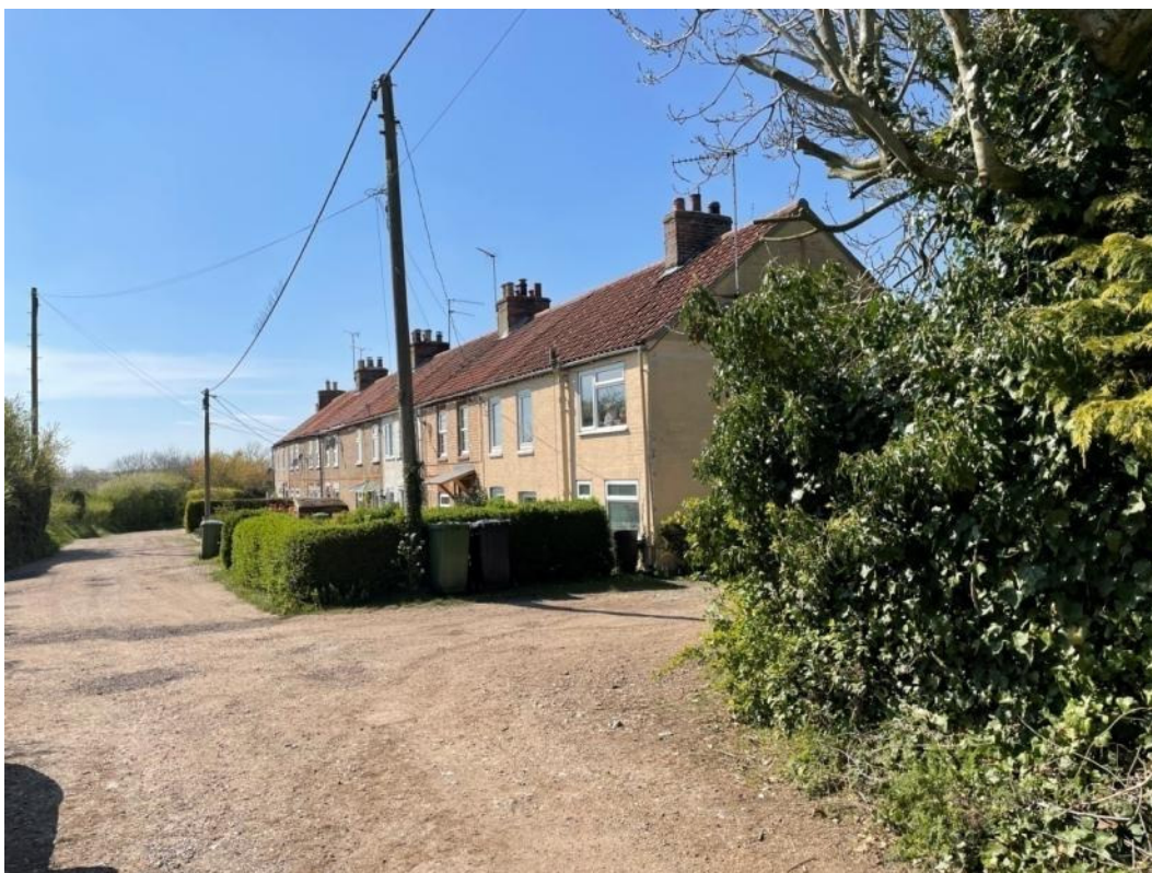
Figure 43: Ebenezer Cottages. Lime Kiln Rd, circa 1840-1914

Description: Row of workers cottages built of brick and flint with Norfolk pantile roofs.