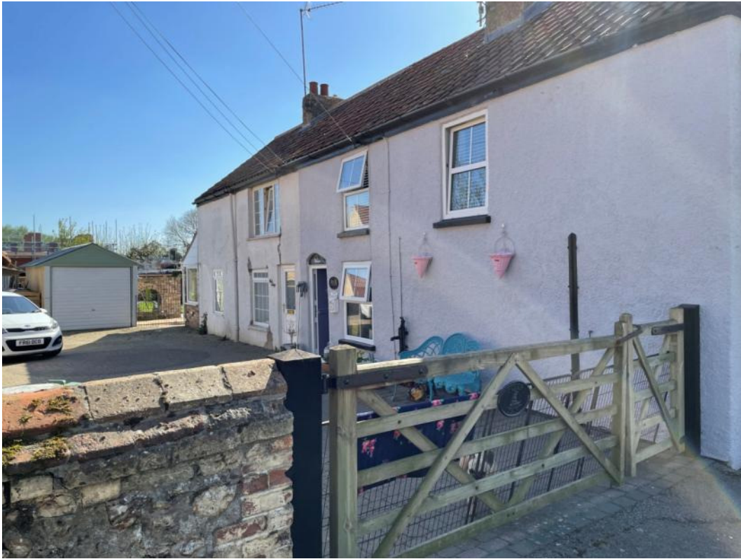
Figure 48: Pump Yard, Lynn Road, circa late 1700's

Description: Modern render covered brick and clunch cottage (appears to be several cottages now forming one residence) with pantile roof. Side facing Lynn Road.