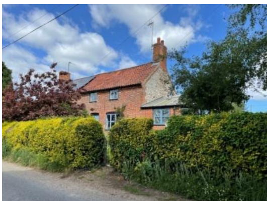
Figure 69: Semi-detached workers cottage - example