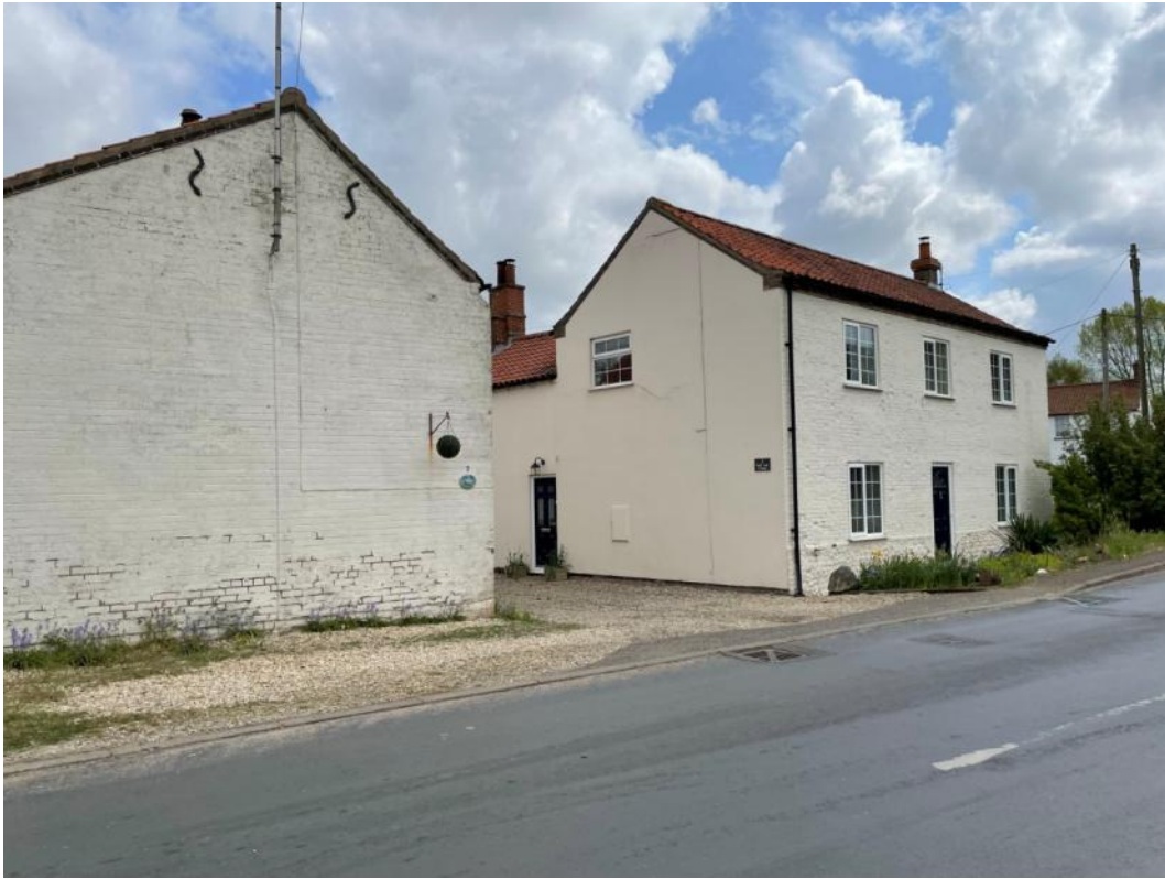
Figure 62: Mill End Cottages Numbers 1, 2 and 3, circa mid 1800's, Grimston Road

Description: Whitewashed brick and chalk construction artisan cottages, with pantile roofs and arranged around area of land to the rear.