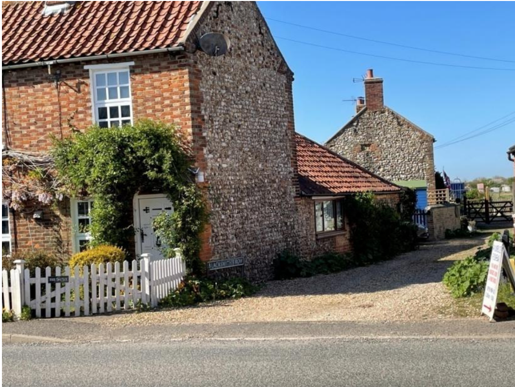
Figure 46: Row of Classic Terraced Cottages at Blacksmiths Row and at rear of The Old Smithy, circa mid 1800's

Description: Red brick and Flint construction with pantile roofs.