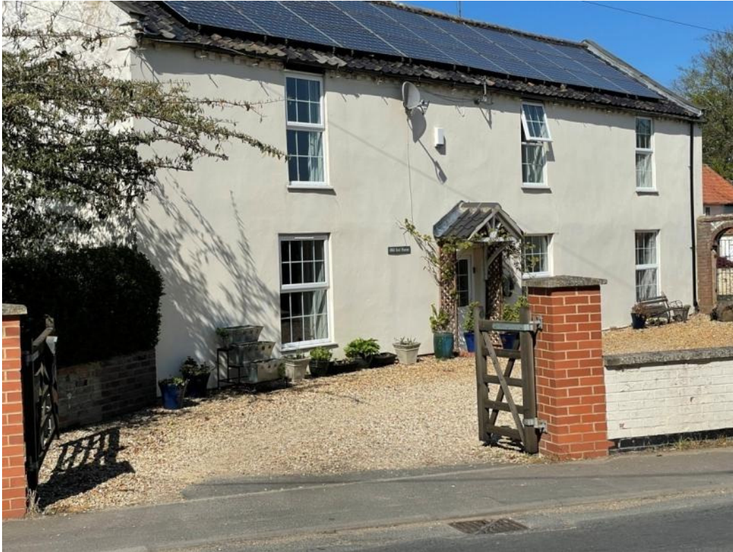
Figure 41: Mill End House, Lynn Rd -B1145/Grimston Rd -B1153

Description: White Norfolk brick, flint and chalk property with pantile roof, circa 1840-1914