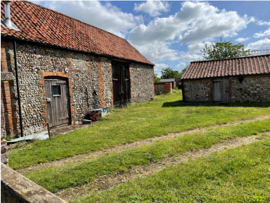
Figure 52: Barns to Rosemary Cottage, Rosemary Lane, circa early 1800's

Description: Both barns are built of chalk and flint with brick inclusions. Pantile roofs, oak doors and frames.