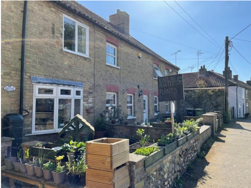
Figure 47: Row of Classic Terraced Cottages, Lynn Road, circa late 1800's. Situated opposite the Old Doctors house dated 1880.

Description: 'The Cottage'/'Mabeldene' etc Yellow brick built construction with red brick decoration and pantile roofs.