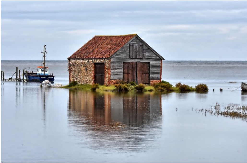
A The Coal Barn