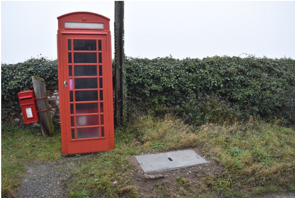
L The phone box near Green Lane