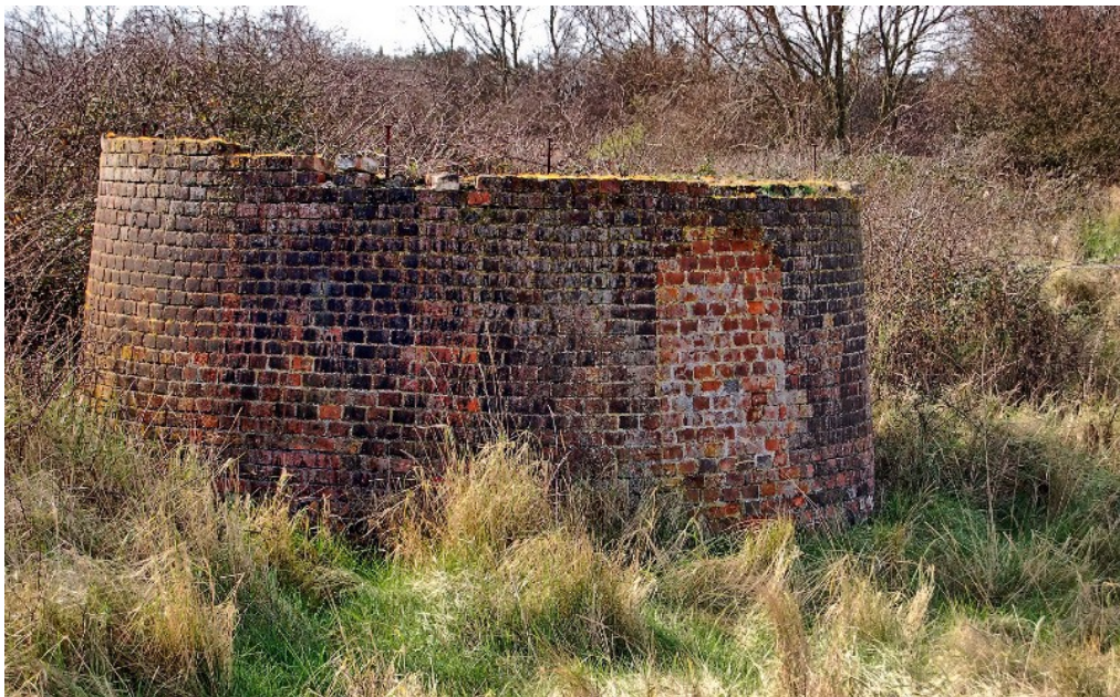
C The Old Windmill on Staithe Lane