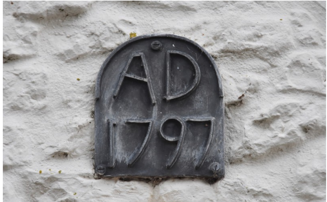
F 1797 plaque on Church View