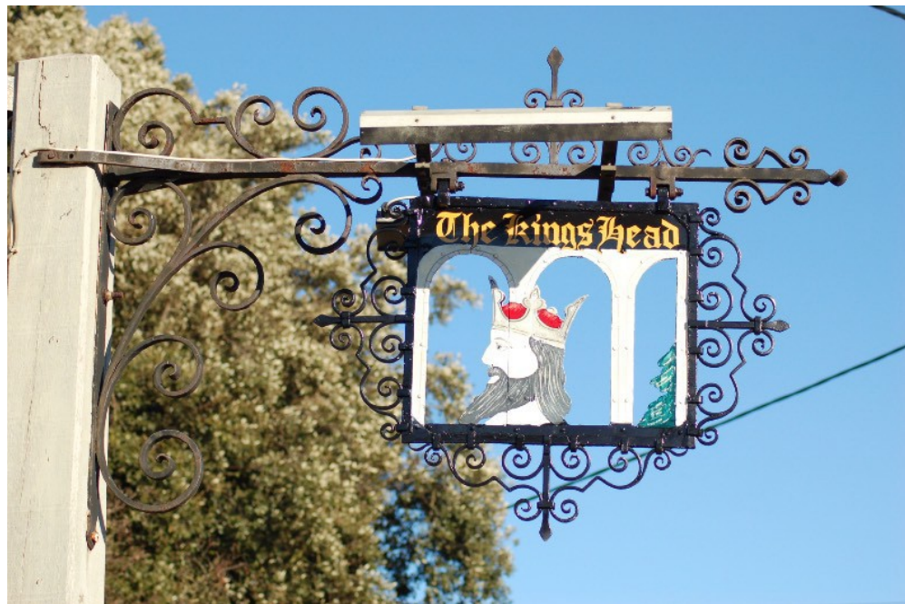
K The King's Head sign