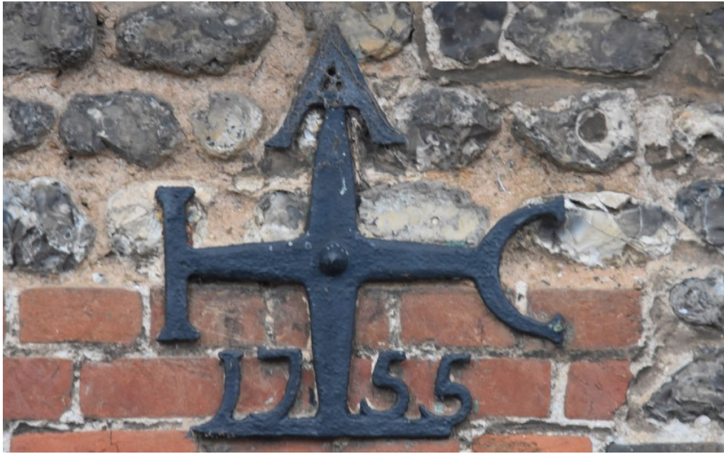
I 1755 plaque on York Cottage