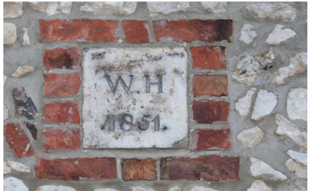
D Plaque at West End Cottage