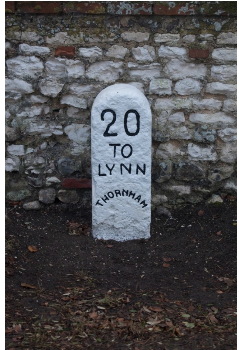
N The Milestone