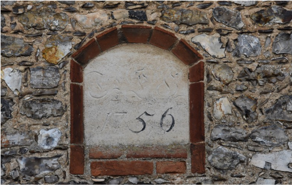
E 1756 plaque on Chestnut Cottage