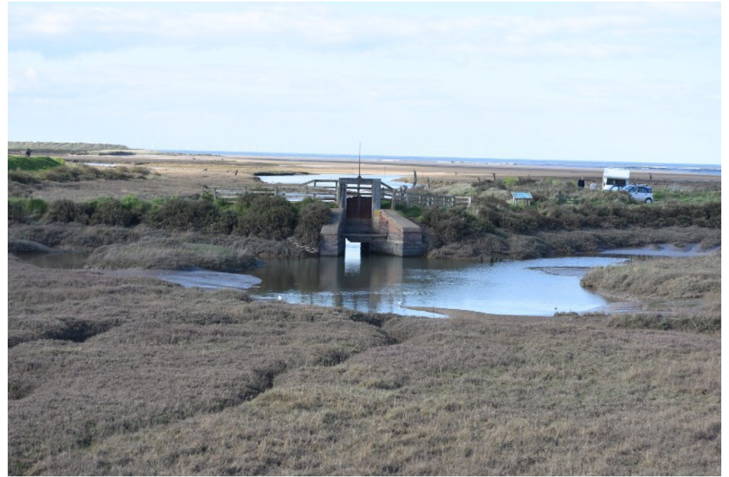
B The sluice gates, old granary site, the harbour and its structures