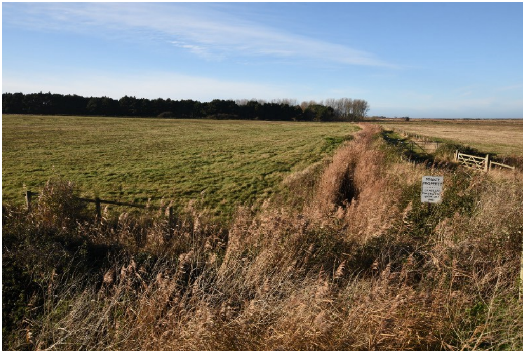
M The Plug Pits