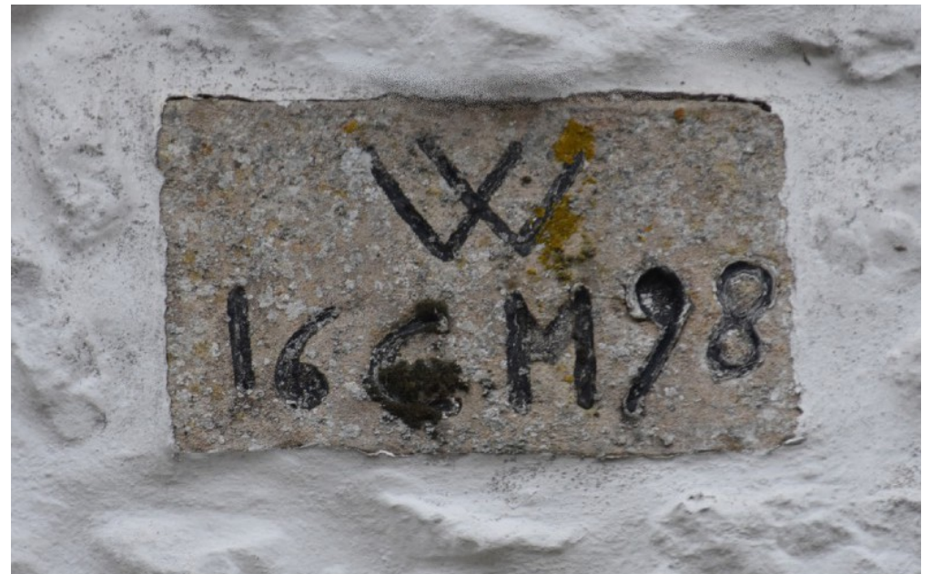
H 1698 plaque on Chalen Cottage