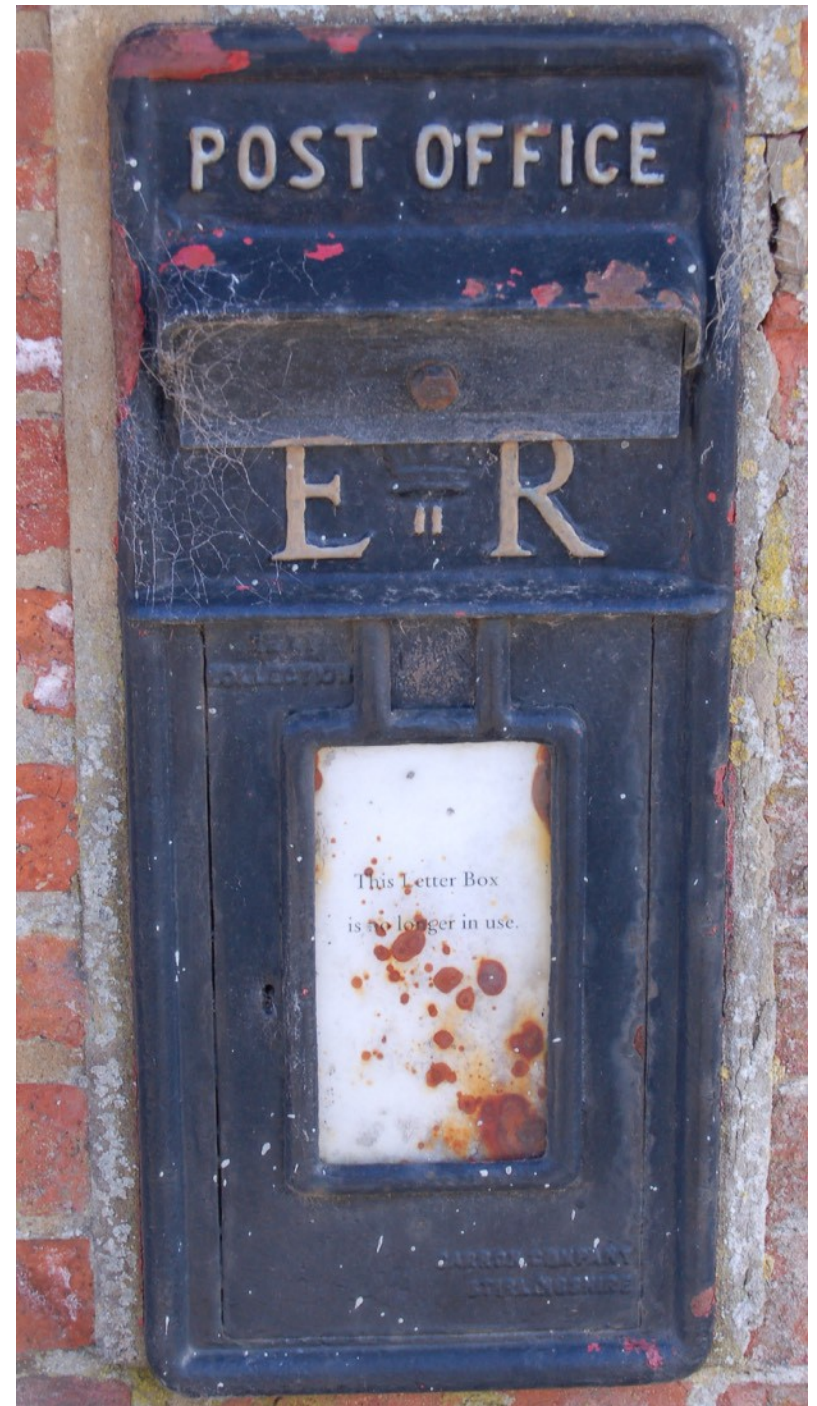
J The old Post Box at Dix Cottage