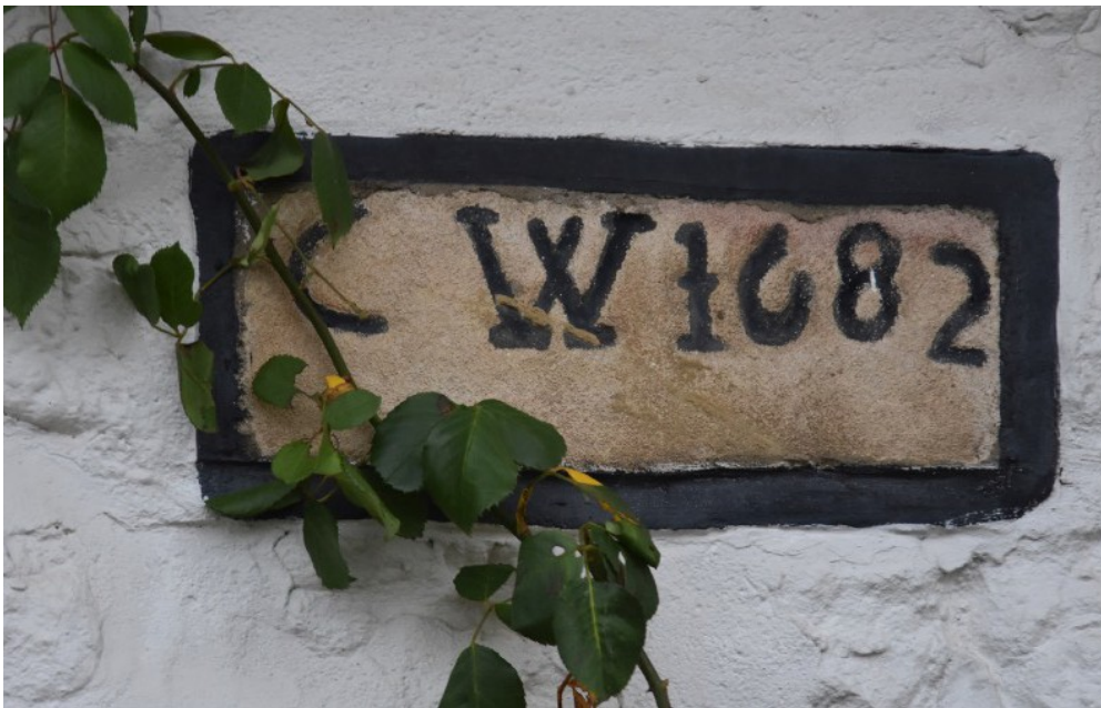
G 1682 plaque on Hope Cottage