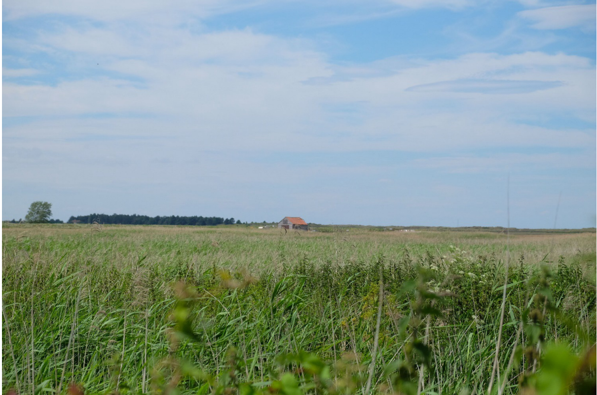
8. Looking south towards the village from the old sea wall between Staithe Lane and Marshside