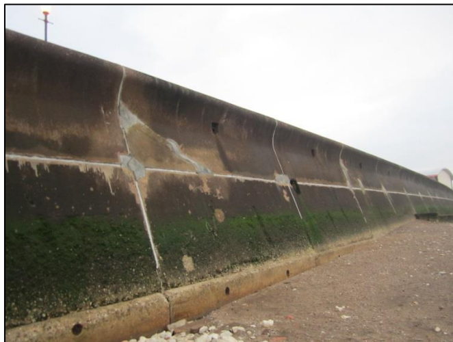
Figure 3: Photograph of recent patch repairs on seawall in Section G