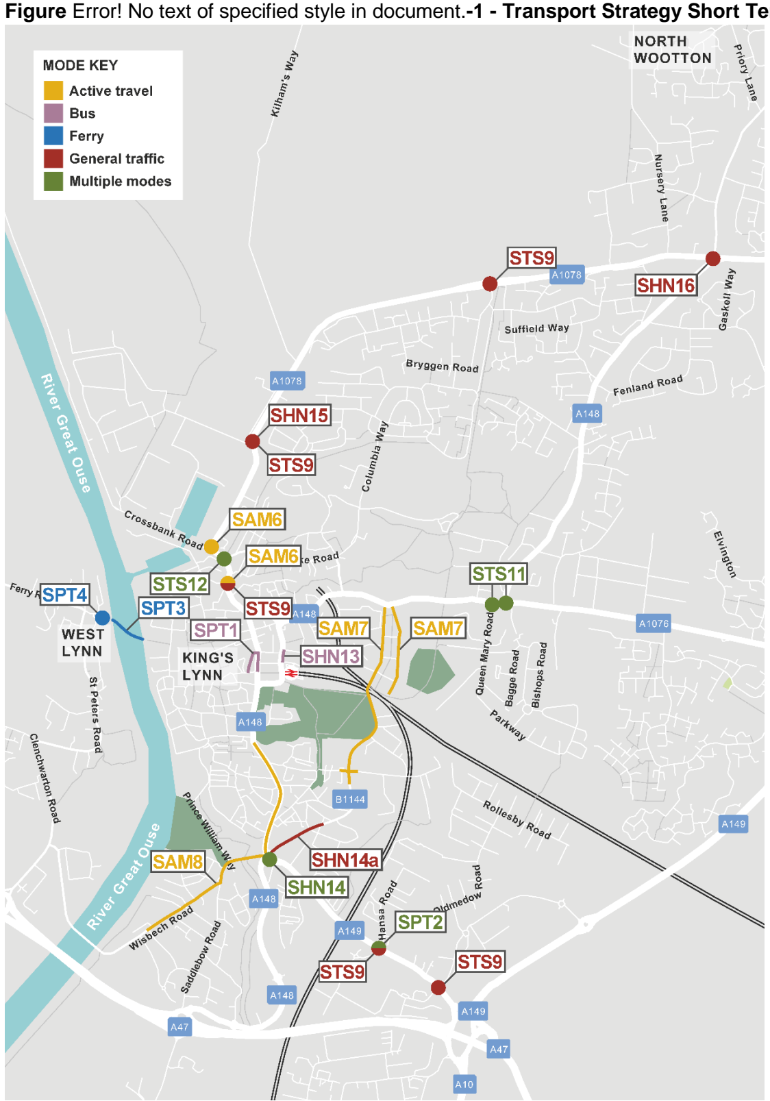
Figure Error! No text of specified style in document.-1 - Transport Strategy Short Term Options

The location of the short-term options is included in the figure below, detailed in tables 6-1 to 6-5.