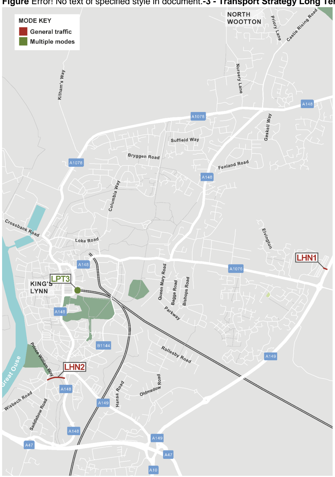
Figure Error! No text of specified style in document.-3 - Transport Strategy Long Term Options

The locations of the Long-term options are shown in the figure below, detailed in tables 6-9 to 6-10.