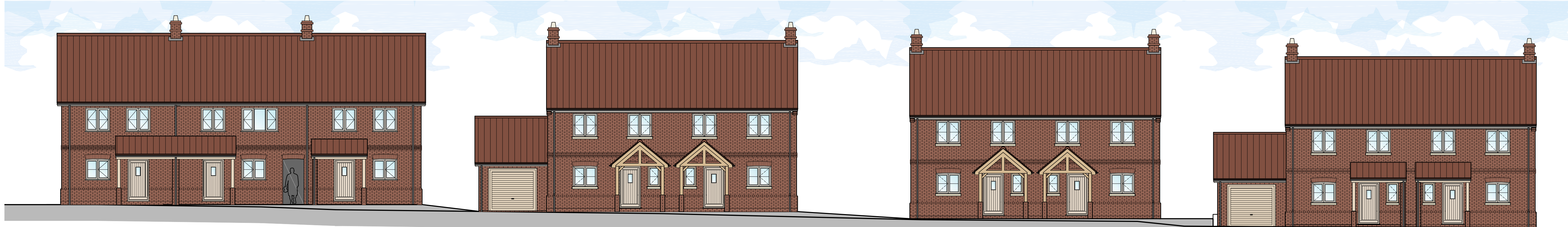
INDICATIVE FRONT ELEVATIONS NOT TO SCALE

Notes: This document is the property of David Trundle Design Services Ltd and may not be reused, loaned or copied in part or in whole without written permission © 2017 All dimensions are in millimetres unless stated otherwise. It is recommended that information is not scaled off this drawing. This drawing should be read in conjunction with all other relevant information, specifications & schedules. If this drawing is received electronically it is the recipient's responsibility to print the document at the correct scale. All dimensions to be checked on site prior to commencing work and any discrepancies to be advised immediately. CONSTRUCTION (Design & Management) REGULATIONS 2015: David Trundle Design Services Ltd are employed as 'Designer' and will provide information to those responsible for the 'Principal Designer' and to the client. David Trundle Design Services Ltd are responsible for the 'Architectural' design of the elements included on this drawing only. Architectural design has been carried out with due consideration for the safety during construction, occupation and maintenance of the finished structure. The works contain no extraordinary hazards or risks that are not present during routine construction operations that would not readily be apparent to a competent contractor. This information should be included as part or commencement of the Health and safety file for the project.