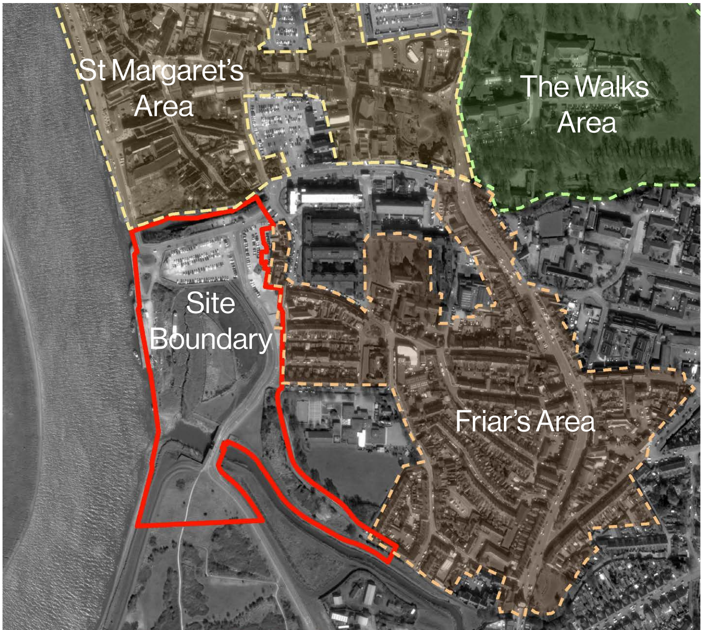
King's Lynn Conservation Areas