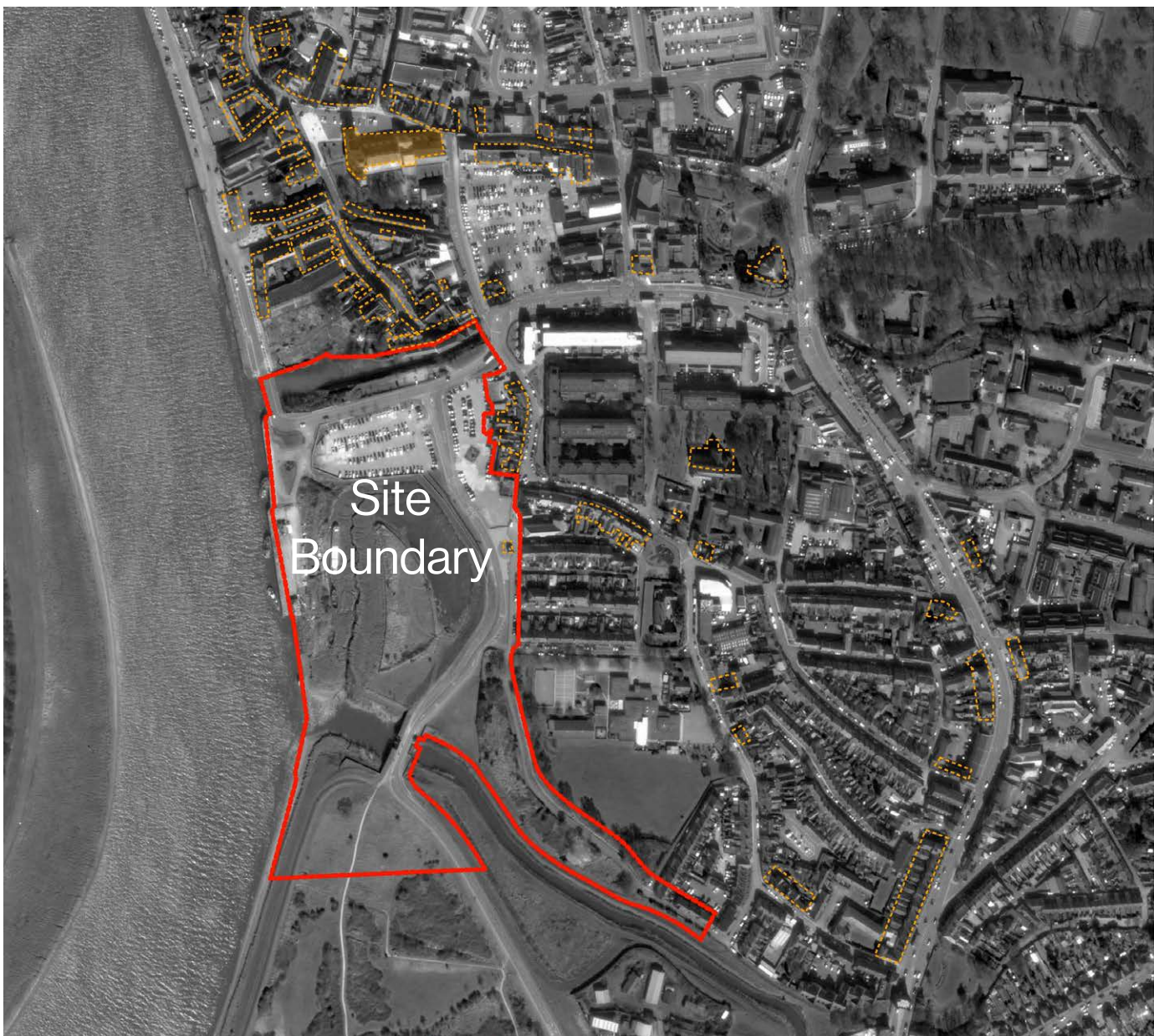
Red Line Boundary with locations of surrounding listed buildings