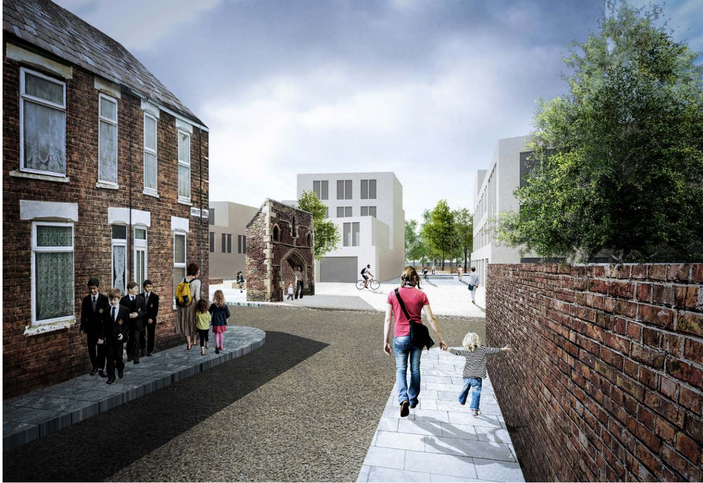
View from The Friars and Whitefriars Gate to proposed park with illustrative buildings