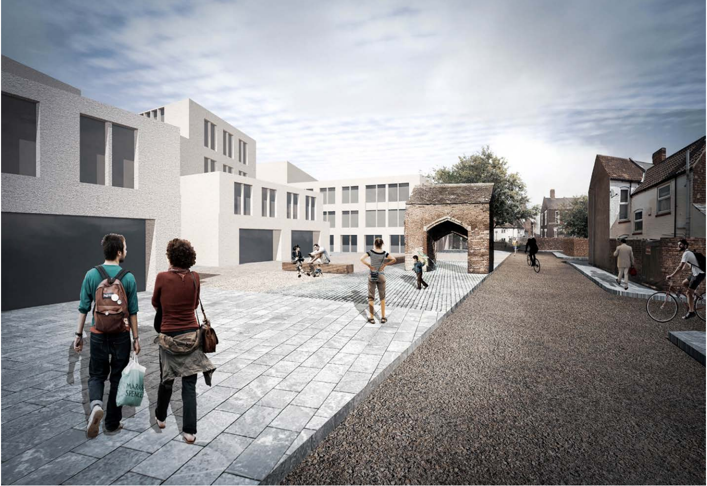
View along The Friars towards Whitefriars Gate with illustrative buildings