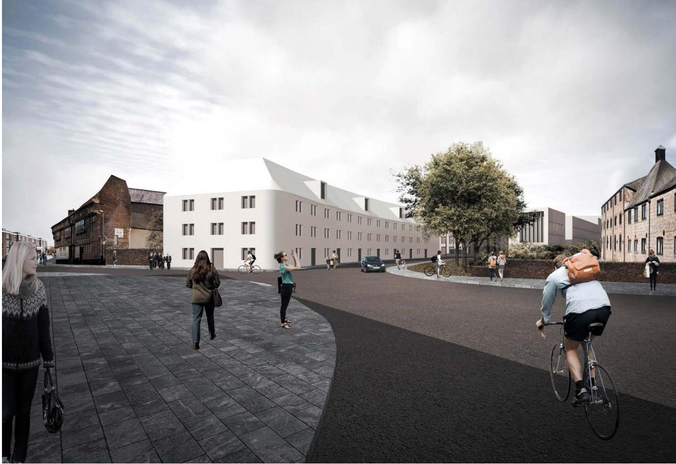
View towards Bridge Street with illustrative buildings and existing heritage assets