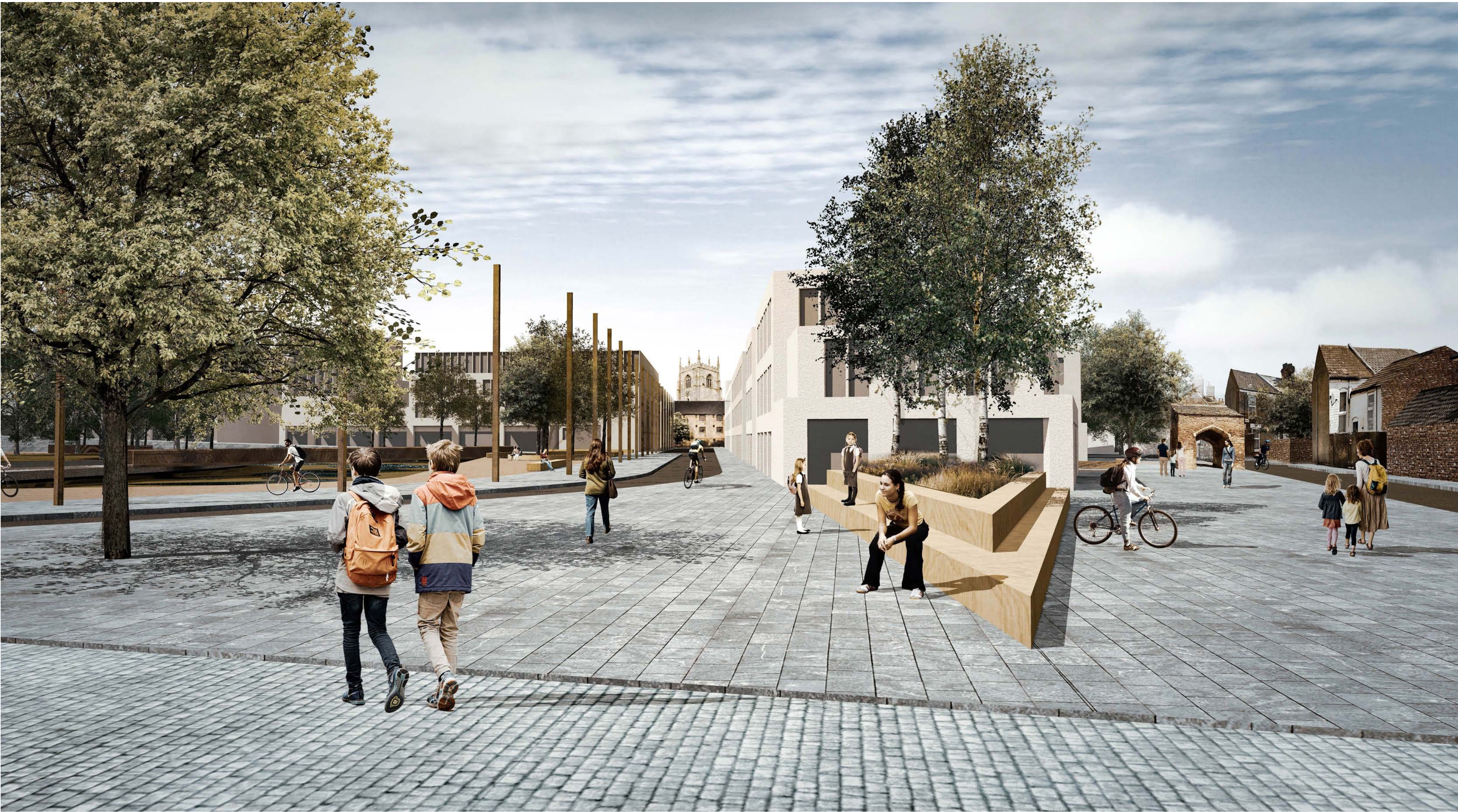
View of proposed wetland park and illustrative buildings along Hardings Way capturing key sightlines to King's Lynn Minster and Whitefriars Gate