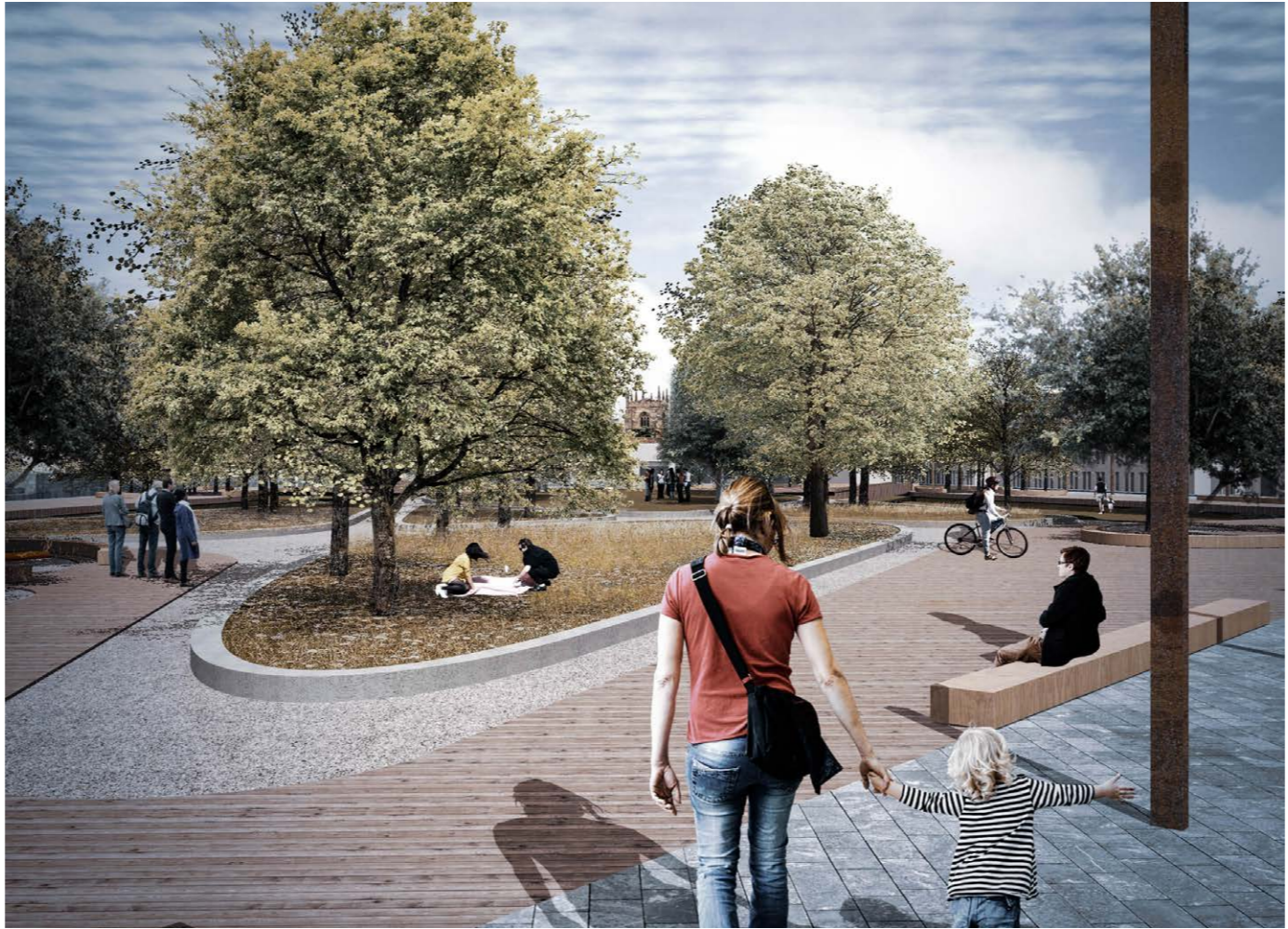
Views to Kings Lynn Minster through Wetland Park and Nar Loop