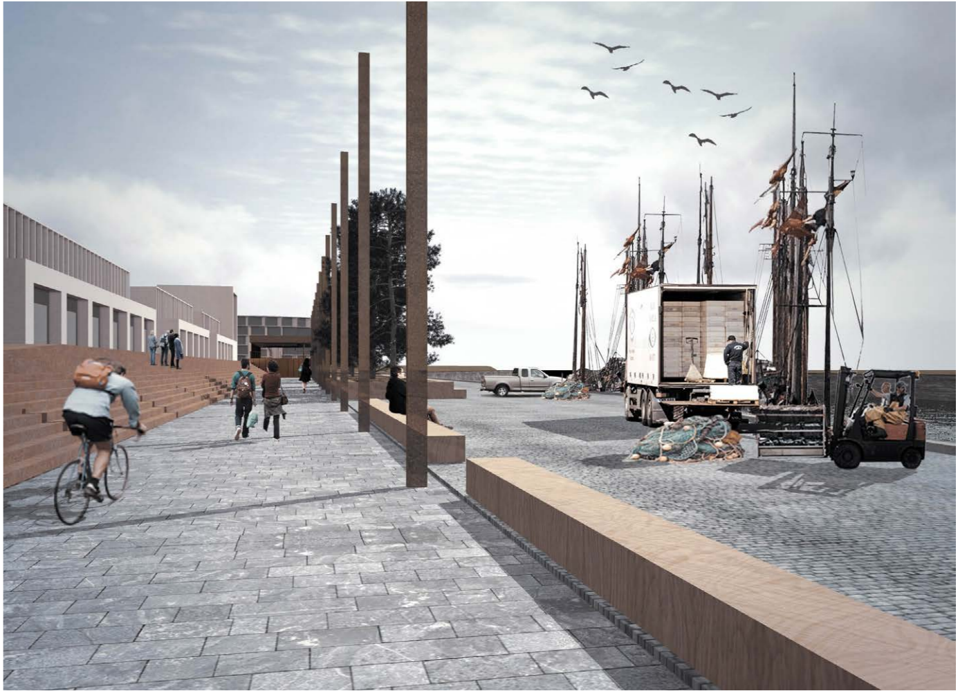
View over River Great Ouse and Quayside