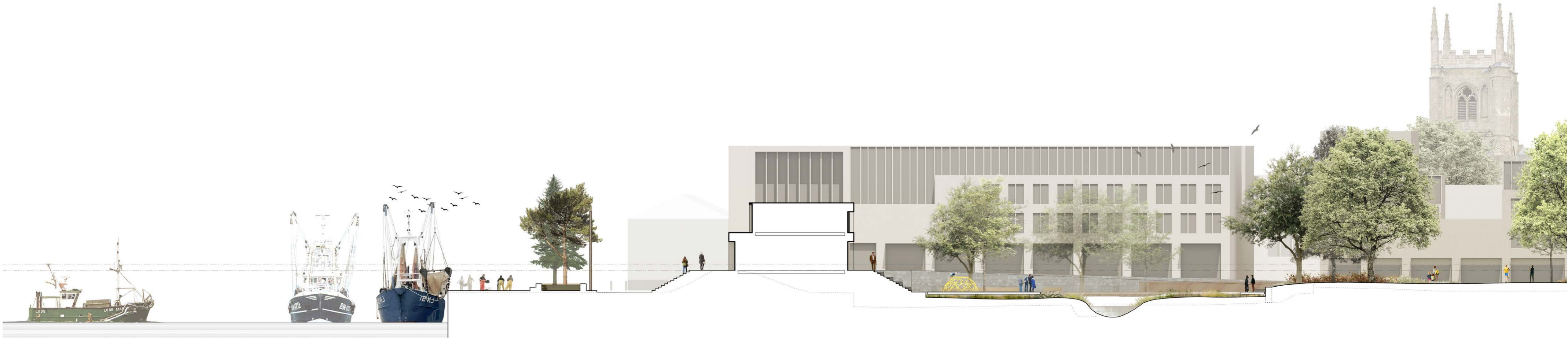
Proposed Section Through the Quayside, Wetland Park with views to King's Lynn Minster