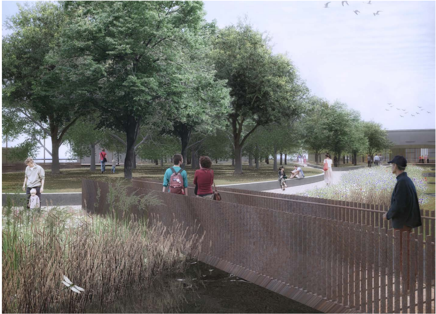
View through the Proposed Wetland Park