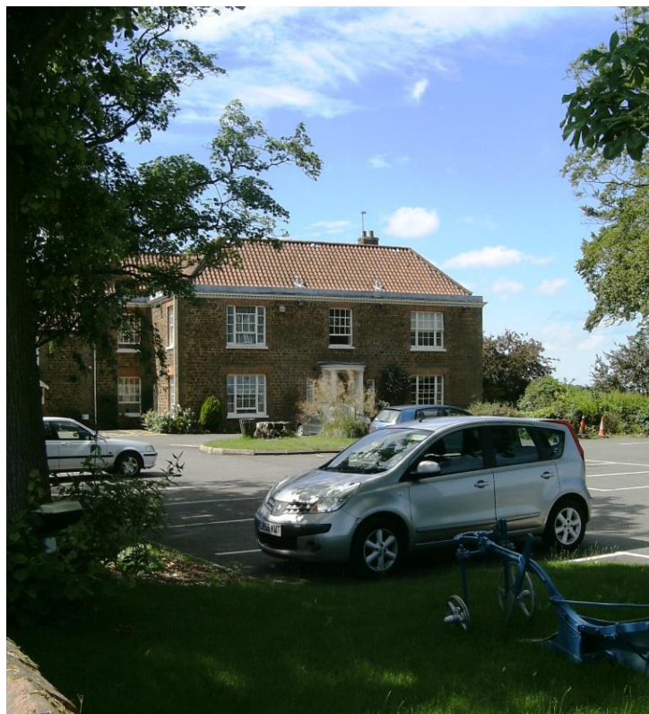
Plate 32: The Grade II listed Rising Lodge, looking south-west