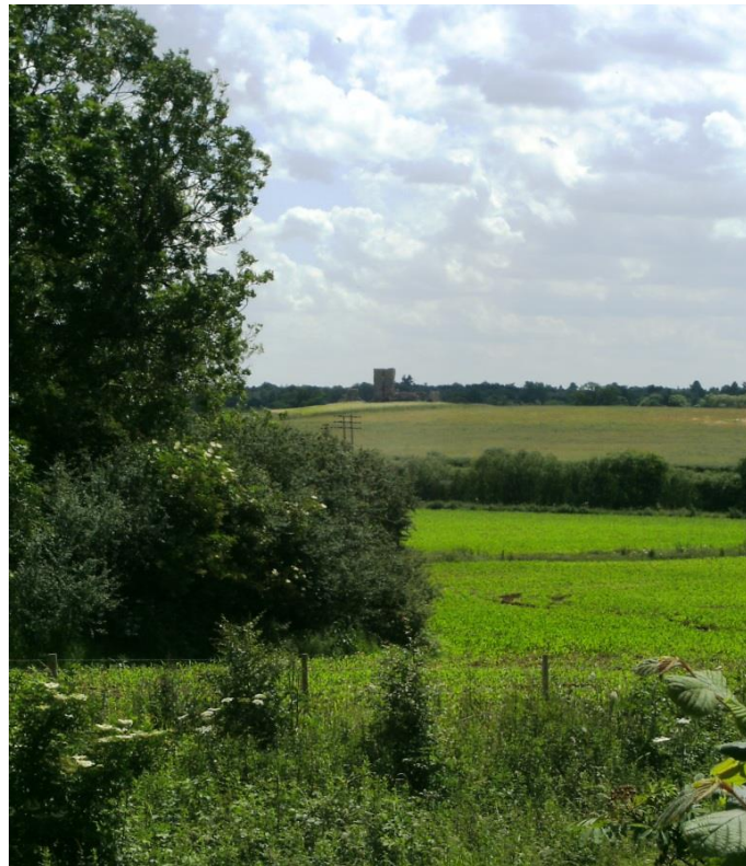
Plate 24: Field 2, looking south-east across the site boundary towards the ruins of St James' Church, Bawsey (zoomed view)