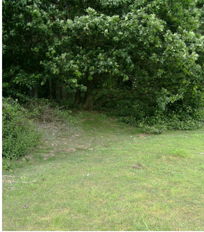
Plate 31: Field 2, ditch and earthwork bank on western boundary of the field, looking north-west