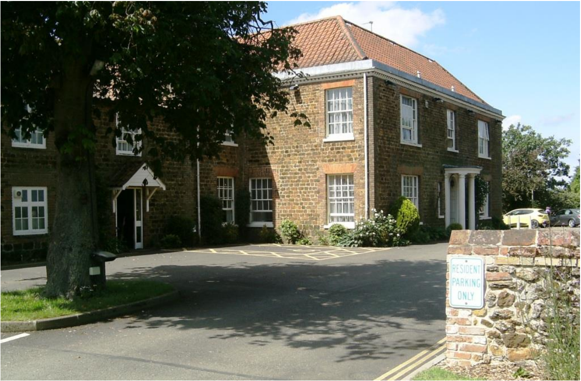
Plate 32a: The Grade II listed Rising Lodge, looking west