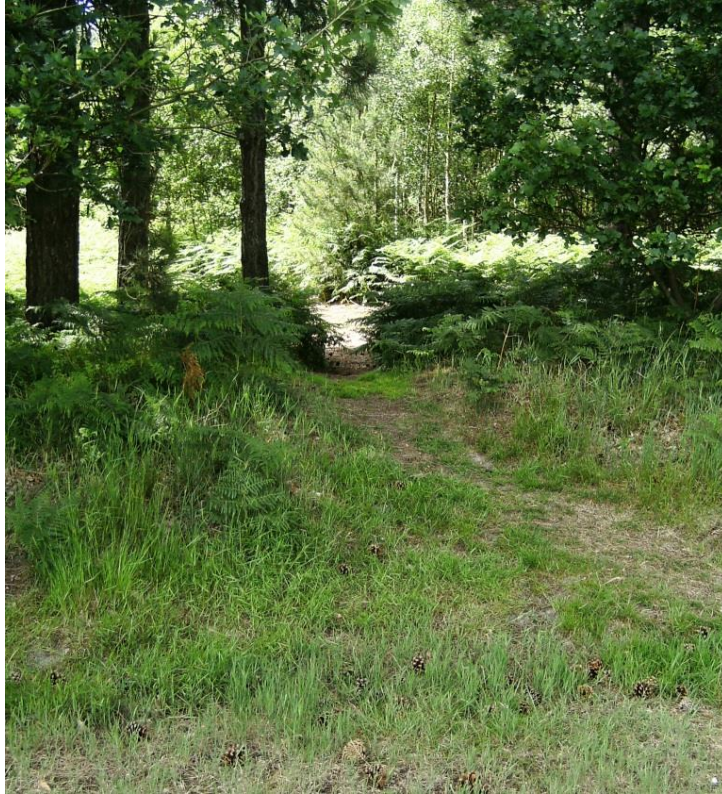
Plate 29: Field 2, parallel earthwork banks and ditch on western boundary, looking west into Reffley Wood