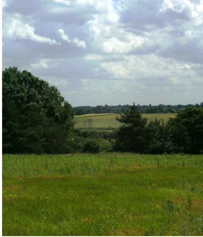
Plate 25: Field 2, looking south-south-east from western boundary across the field towards the ruins of St James' Church, Bawsey