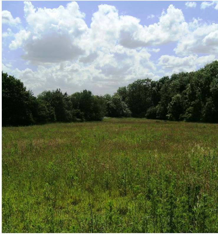
Plate 26: Field 2, looking south towards the southern end of the field