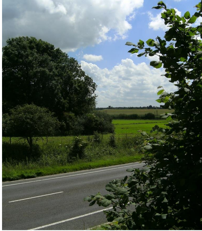
Plate 23: Field 2, looking south-east across the site boundary towards the ruins of St James' Church, Bawsey