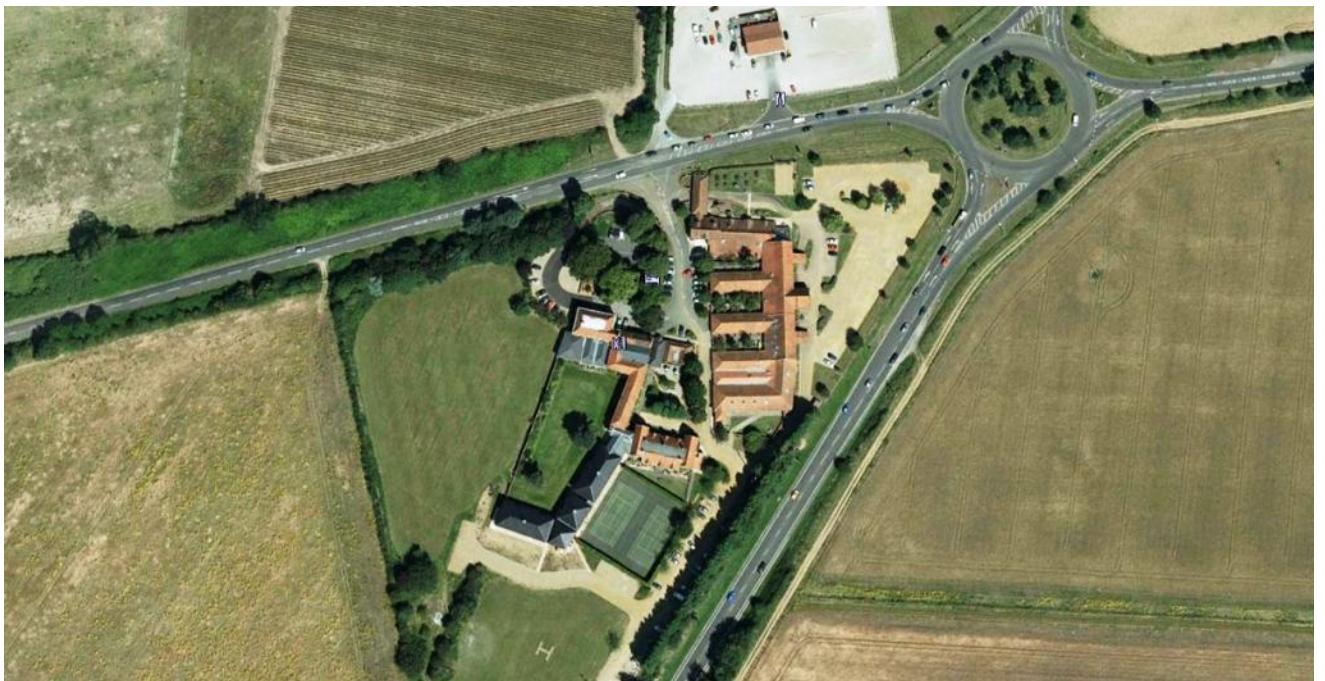
Plate 38: Satellite photograph of Knight's Hill Hotel and its environs, dated 2007