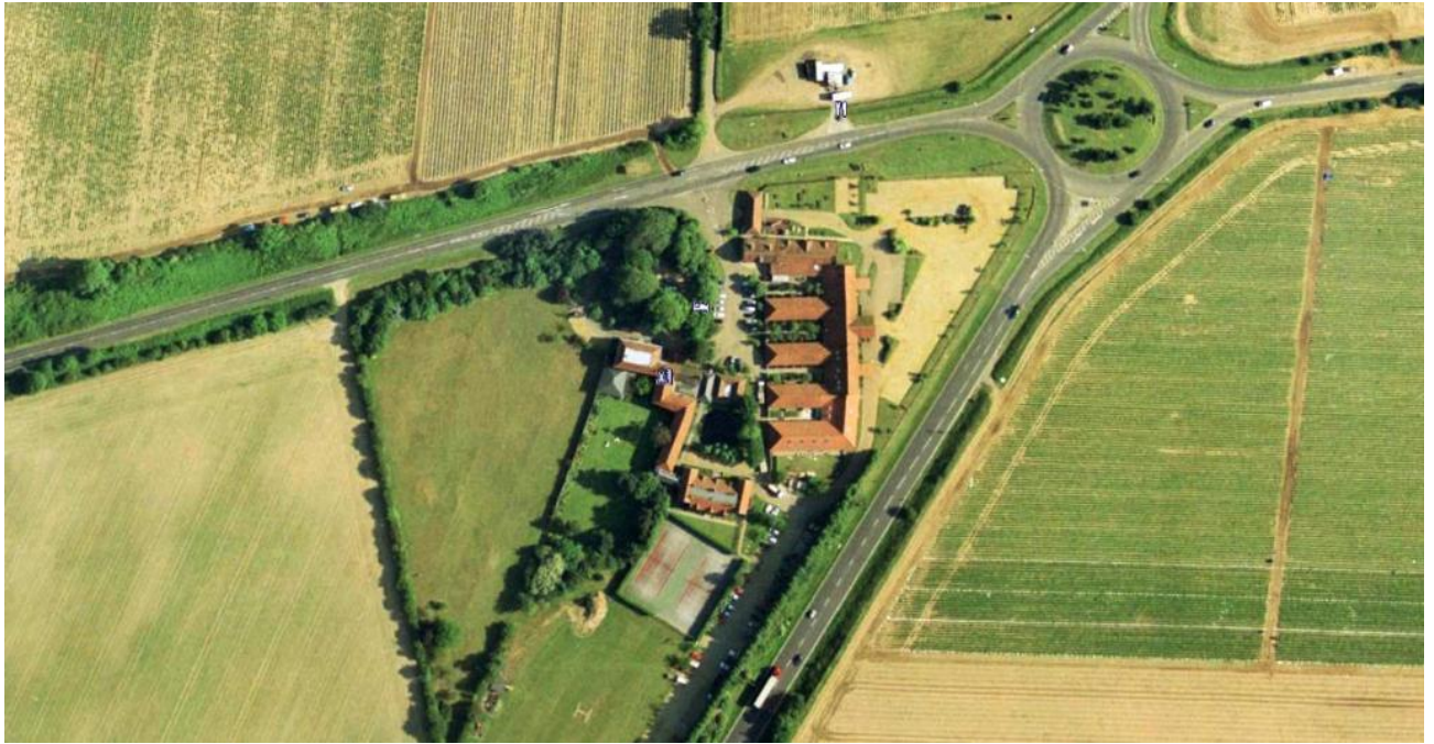
Plate 37: Satellite photograph of Knight's Hill Hotel and its environs, dated 2006