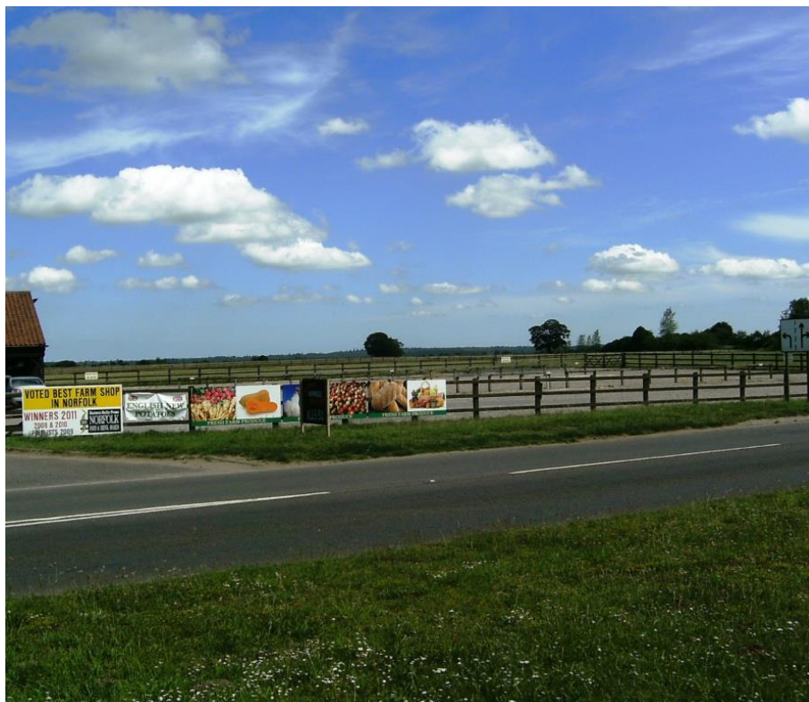
Plate 35: View towards Castle Rising from Knight's Hill Hotel entrance, looking north-east