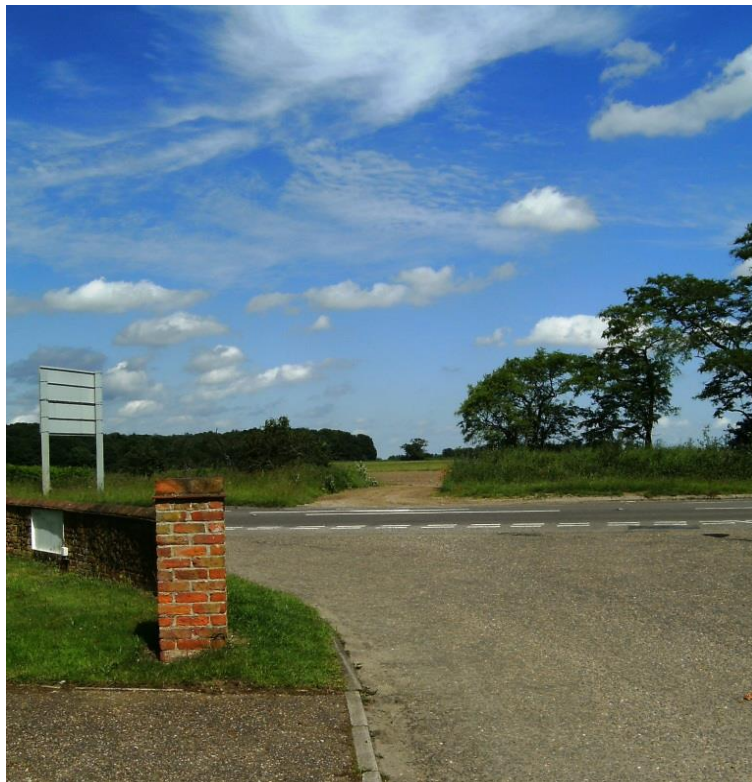
Plate 33: View towards Castle Rising from Knight's Hill Hotel entrance, looking north-west