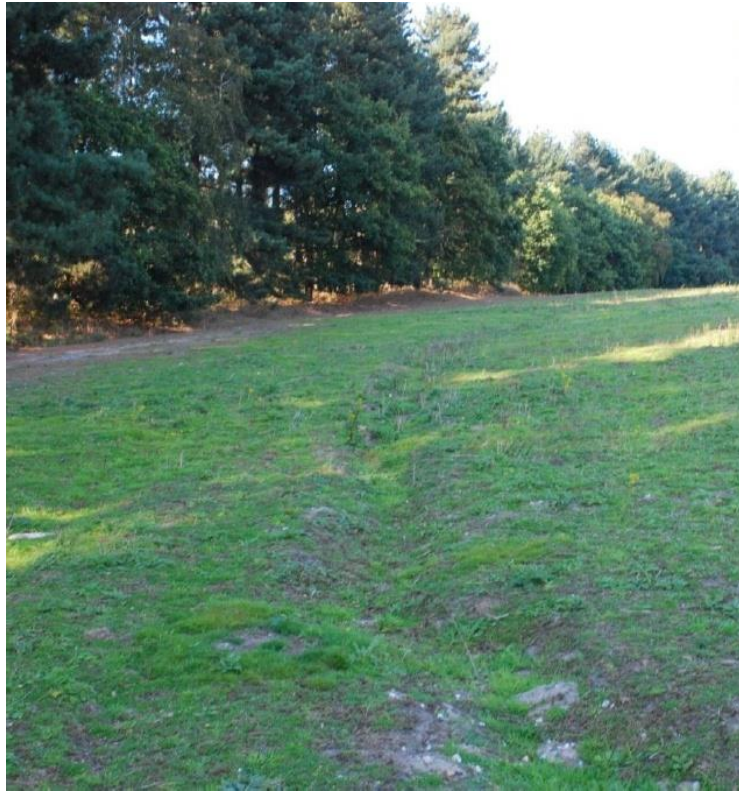
Plate 27a: Field 2, looking north-west across the ditch of the barrow excavated in 1938