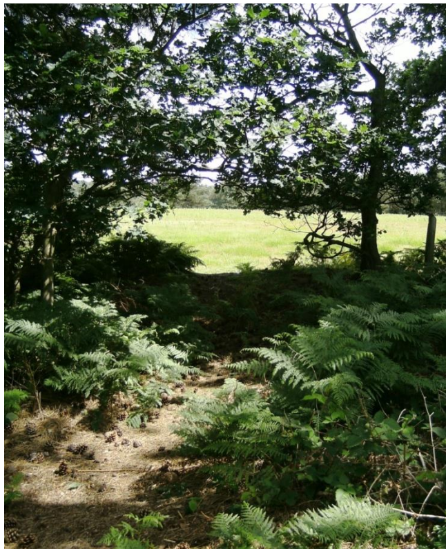
Plate 30: Field 2, parallel earthwork banks and ditch on western boundary, looking east into the site from Reffley Wood