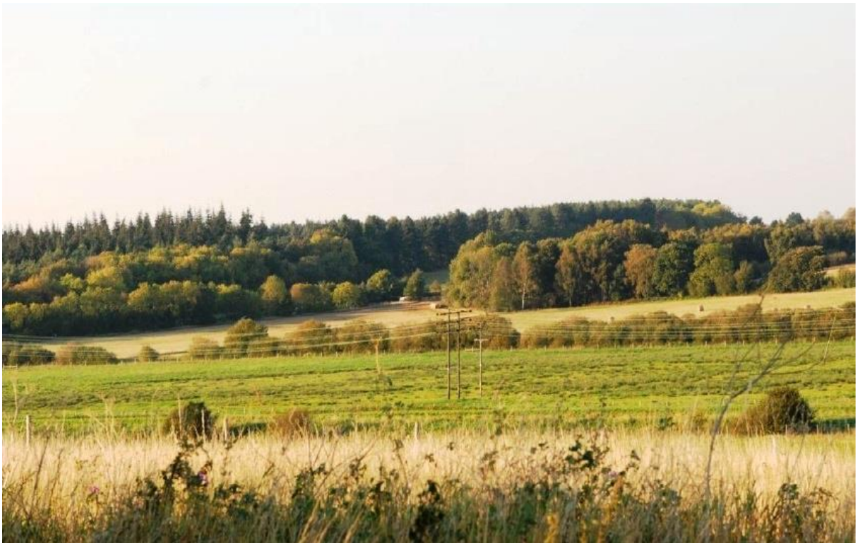
Plate 25a: View from the ruins of St James' Church Bawsey towards Reffley Wood and Field 2, looking north-west