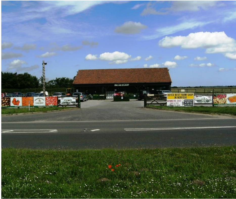
Plate 34: View towards Castle Rising from Knight's Hill Hotel entrance, looking north