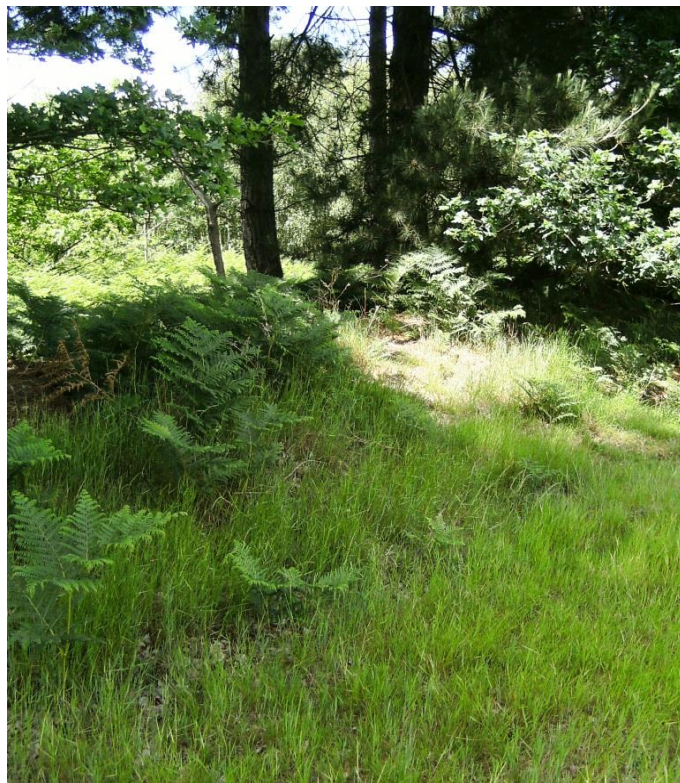
Plate 28: Field 2, earthwork bank on western boundary of field, looking north-west