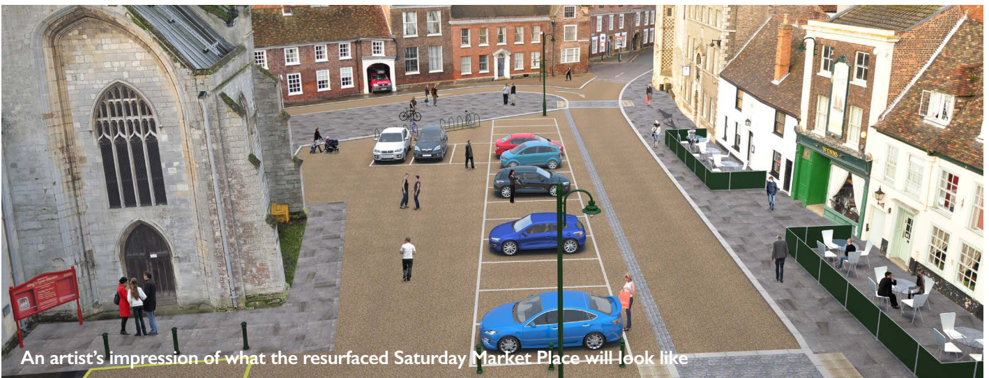
An artist's impression of what the resurfaced Saturday Market Place will look like

The scheme will help to enhance the area, helping to showcase the magnificent heritage which surrounds it whilst making it more suitable for modern use. The one-way traffic system on Queen Street will be extended through the market place, and the number of parking spaces reduced, allowing the road to be narrowed and the pavements in front of the shops and restaurants to be widened, so that businesses along this frontage can have tables outside when the weather is good. Quality materials, such as York stone will be extensively used and historic cobbling will be retained around the walls of the Minster.