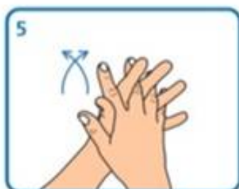
Rub palm to palm with fingers interlaced