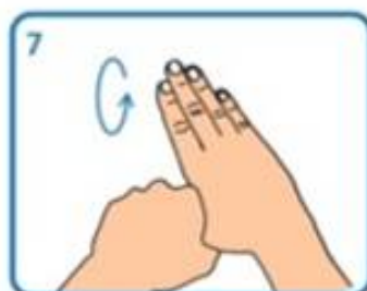
Rub each thumb clasped in opposite hand using a rotational movement