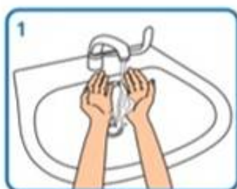
Wet hands with water