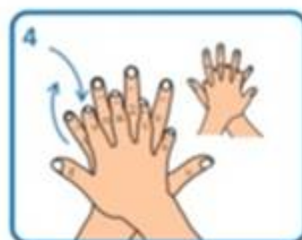
Rub back of each hand with palm of other hand with fingers interlaced