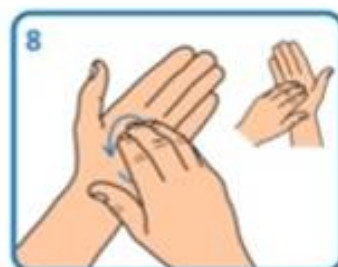
Rub tips of fingers in opposite palm in a circular motion