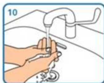
Rinse hands with water