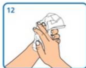
Dry thoroughly with a single-use towel