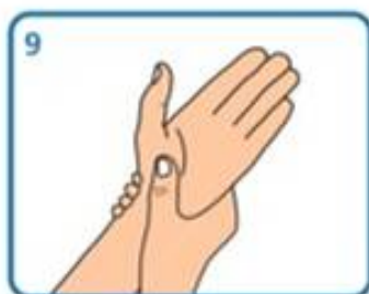
Rub each wrist with opposite hand