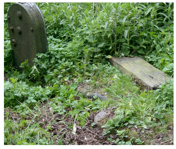
Figure 5: Photo of remains of Outwell Sluice

Remains of the old sluice are still visible at Outwell as this picture shows. A map extract is above showing the canal and tramway at Outwell in the 1800s.