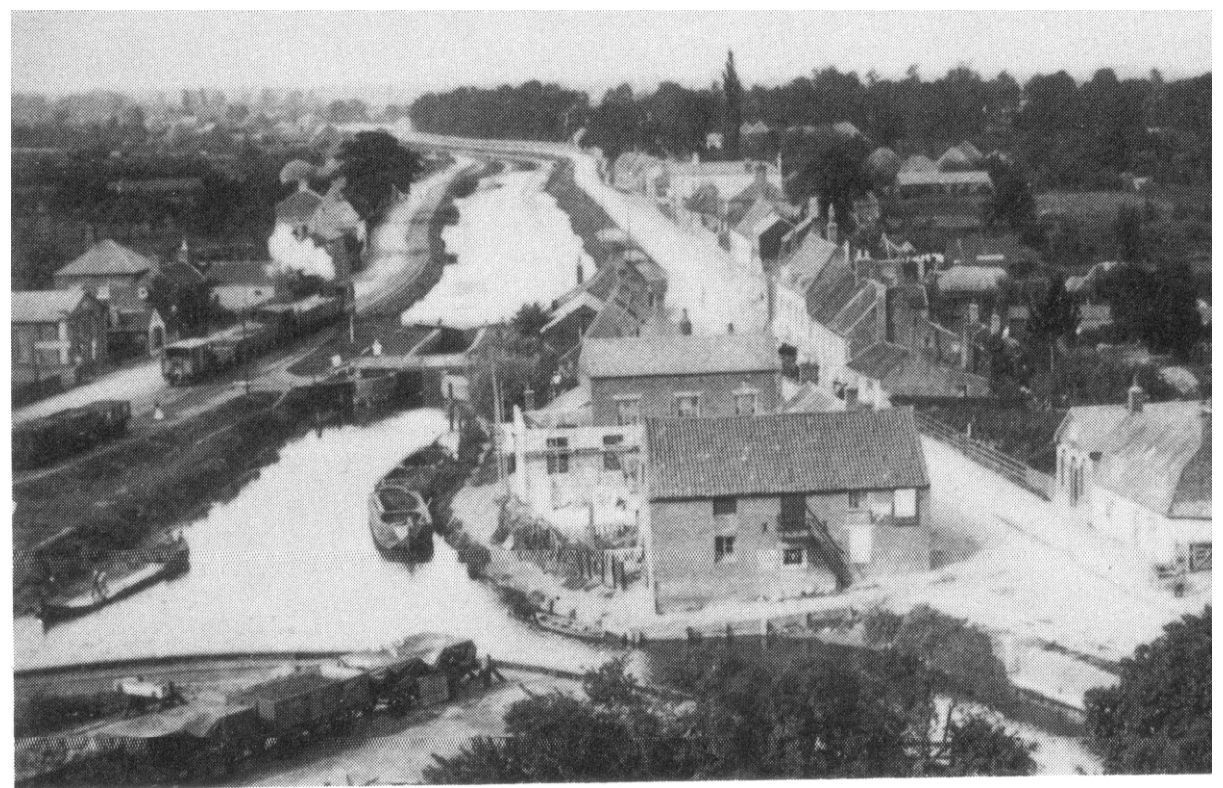
Figure 2: Outwell - Canal, Sluice, Well Creek and tramway in 1800s

The canal was authorised by an Act of Parliament in 1794 and opened in 1797. A tram line opened to Outwell on 20th August 1883. For a time the tramway helped the canal. The line followed the canal to Outwell Basin, where the first stopping point was. The canal widened at the basin so that barges could turn and moor. The canal carried coal for onward transport to the Fens on barges. The canal and tram also carried fruit back from the Fens.