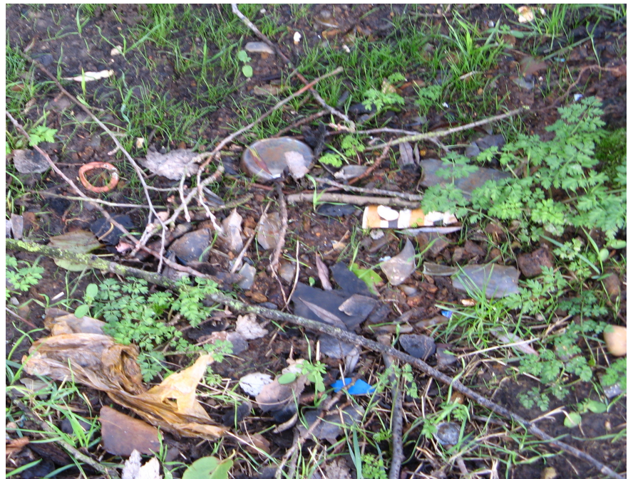
Figure 7: Photo of disturbed waste

As part of this investigation, soil samples were taken from four locations and submitted for laboratory analysis on 14th January 2010. This part of the investigation aimed to show what contaminants might be present in soil near the surface. Samples were collected at 0.2m and 0.5m below ground level. Where waste was present at the surface a sample was collected of the waste material.