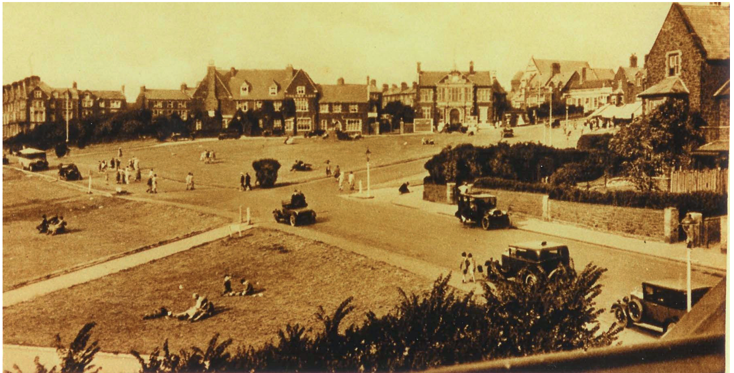
The Green before 1914

Hunstanton St Edmund's is 1 mile south of the village of Hunstanton and forms part of the same parish. It is a rising watering place situated at the southern end of the cliff the terminus of the Lynn and Hunstanton Railway and distant 144 miles from London. The land is owned by Hamon Le Strange, who offers it to the public on building leases for a long term of years, and since the opening of the railway in 1862 a number of good houses, first, second and third class, have been erected... [and] a church has been built in which Divine service is performed, though the building is not completed.