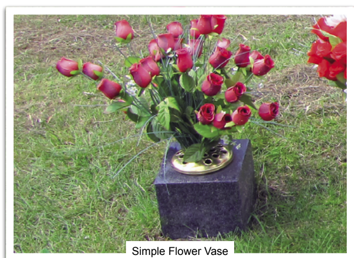
Simple Flower Vase

The council recommends that you take out an insurance policy to cover damage to stone memorials caused by vandalism.