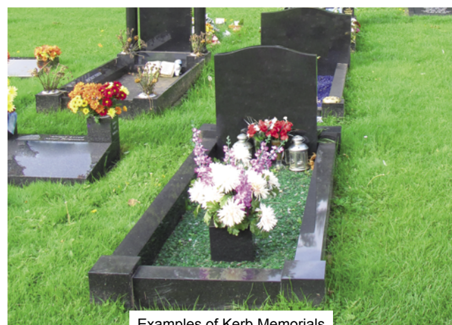
Examples of Kerb Memorials