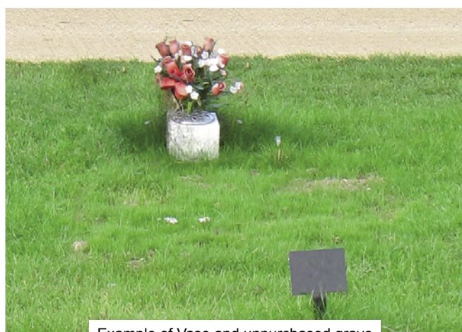
Example of Vase and unpurchased grave

In addition to the fee payable to purchase a grave, you will be charged for the actual burial. Your chosen Funeral Director will advise you of any fees payable in relation to the burial.