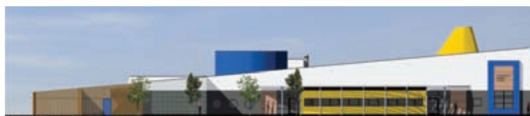
SOUTH EAST (SADDLEBOW ROAD) ELEVATION

The construction of the play area will commence in spring 2010. It is hoped that local children will get involved with identifying the sort of play equipment they would like to be installed in the area and we will of course keep you informed as this project progresses.